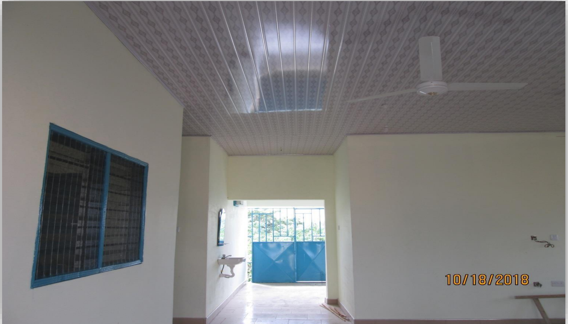
RURAL CLINIC WITH MECHANIZED BOREHOLE AT ADUBINSOKESE – CONTINUED, AFIGYA KWABRE DISTRICT