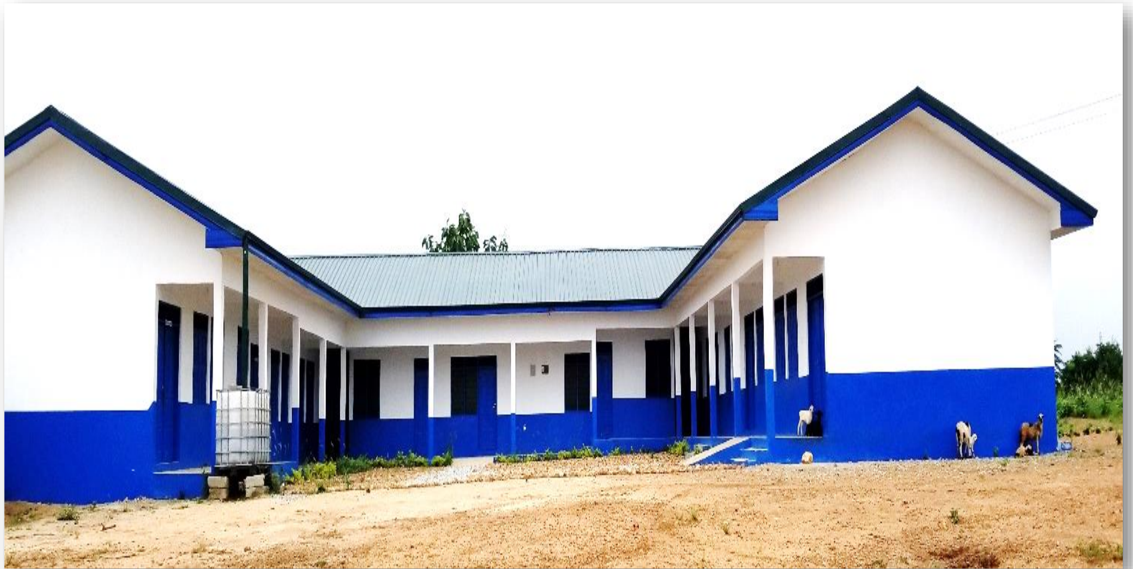
6-UNIT CLASSROOM BLOCK WITH 8-SEATER LATERINE AT EGYIRIFA, MFANTSEMAN MUNICIPALITY