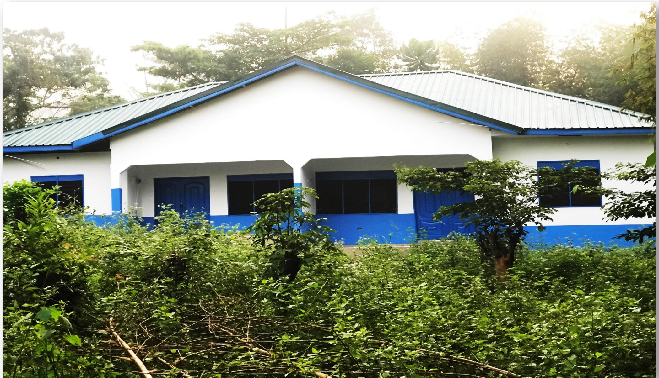
NURSES' QUARTERS WITH MECHANIZED BOREHOLE AT HEMAN, FANTEAKWA DISTRICT