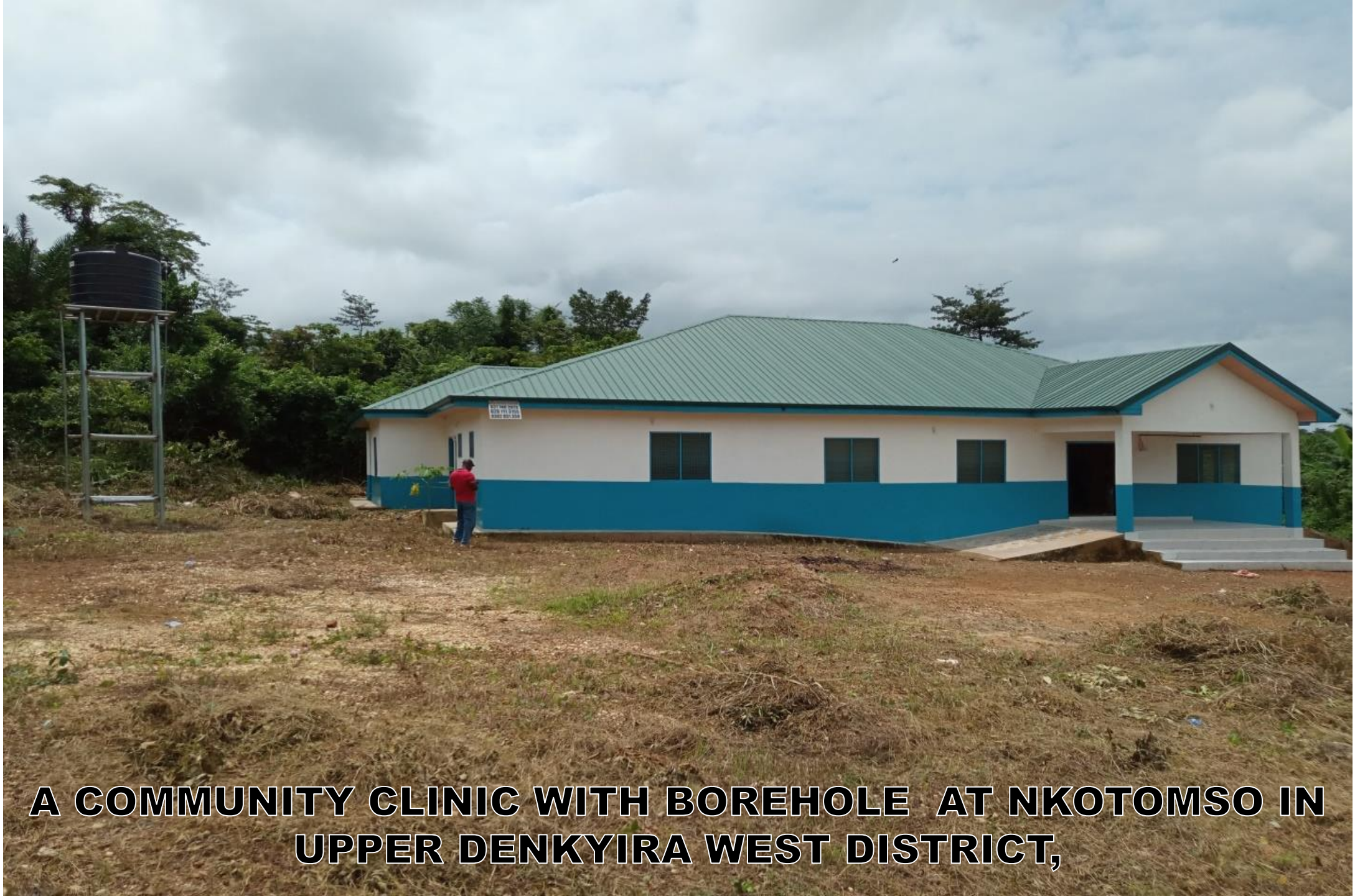
A COMMUNITY CLINIC WITH BOREHOLE AT NKOTOMSO IN UPPER DENKYIRA WEST DISTRICT,