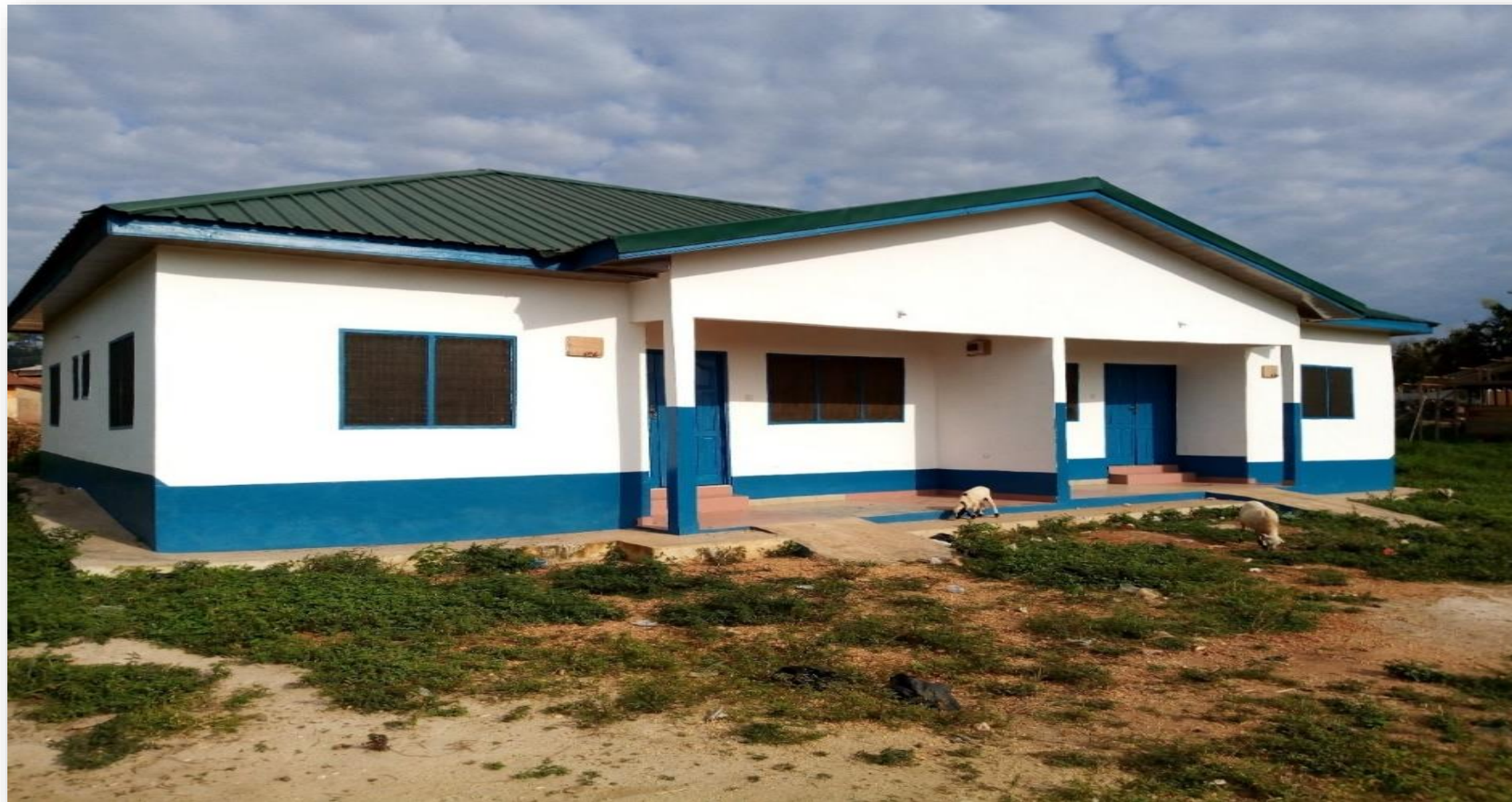
TEACHERS' QUARTERS WITH MECHANIZED BOREHOLE AT NYINAWUSU, UPPER DENKYIRA WEST DISTRICT