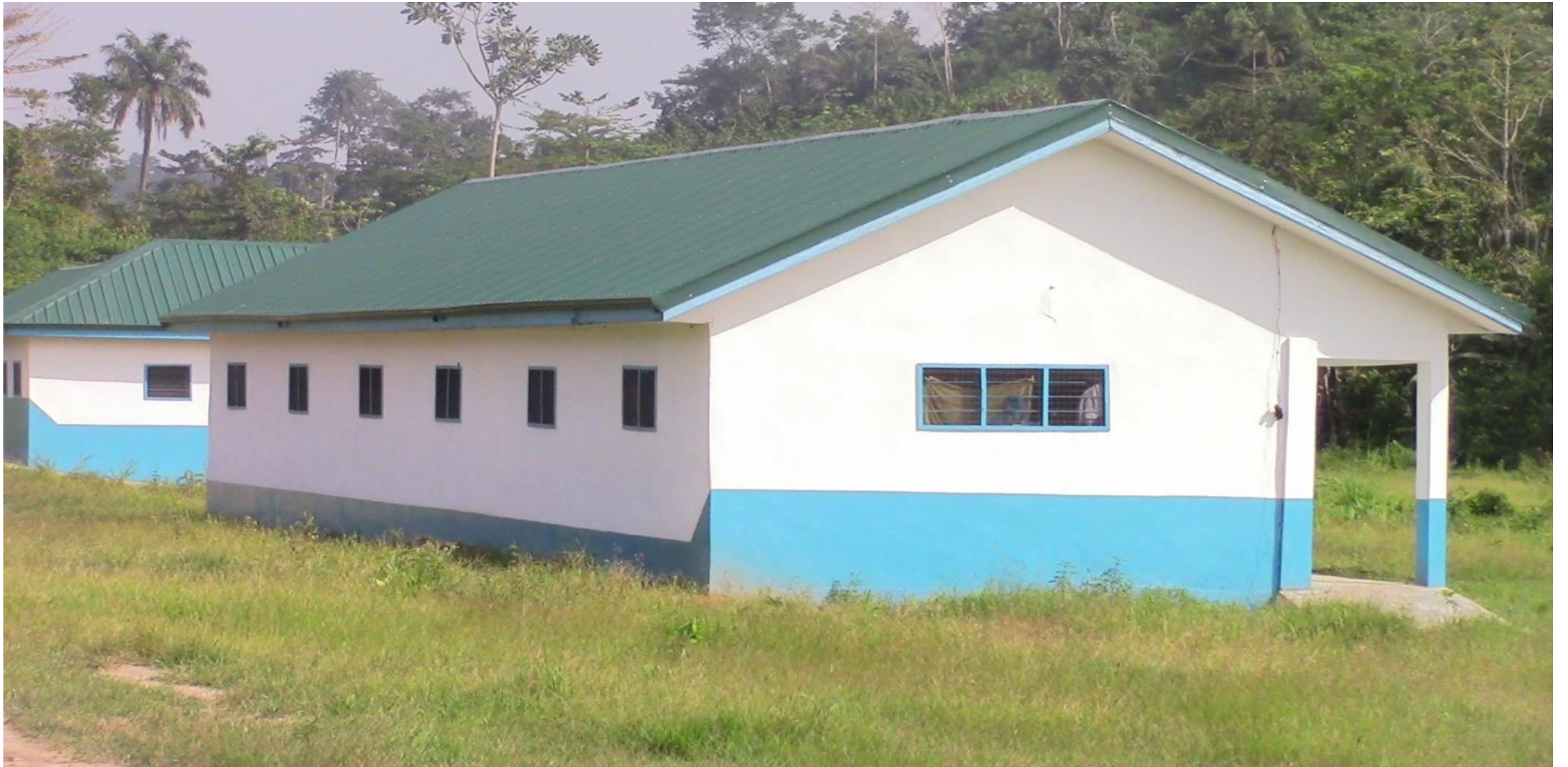
LOCKABLE WAREHOUSE ATTACHED TO THE MARKET AT ASANKRAGUA, AMENFI WEST MUNICIPALITY