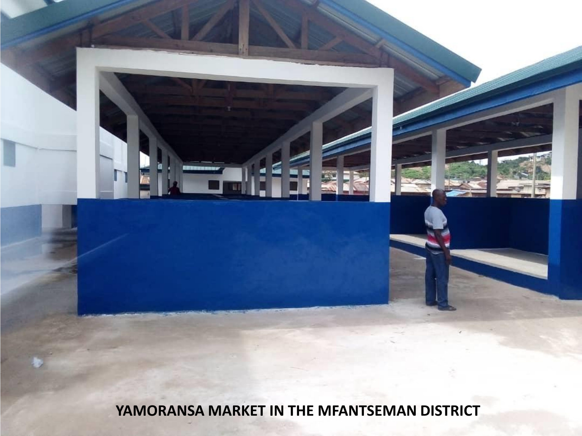
YAMORANSA MARKET IN THE MFANTSEMAN DISTRICT