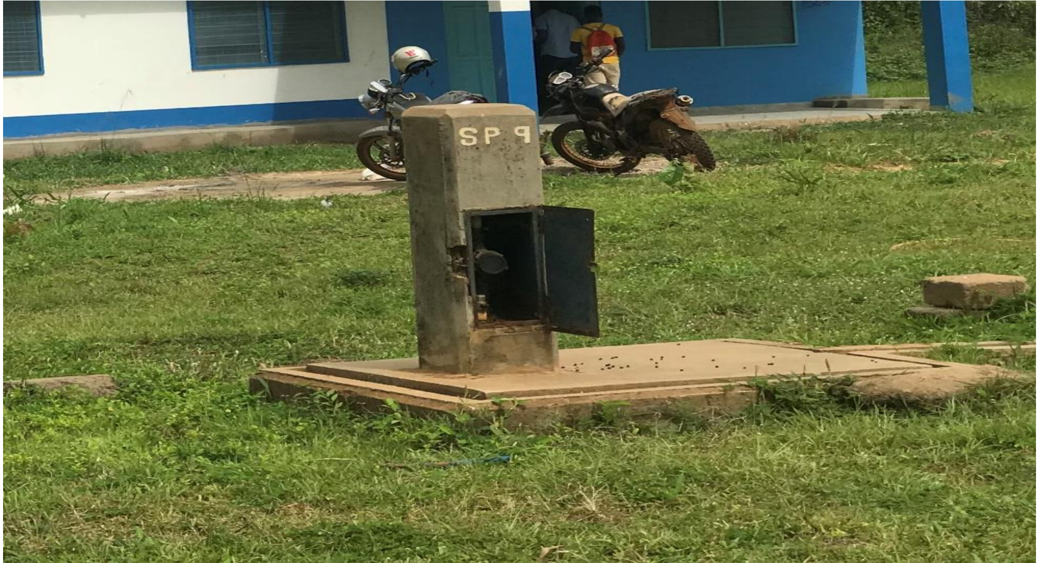
COMMUNITY MECHANIZED BOREHOLE AT SIBI CENTRAL, NKWANTA NORTH DISTRICT