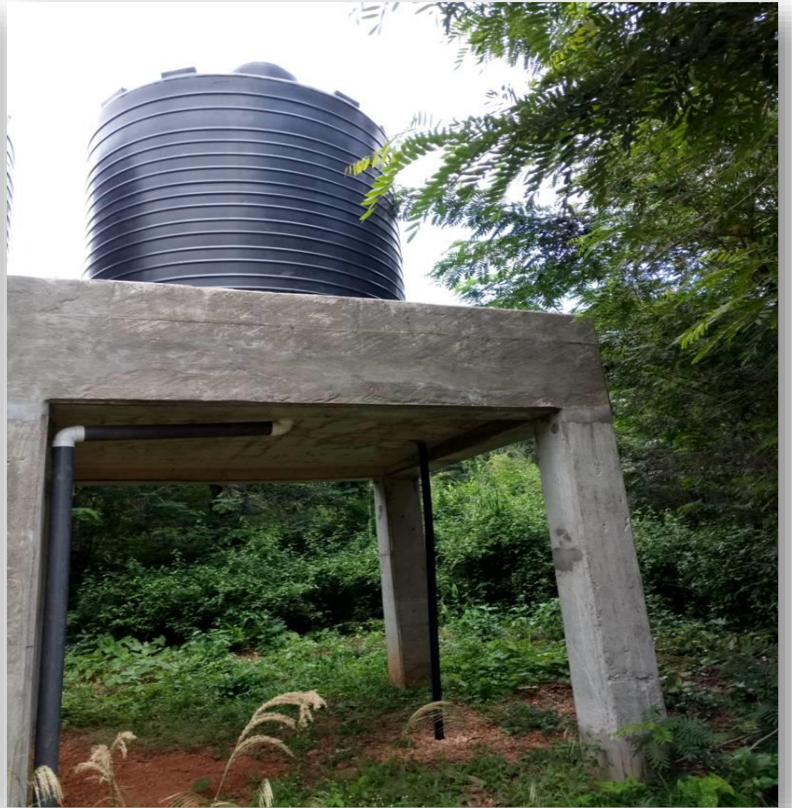
COMMUNITY MECHANIZED BOREHOLE AT DZOLO GBORGAME TORGODO, HO WEST