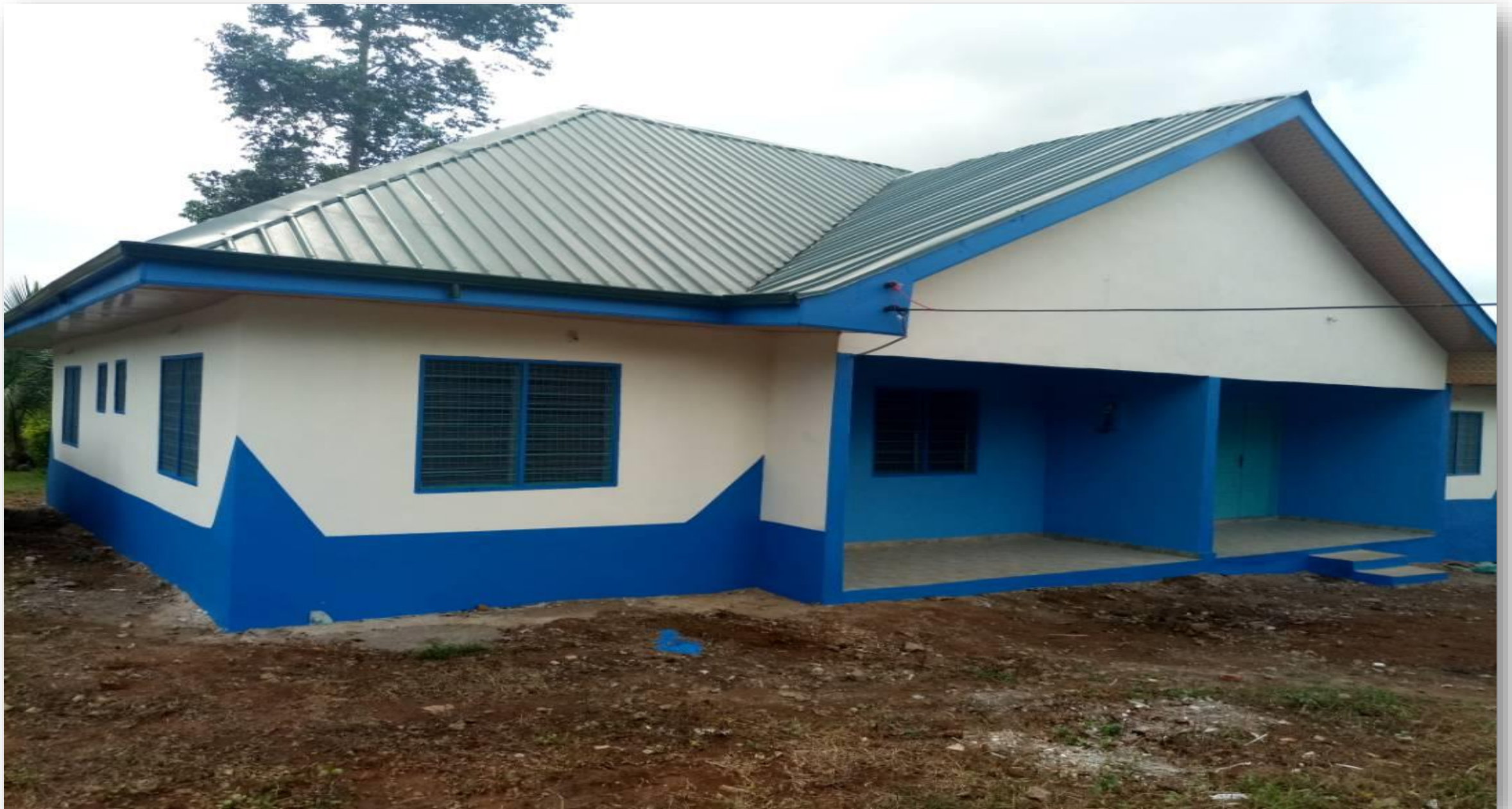
TEACHERS' QUARTERS WITH MECHANIZED BOREHOLE AT ANFOETA KYEBI, HO WEST DISTRICT