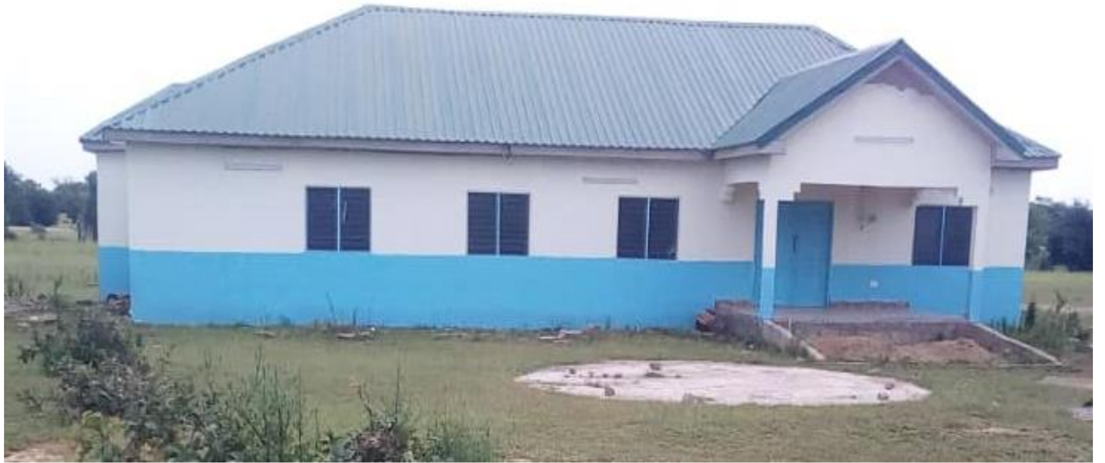
CLINIC AT MIRIGU, KASSANA NANKANA WEST REGION