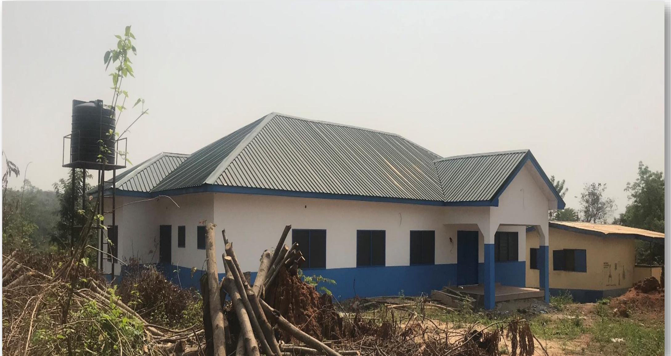
RURAL CLINIC WITH MECHANIZED BOREHOLE AT BISA, UPPER MANYA KROBO DISTRICT