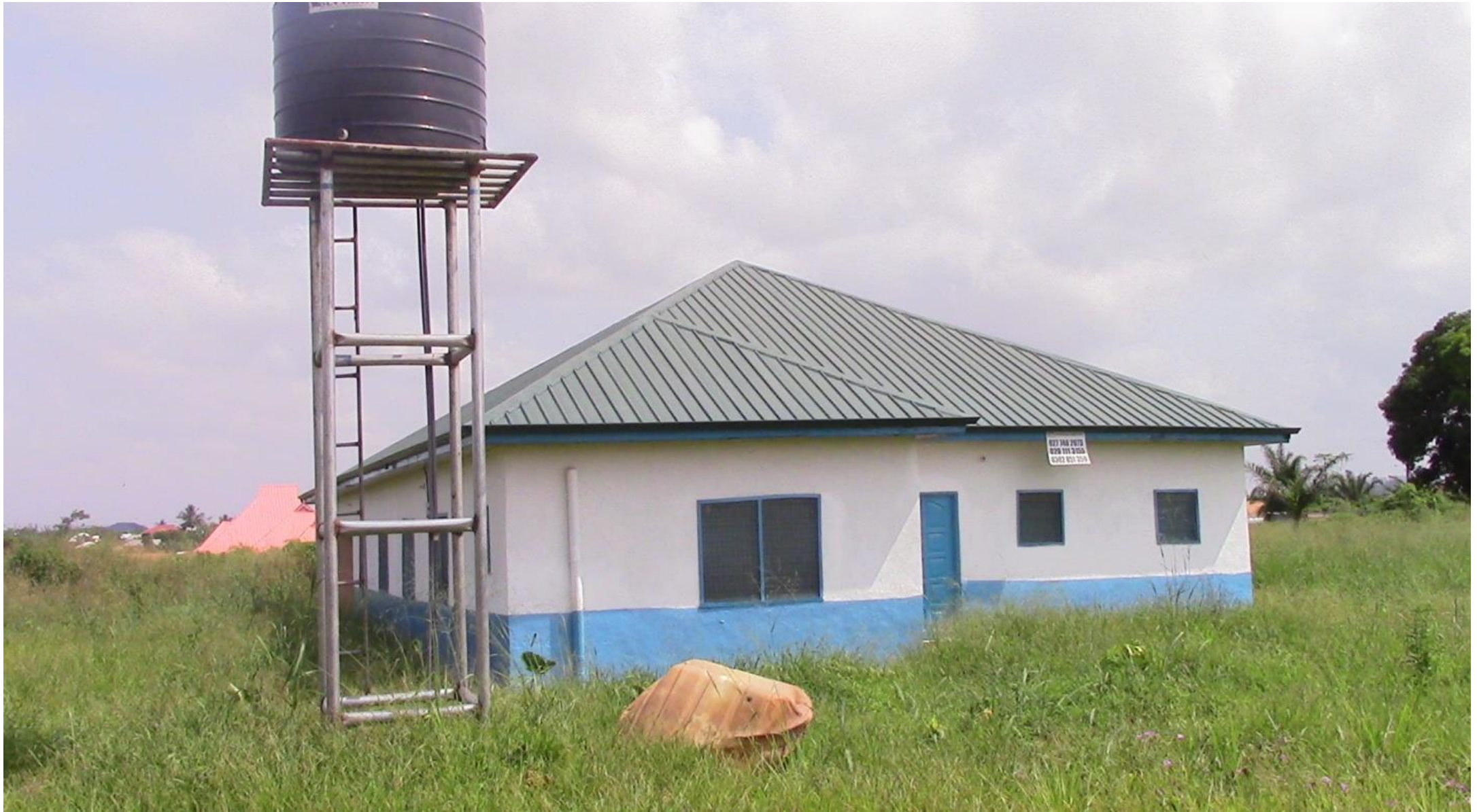
MECHANIZED BOREHOLE ATTACHED TO THE RURAL CLINIC AT AKWABOSO, UPPER DENKYIRA WEST DISTRICT