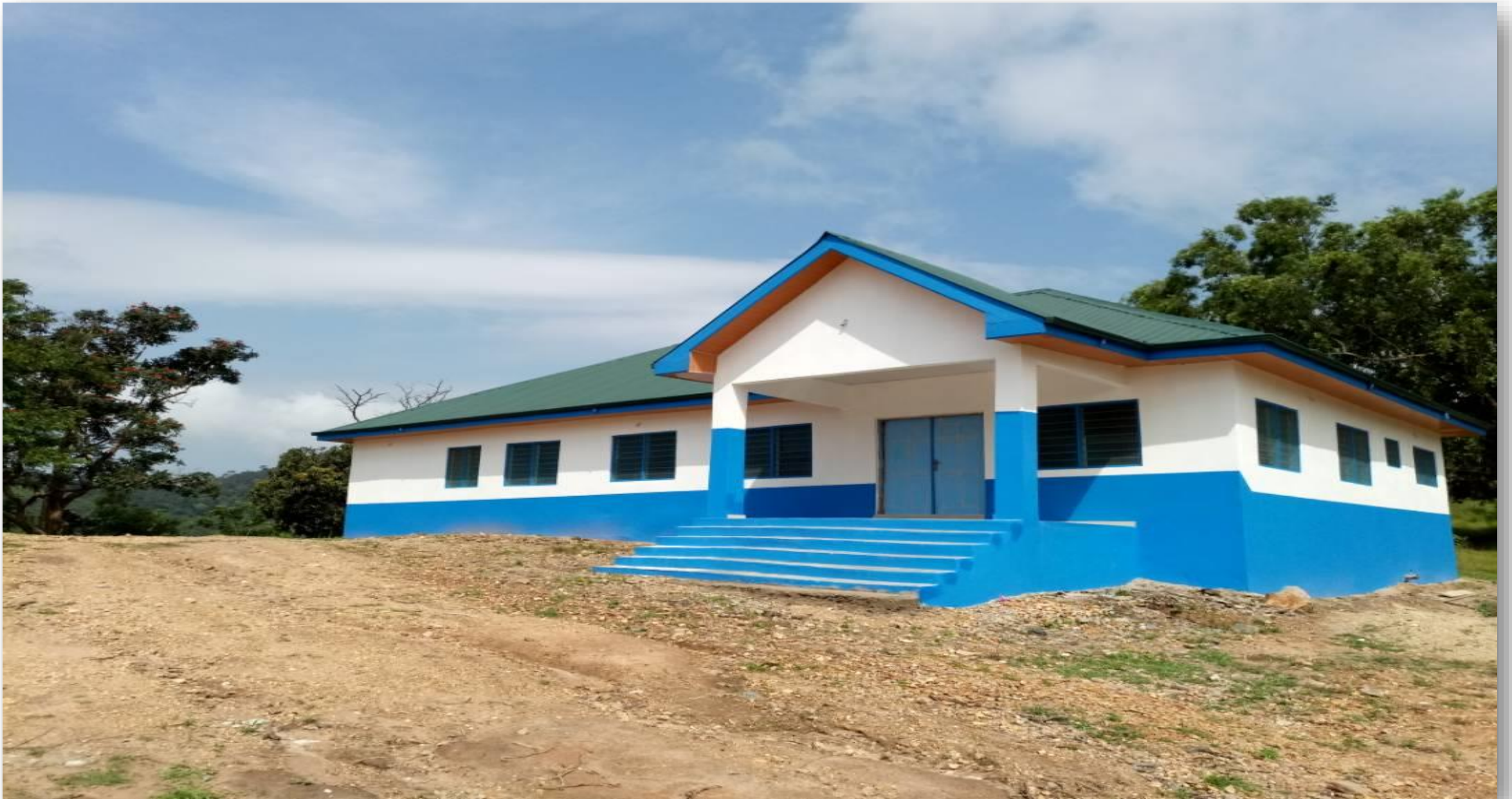
RURAL CLINIC WITH MECHANIZED BOREHOLE AT VANE AVATIME, HO WEST DISTRICT