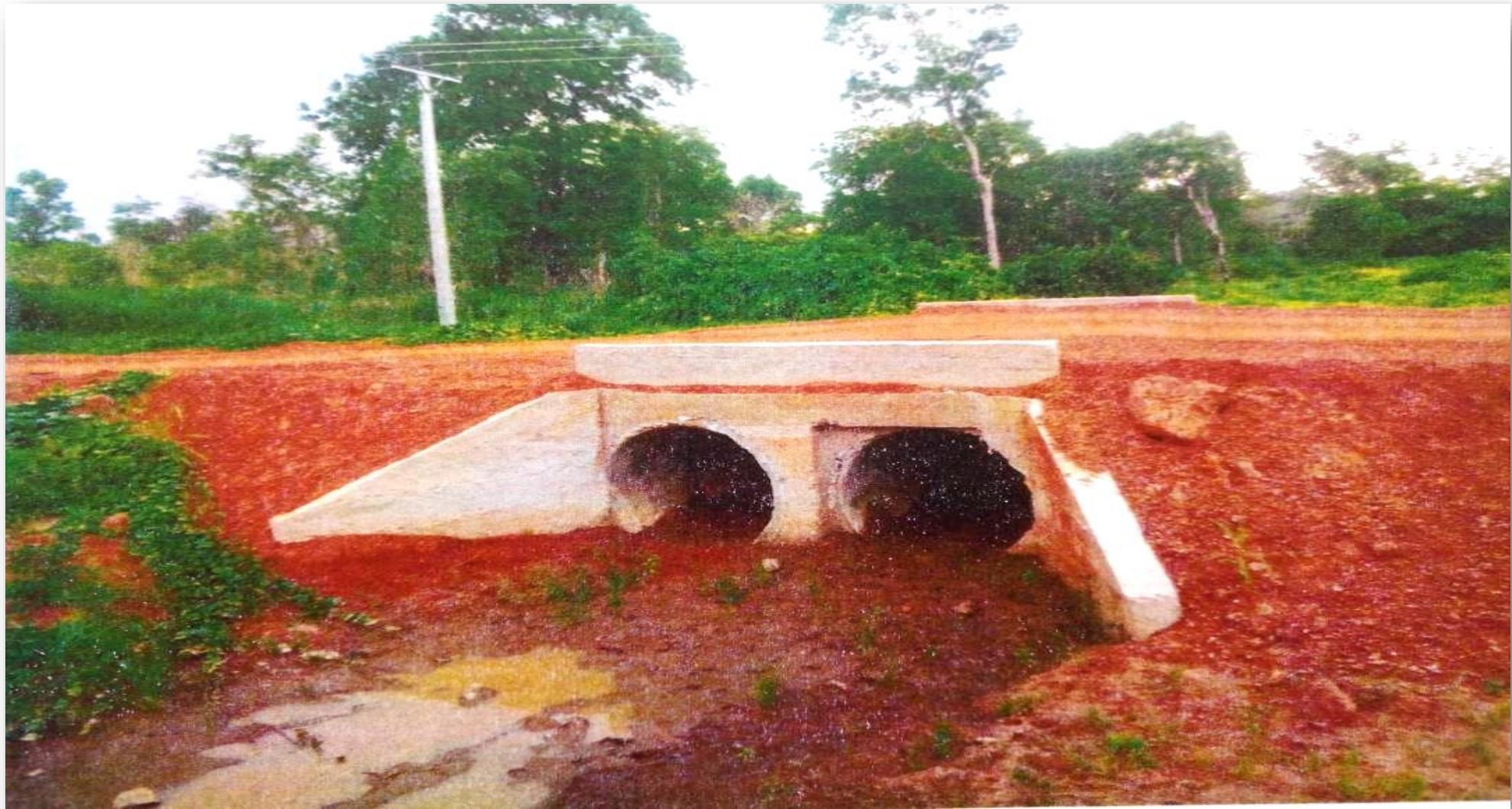
CULVERT AT BONINKA, SENE EAST DISTRICT