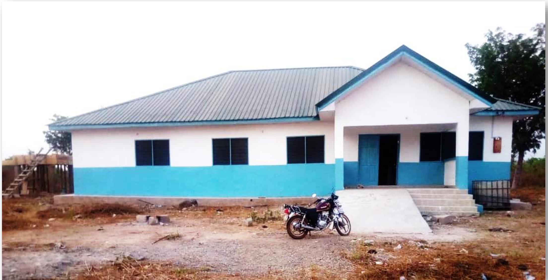
RURAL CLINIC WITH MECHANIZED BOREHOLE AT LEMU, SENE WEST DISTRICT