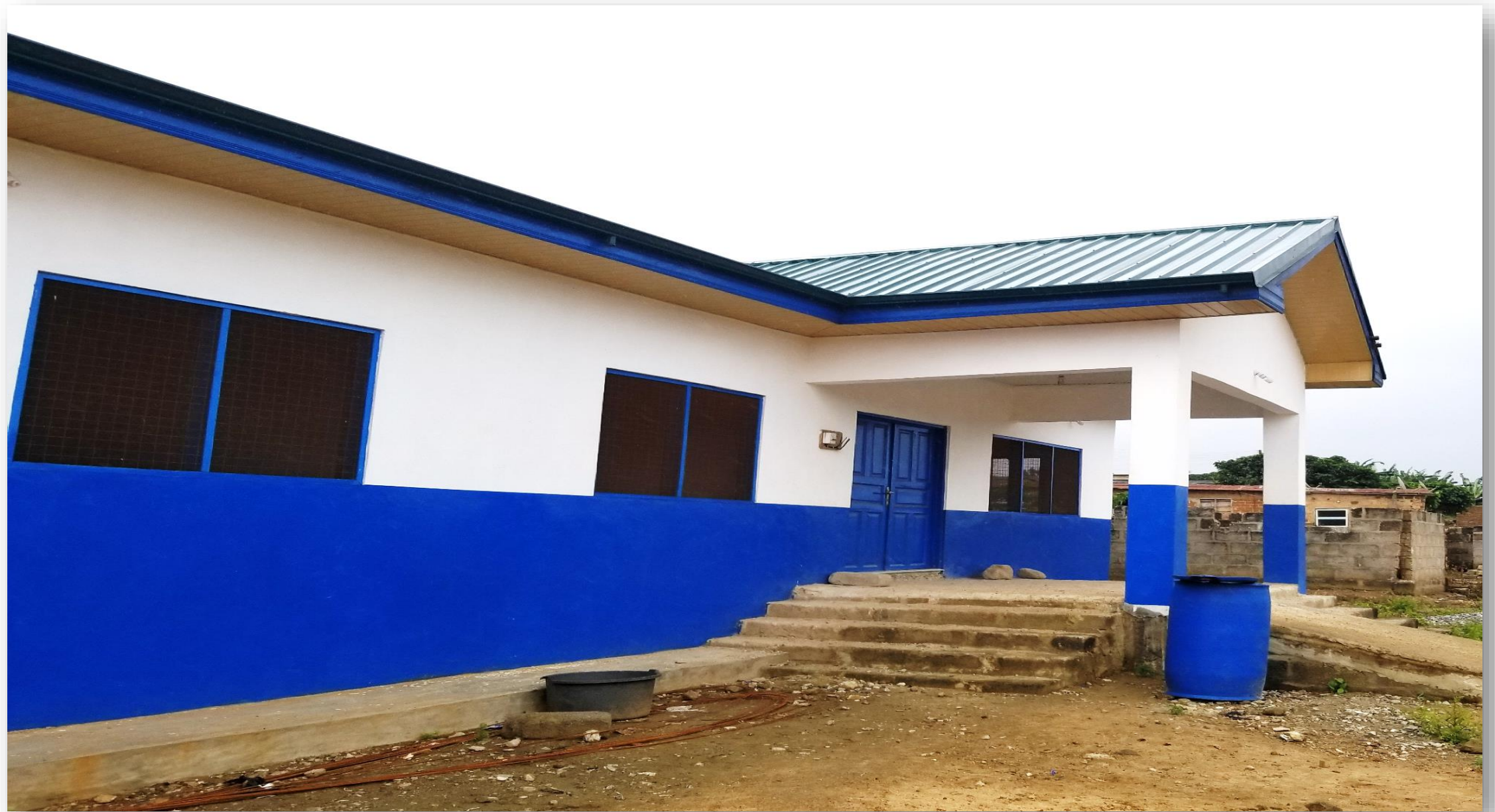
RURAL CLINIC WITH MECHANIZED BOREHOLE AT ENYAN APAA, MFANTSEMAN MUNICIPALITY