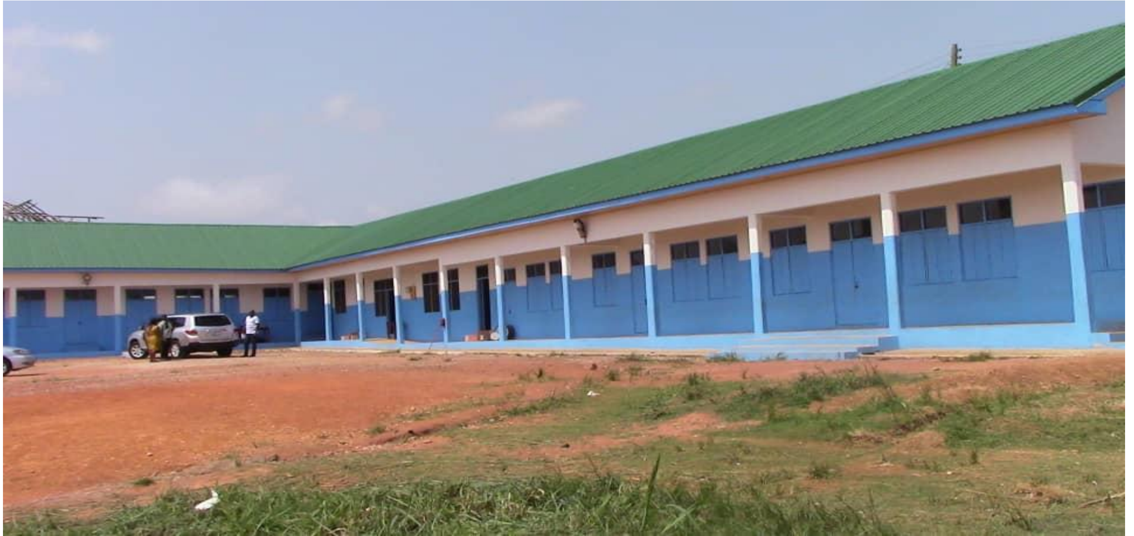
6-UNIT CLASSROOM BLOCK WITH 8-SEATER LATERINE AT KAGYASE , KUMASI METROPLITAN