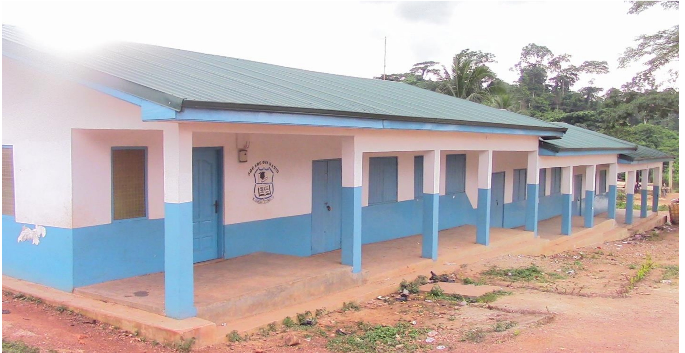
3-UNIT CLASSROOM BLOCK AT ADEADE, UPPER DENKYIRA WEST DISTRICT