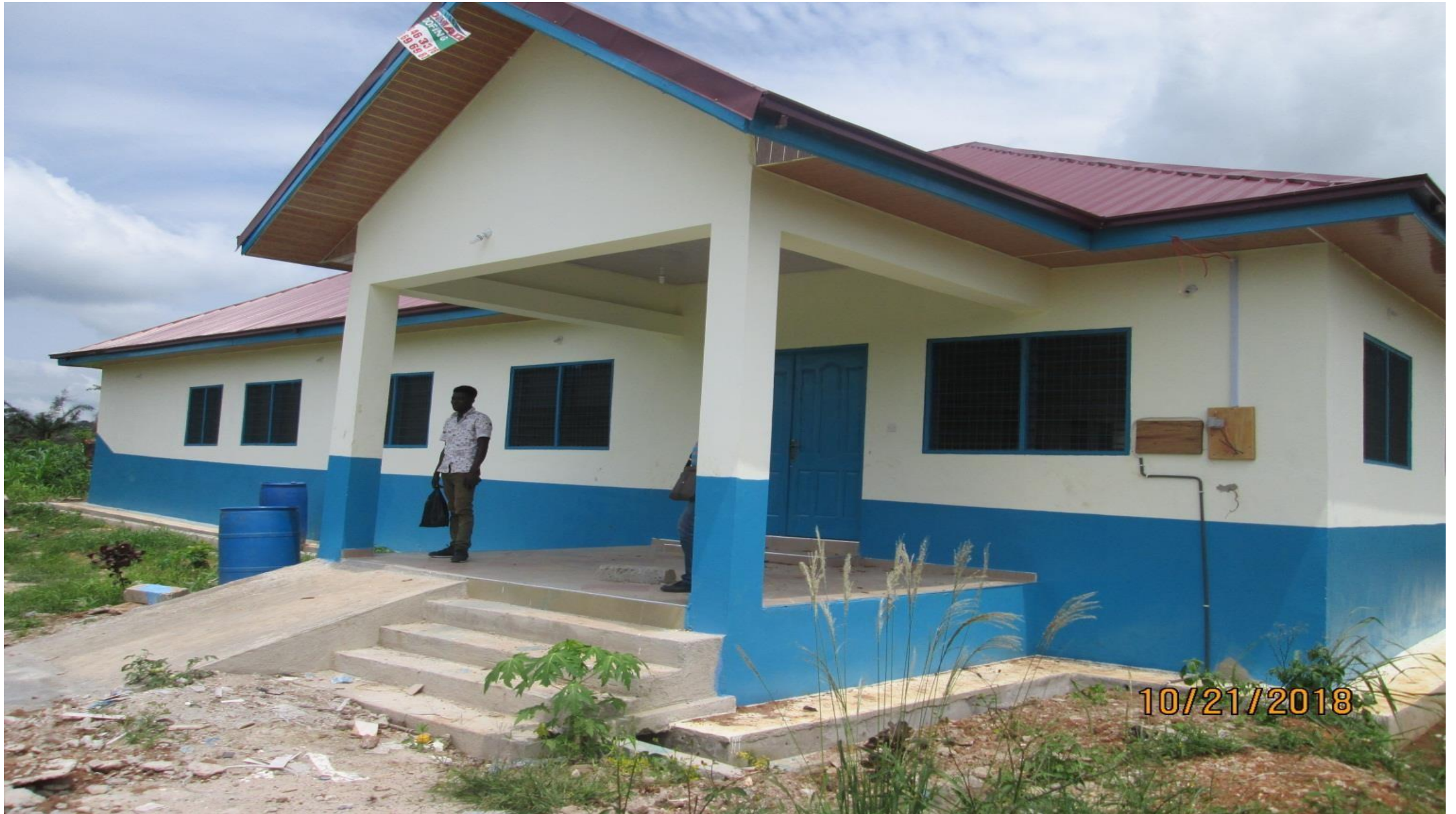
MATERNITY CENTER WITH MECHANIZED BOREHOLE AT FAWOMAN, AHAFO ANO SOUTH DISTRICT