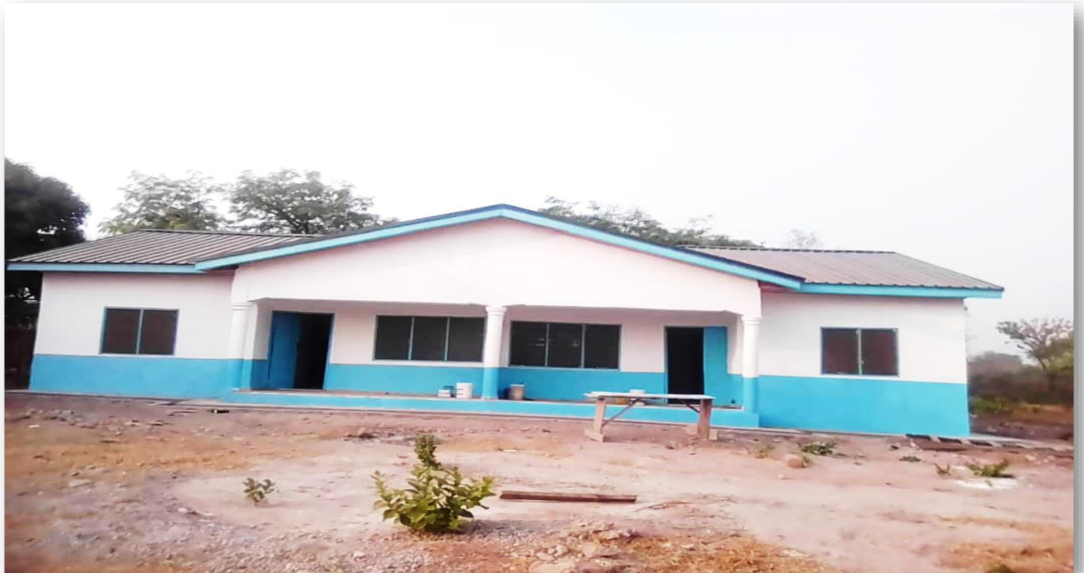
TEACHERS' QUARTERS WITH MECHANIZED BOREHOLE AT PREMUASE, SENE EAST DISTRICT