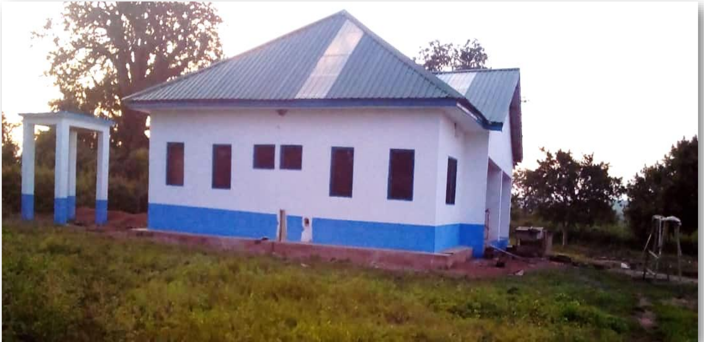
NURSES' QUARTERS WITH MECHANIZED BOREHOLE AT JUALI, NANUMBA SOUTH DISTRICT