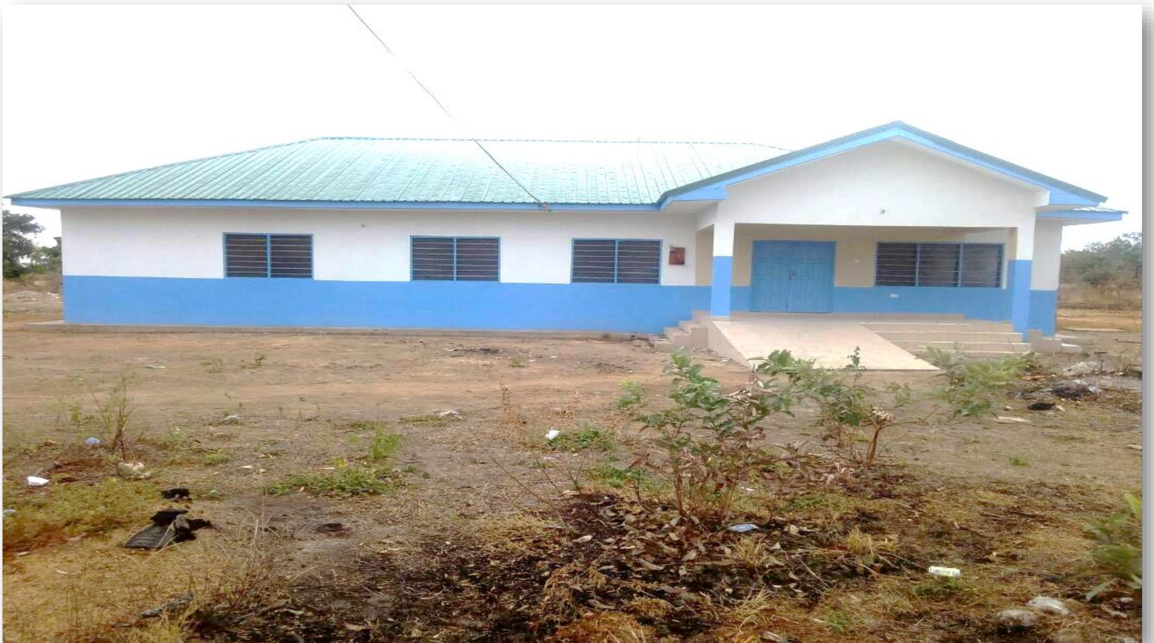
RURAL CLINIC WITH MECHANIZED BOREHOLE AT CHALLU, SISSALA EAST DISTRICT