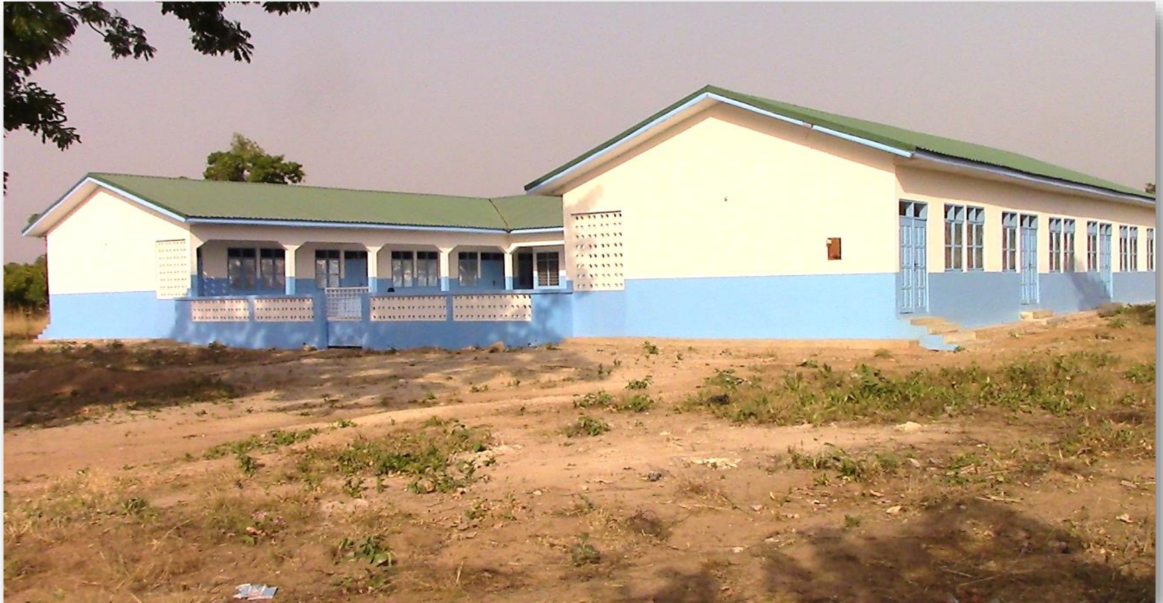
6-UNIT CLASSROOM BLOCK WITH 8-SEATER LATRINE AT WECHIAU, WA WEST DISTRICT