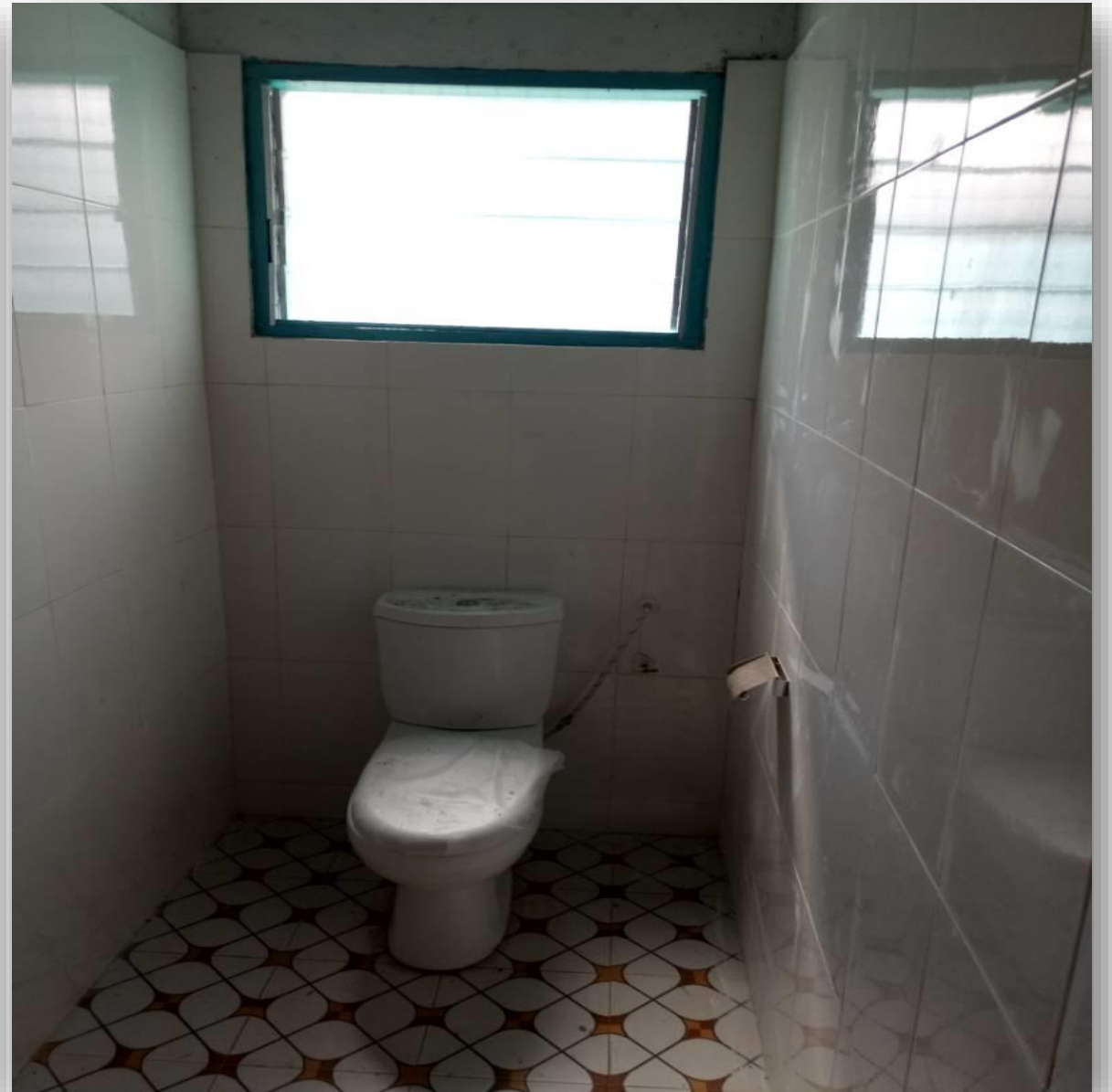
TEACHERS' QUARTERS WITH MECHANIZED BOREHOLE AT ANFOETA KYEBI-CONT..., HO WEST DISTRICT