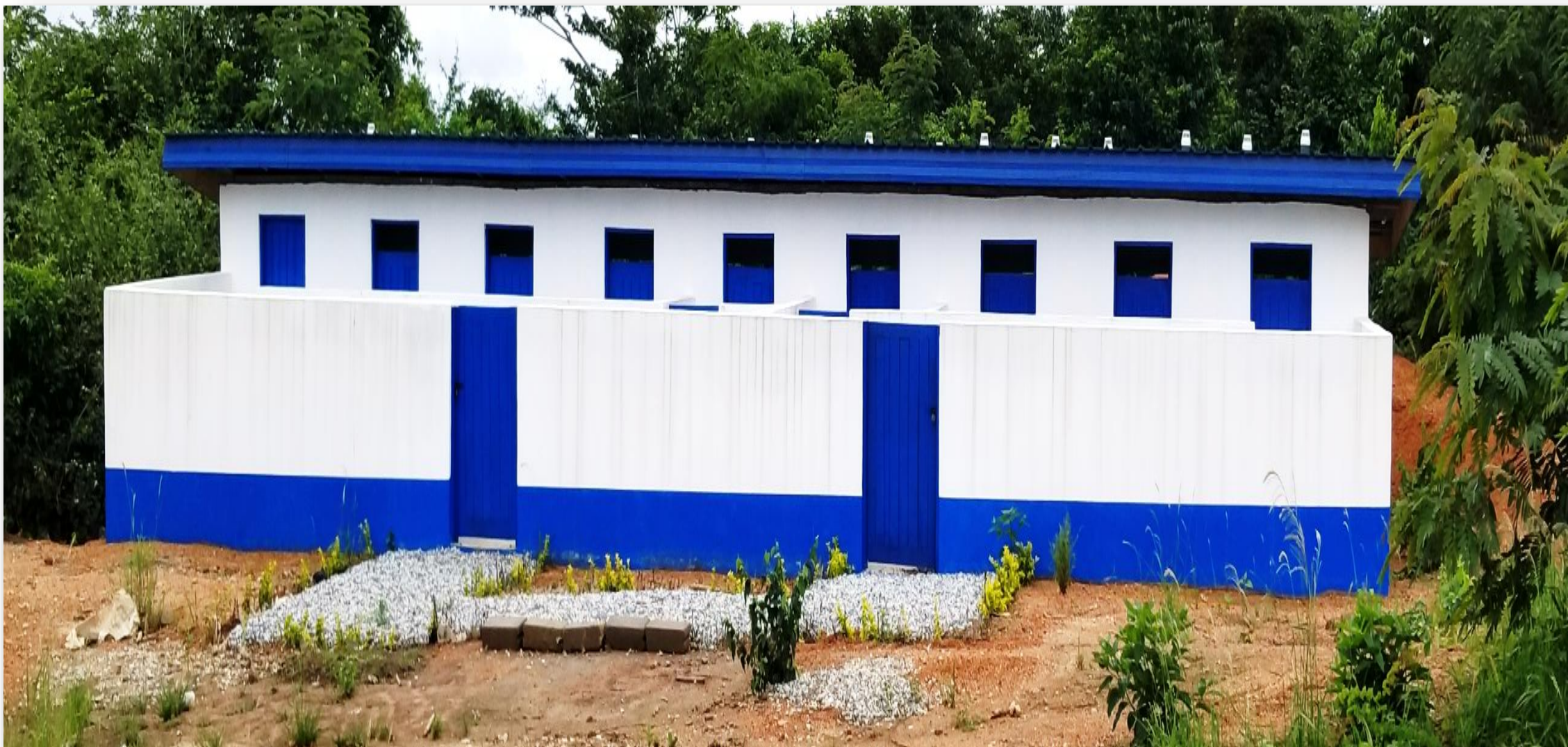
8-SEATER LATERINE ATTACHED TO THE 6-UNIT CLASSROOM BLOCK AT EGYIRIFA, MFANTSEMAN MUNICIPALITY