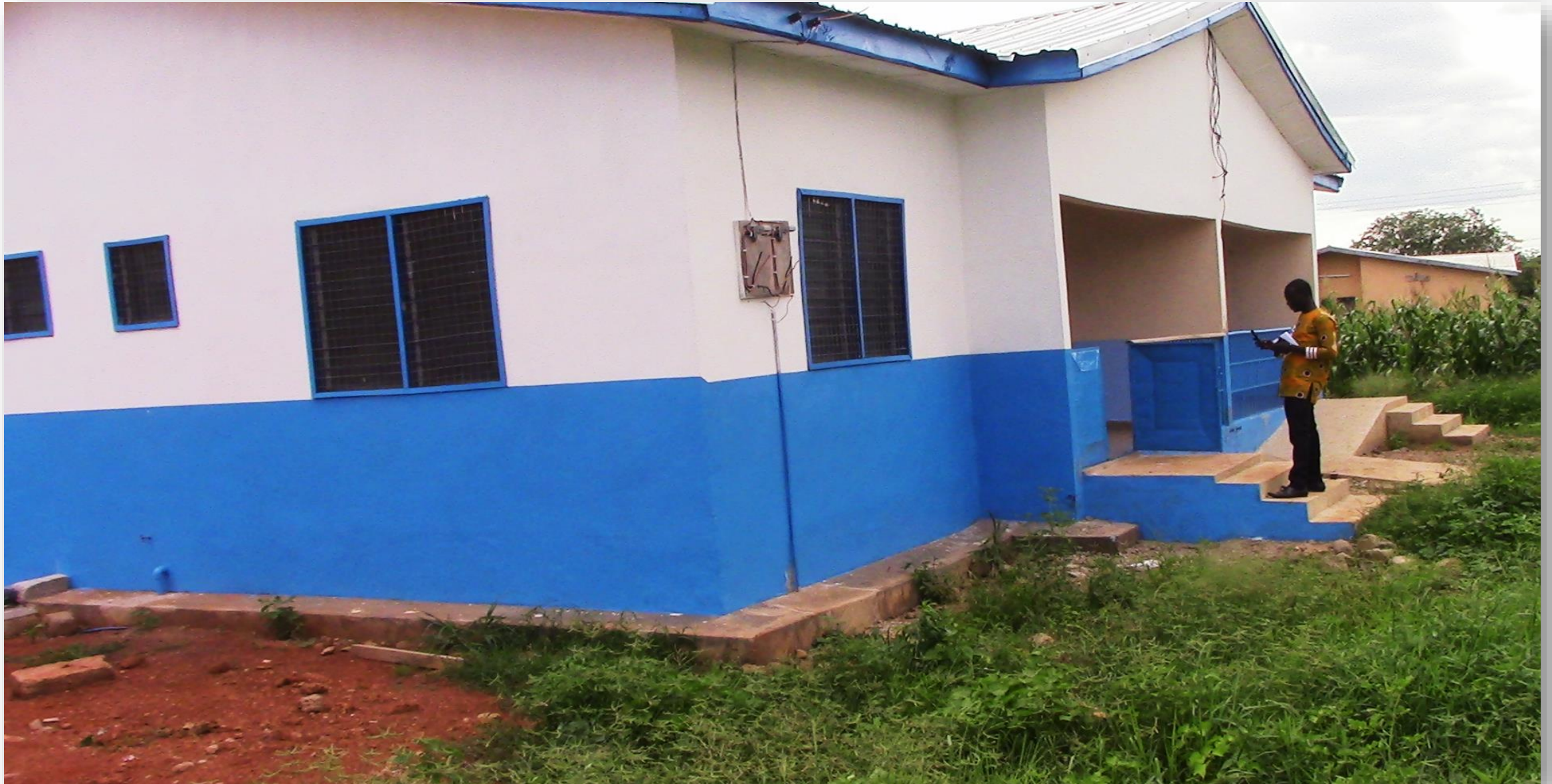
NURSES' QUARTERS WITH MECHANIZED BOREHOLE AT BUNKPURUGU, BUNKPURUGU-YUNYOO DISTRICT