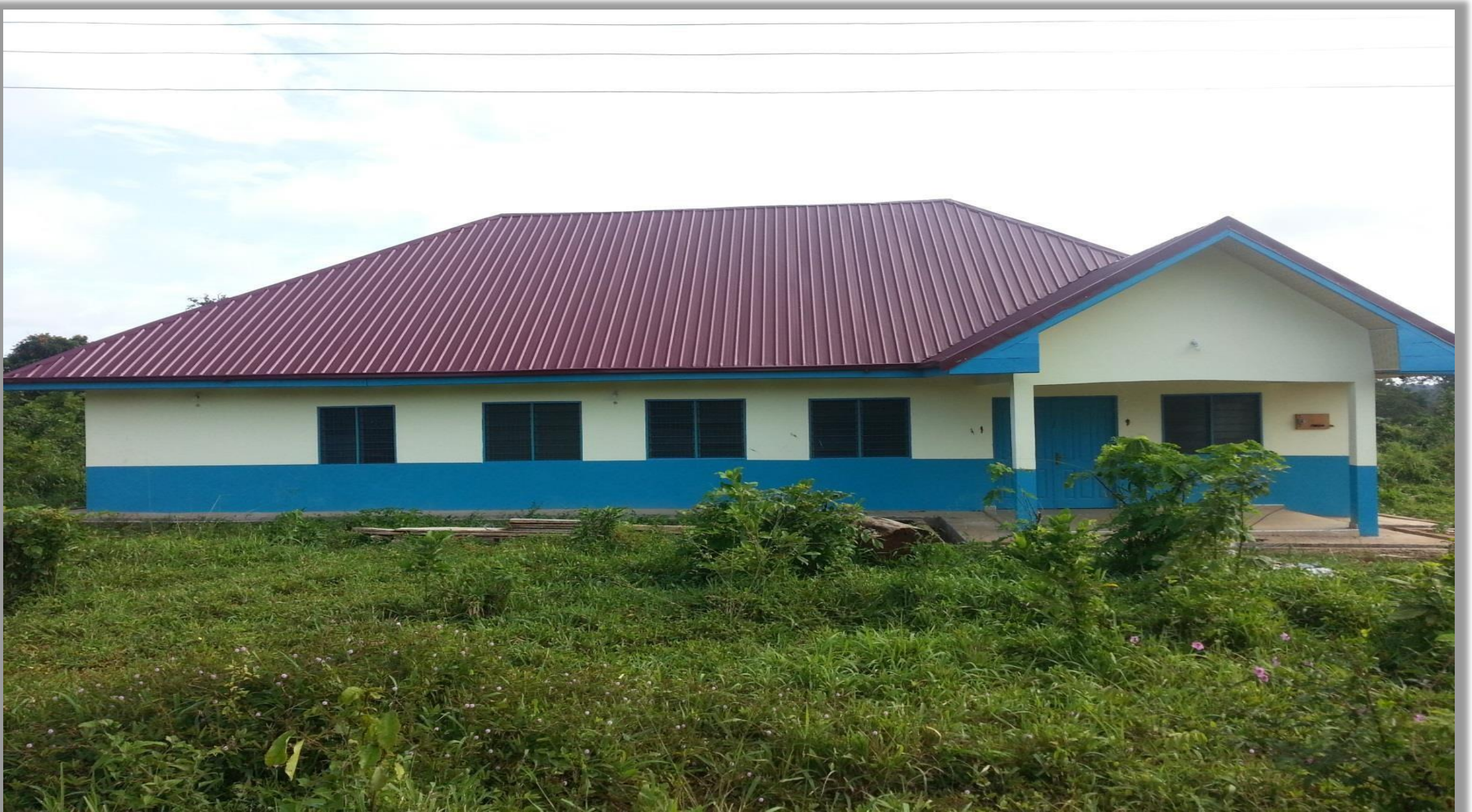
RURAL CLINIC WITH MECHANIZED BOREHOLE AT WUROMSO, AHAFO ANO SOUTH DISTRICT