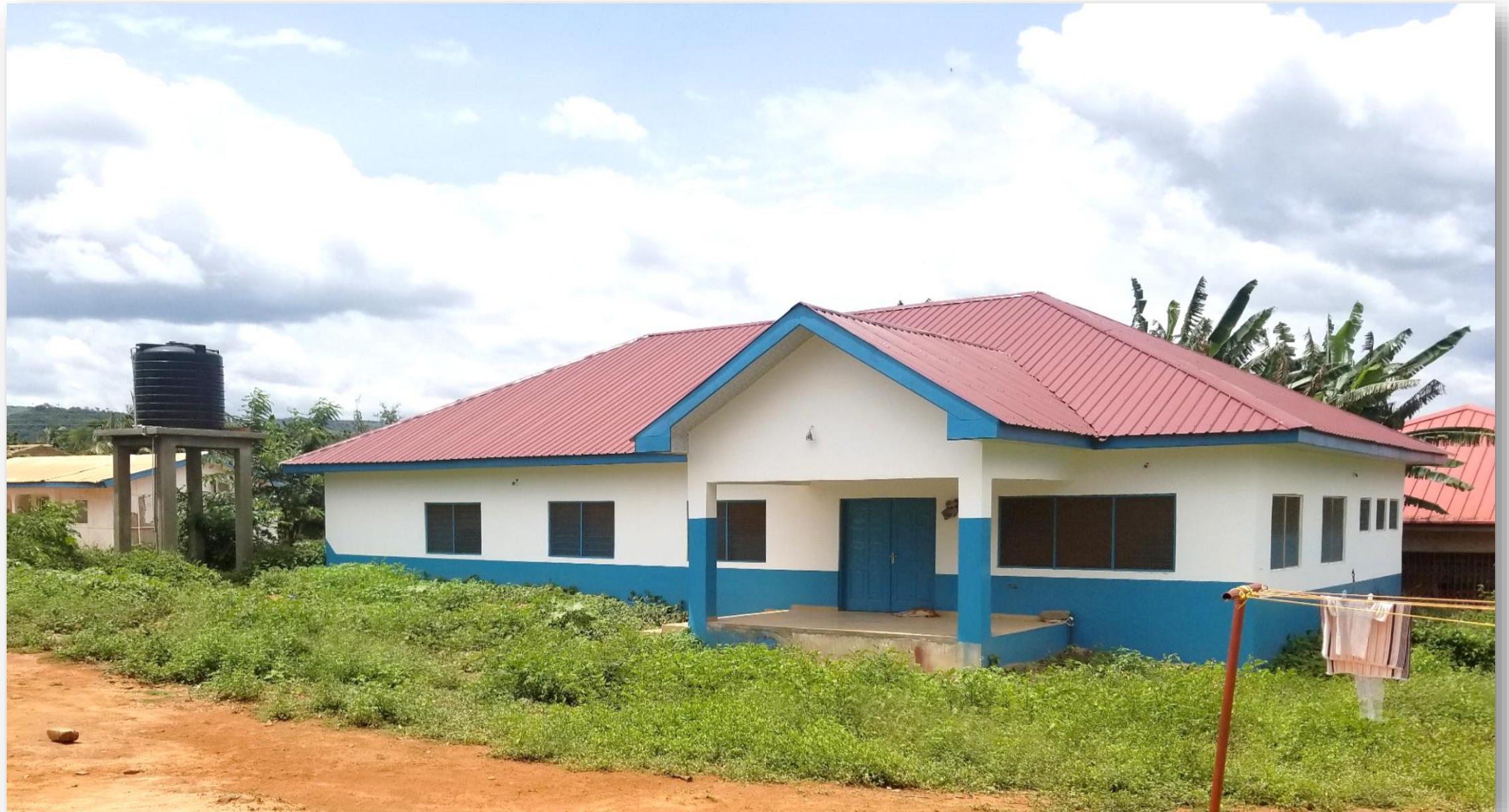
RURAL CLINIC WITH MECHANIZED BOREHOLE AT HAATSO BOI, GA EAST MUNICIPALITY