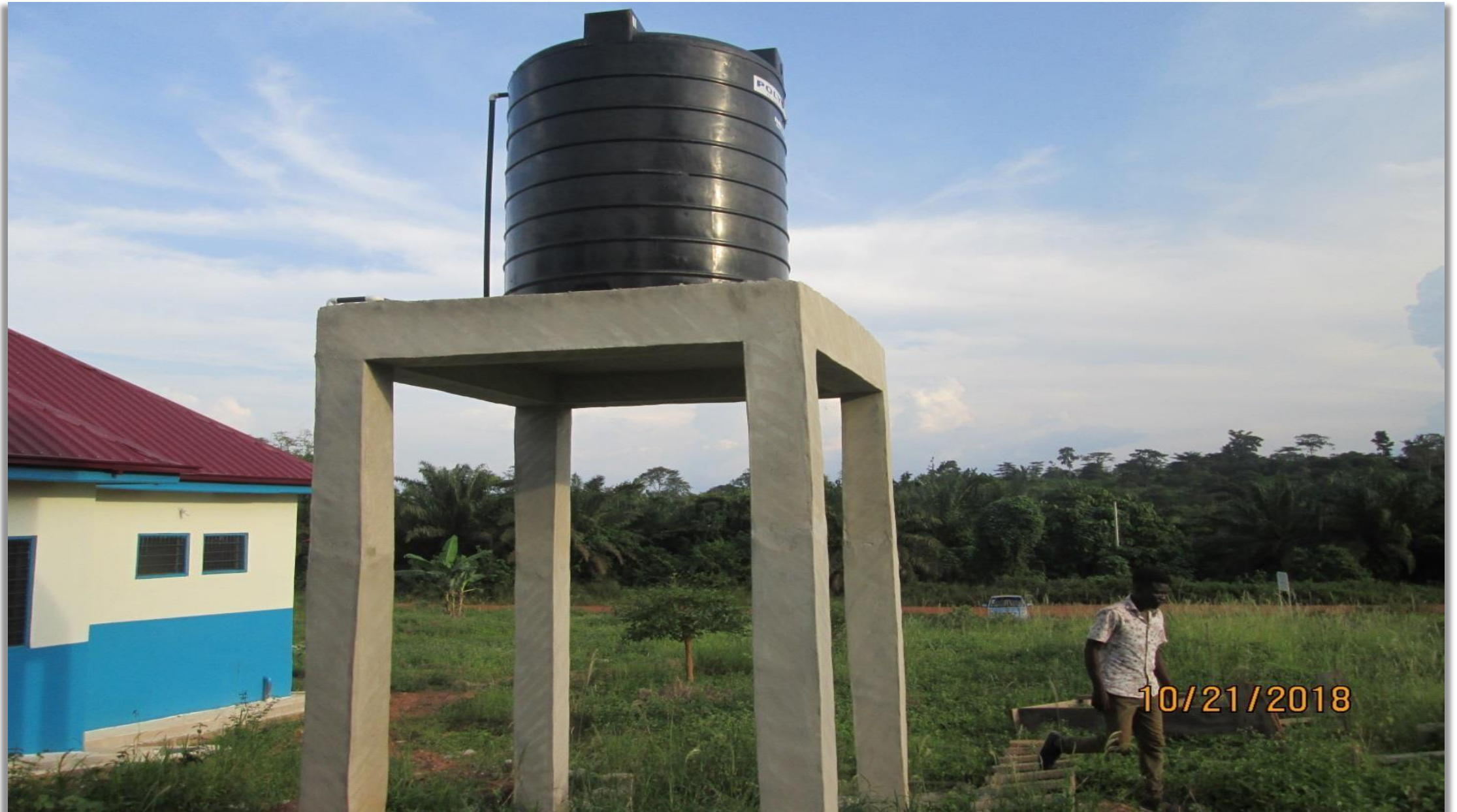
MECHANIZED BOREHOLE ATTACHED TO THE RURAL CLINIC AT WUROMSO, AHAFO ANO SOUTH DISTRICT