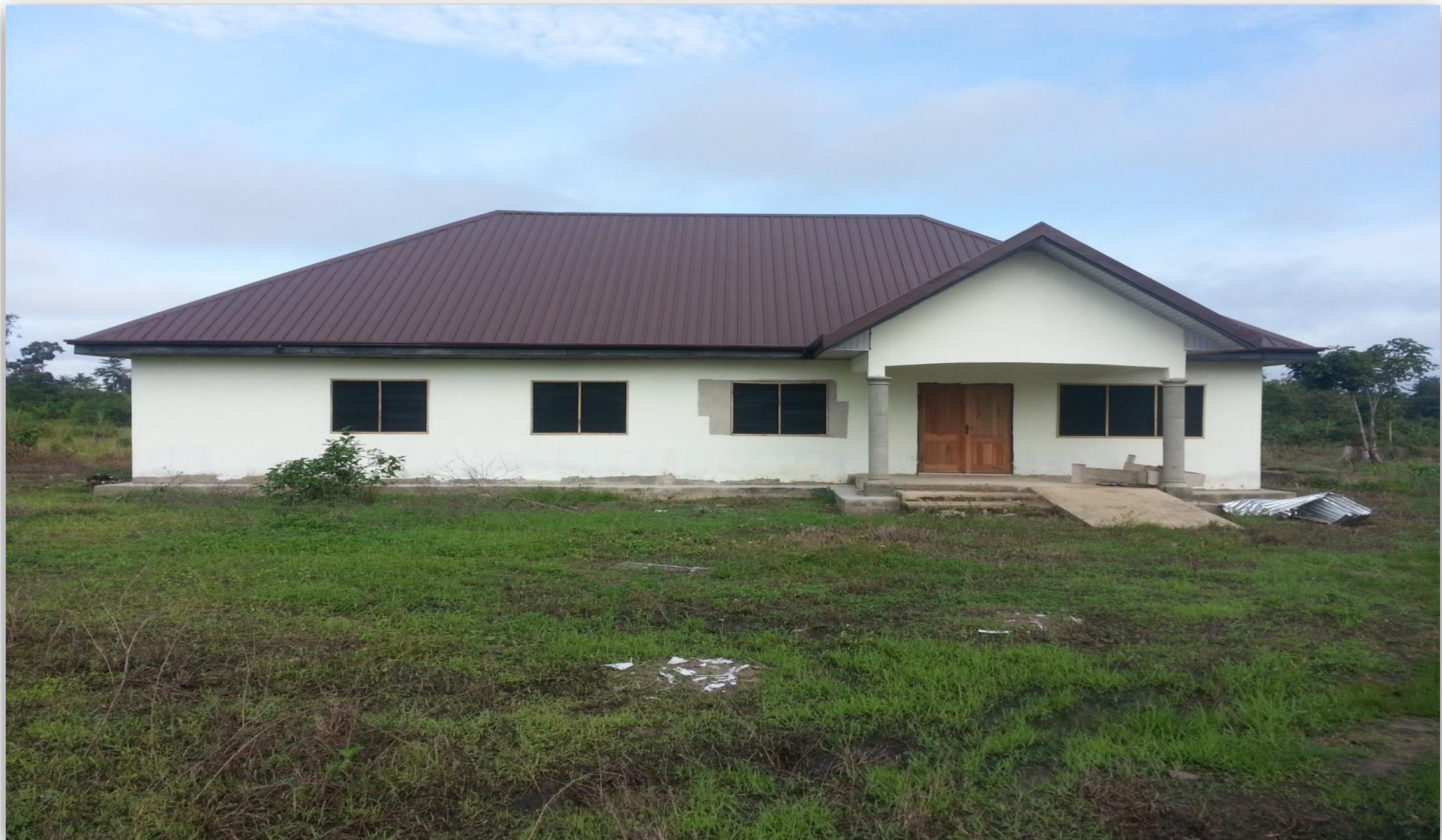
MATERNITY CENTER WITH MECHANIZED BOREHOLE AT MEHAME, AHAFO ANO SOUTH DISTRICT