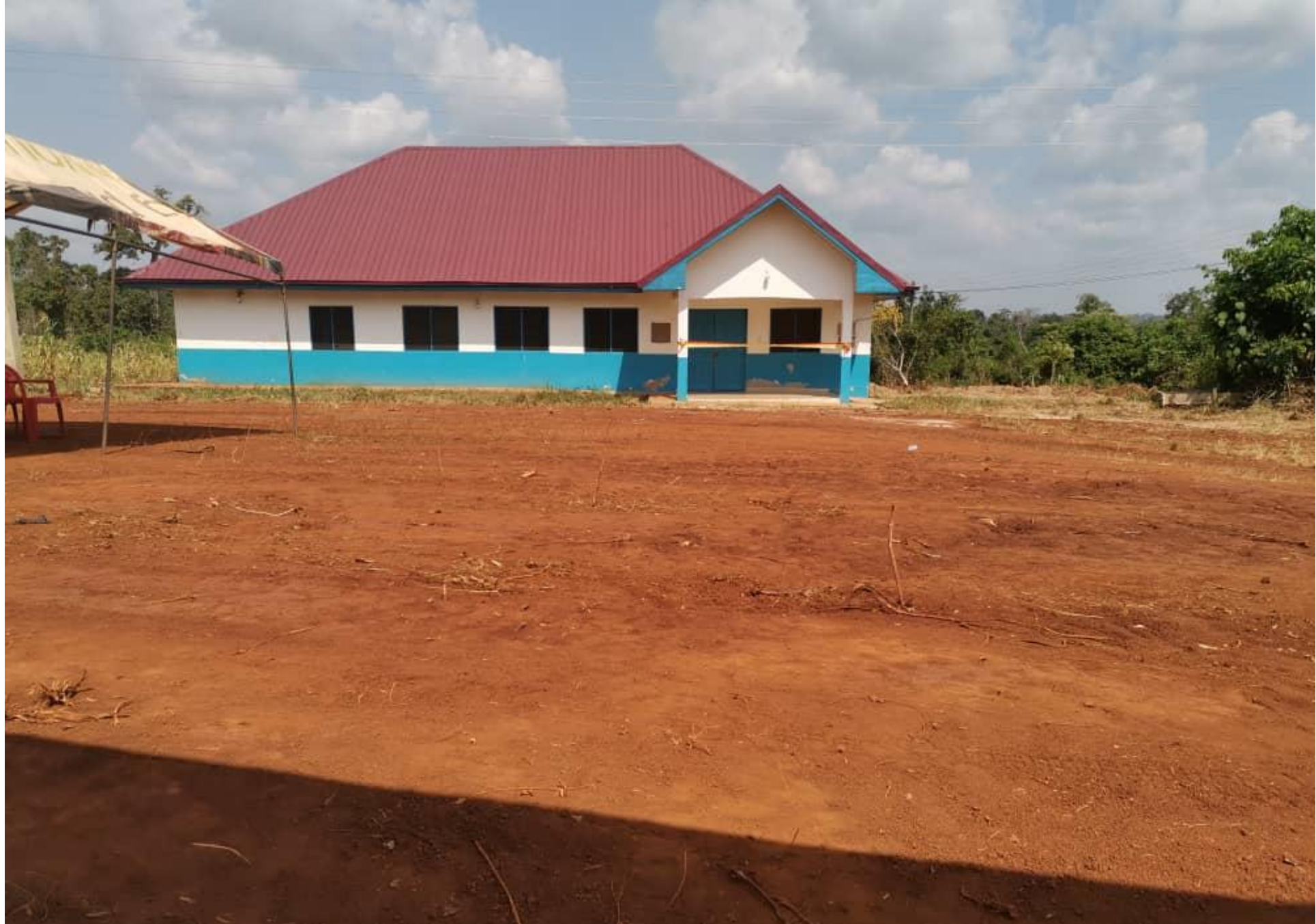
SIF PROJECT AT WUROMSO IN THE ASUTIFI SOUTH