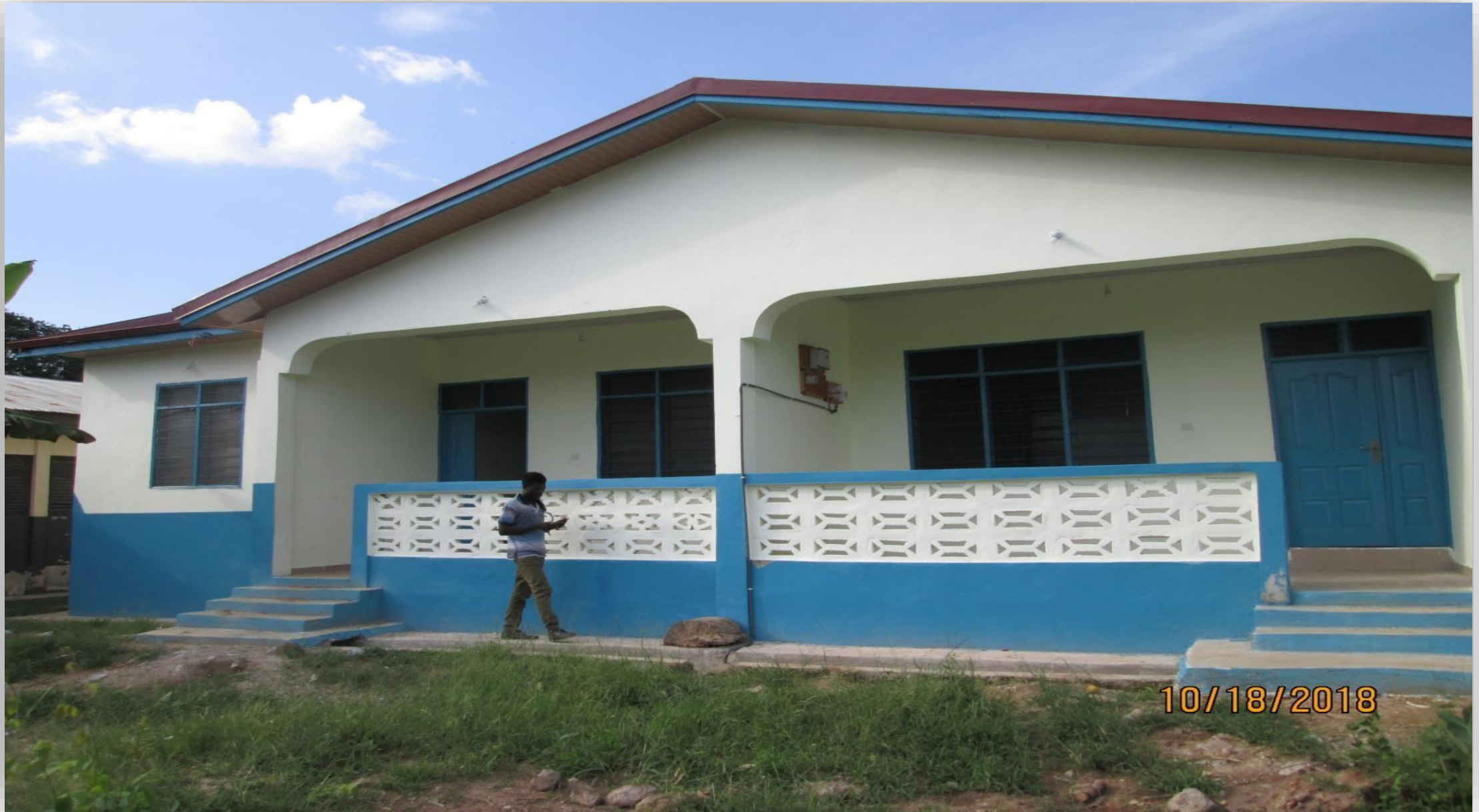
TEACHERS' QUARTERS WITH MECHANIZED BOREHOLE AT ABIDJAN, AFIGYA KWABRE DISTRICT