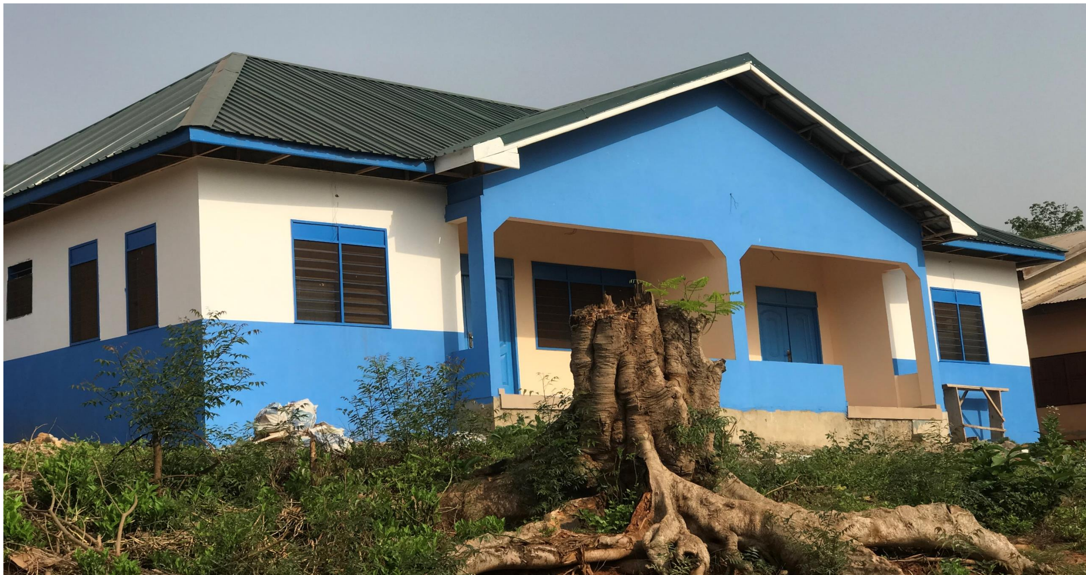
TEACHERS' QUARTERS WITH POTABLE WATER AT MEYIWA BUSANKOR, FANTEAKWA DISTRICT