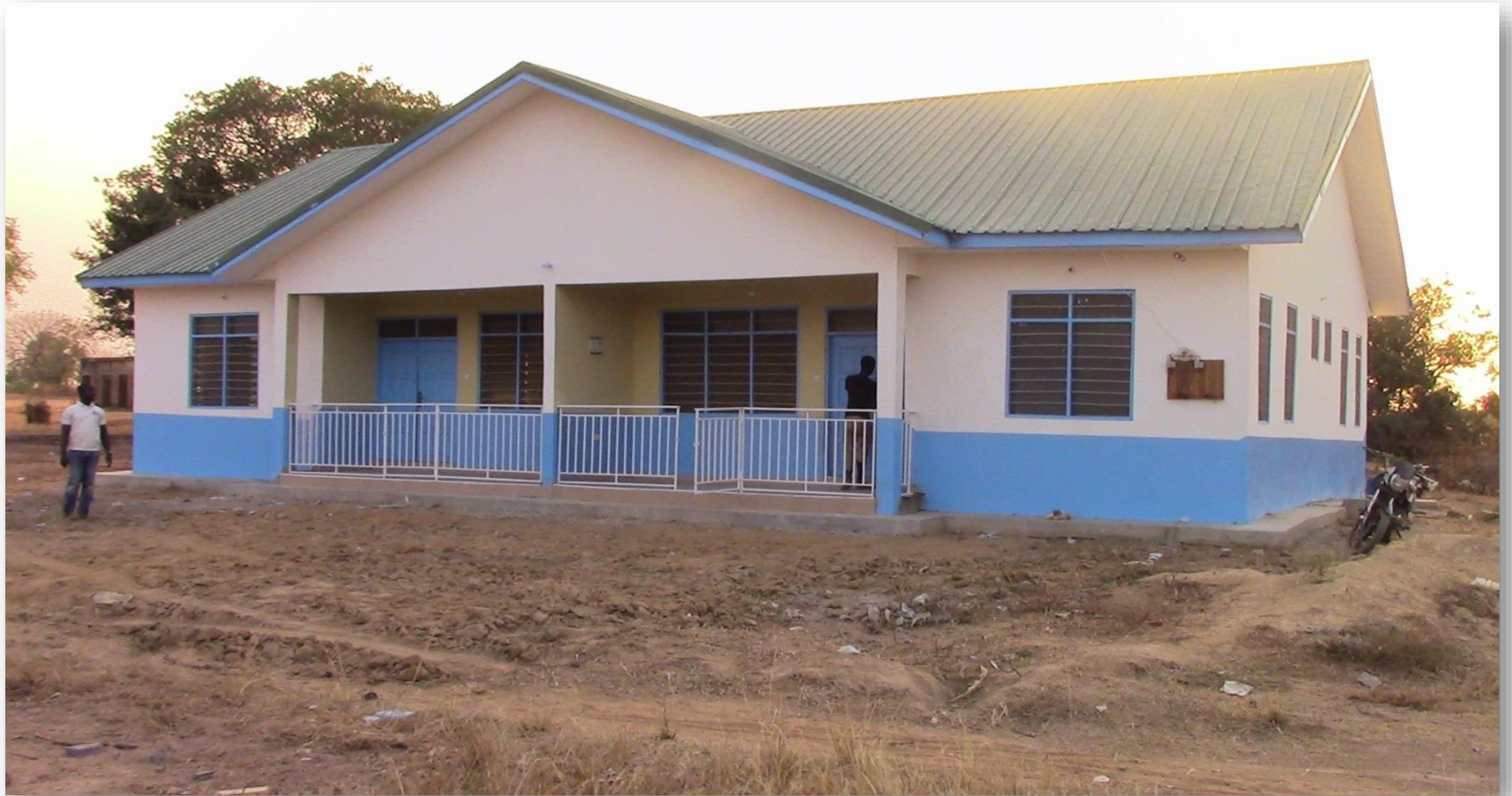
TEACHERS' QUARTERS WITH MECHANIZED BOREHOLE AT BANDEI, SISSALA EAST DISTRICT