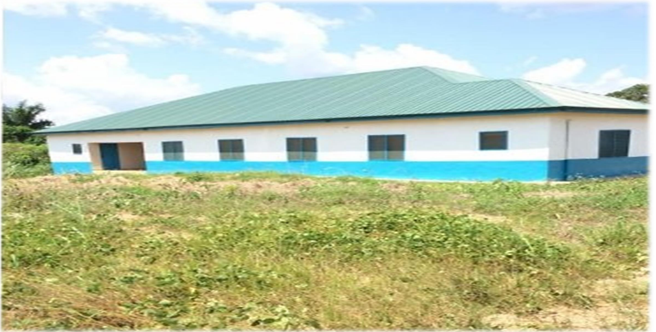
RURAL CLINIC WITH MECHANIZED BOREHOLE AT AKWABOSO, UPPER DENKYIRA WEST DISTRICT