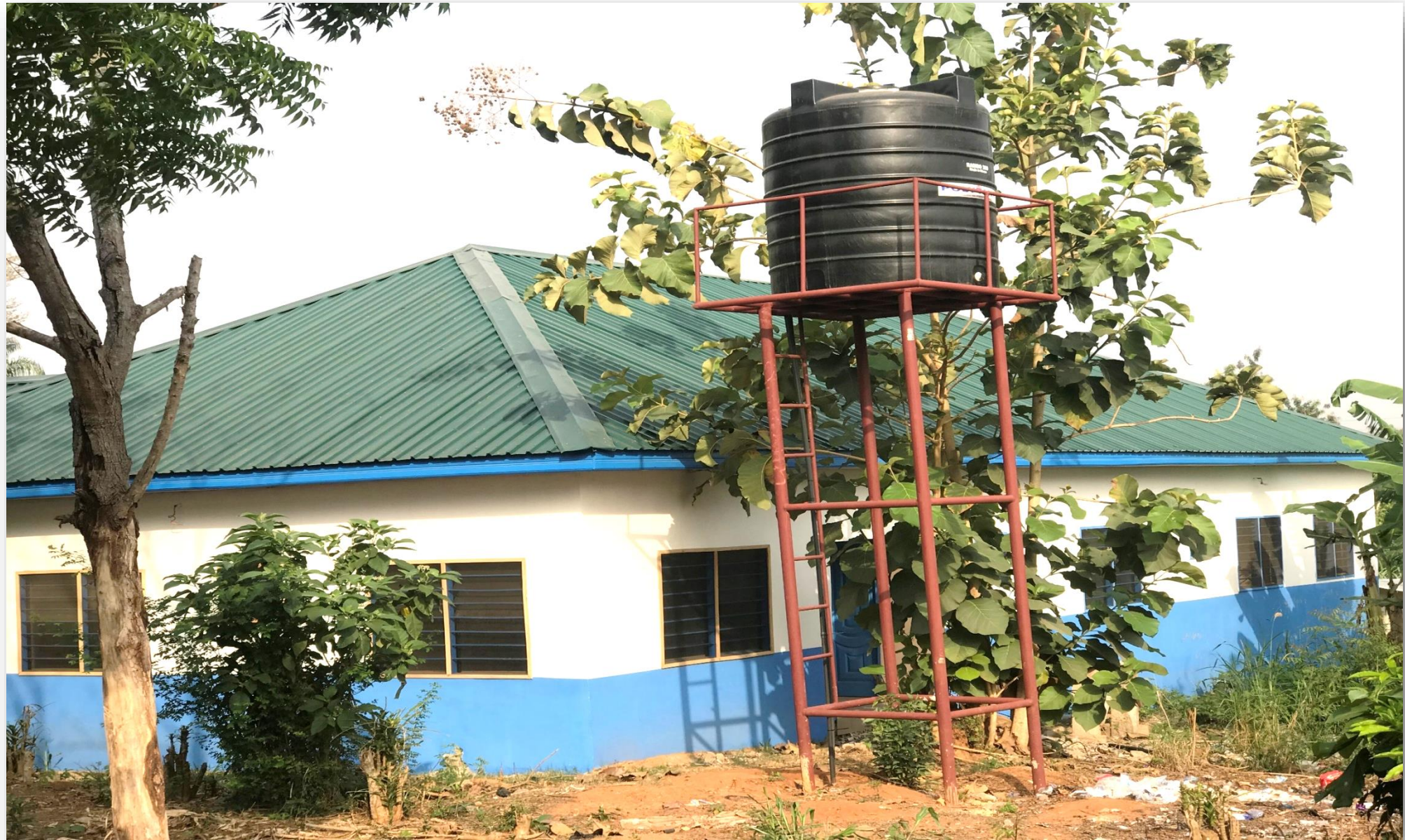
MATERNITY CENTRE WITH MECHANIZED BOREHOLE AT AHOMAHUMASO, FANTEAKWA DISTRICT