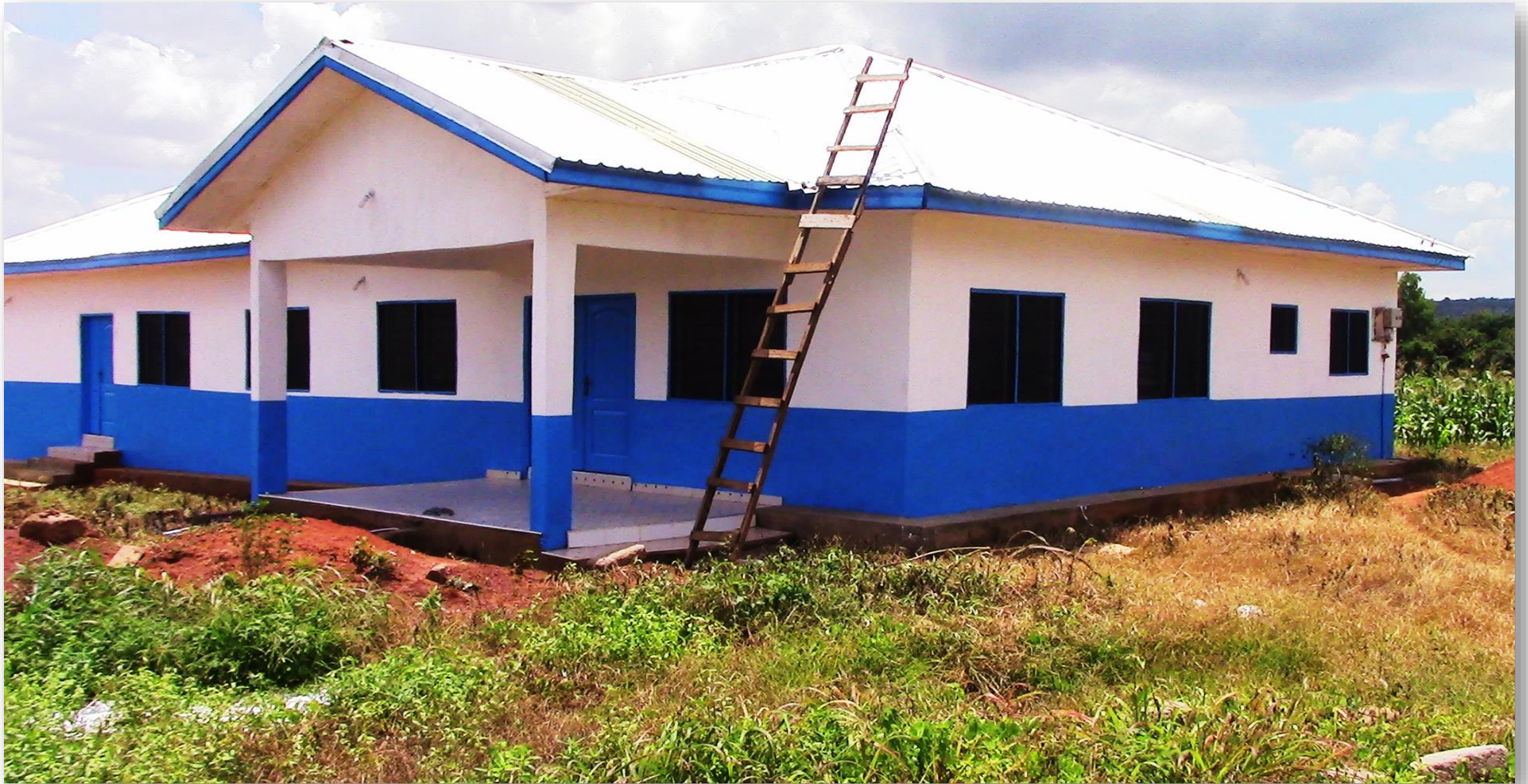
MATERNITY CENTER WITH MECHANIZED BOREHOLE AT NASUAN, BUNKPURUGU-YUNYOO DISTRICT