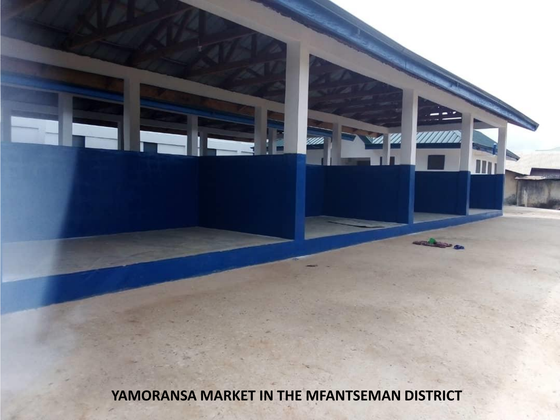
YAMORANSA MARKET IN THE MFANTSEMAN DISTRICT