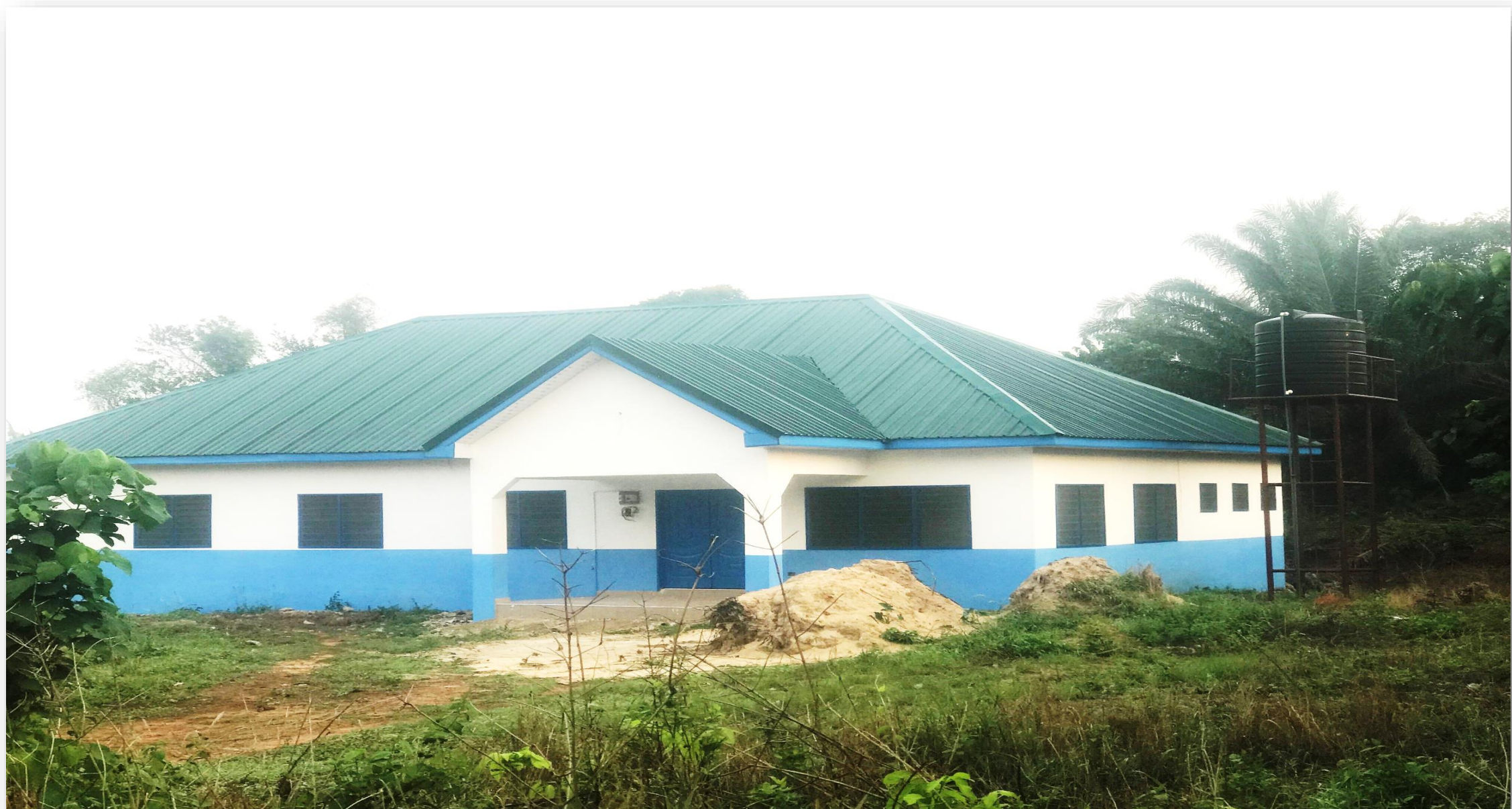
RURAL CLINIC WITH MECHANIZED BORHOLE AT AKORWU BANA, UPPER MANYA KROBO DISTRICT