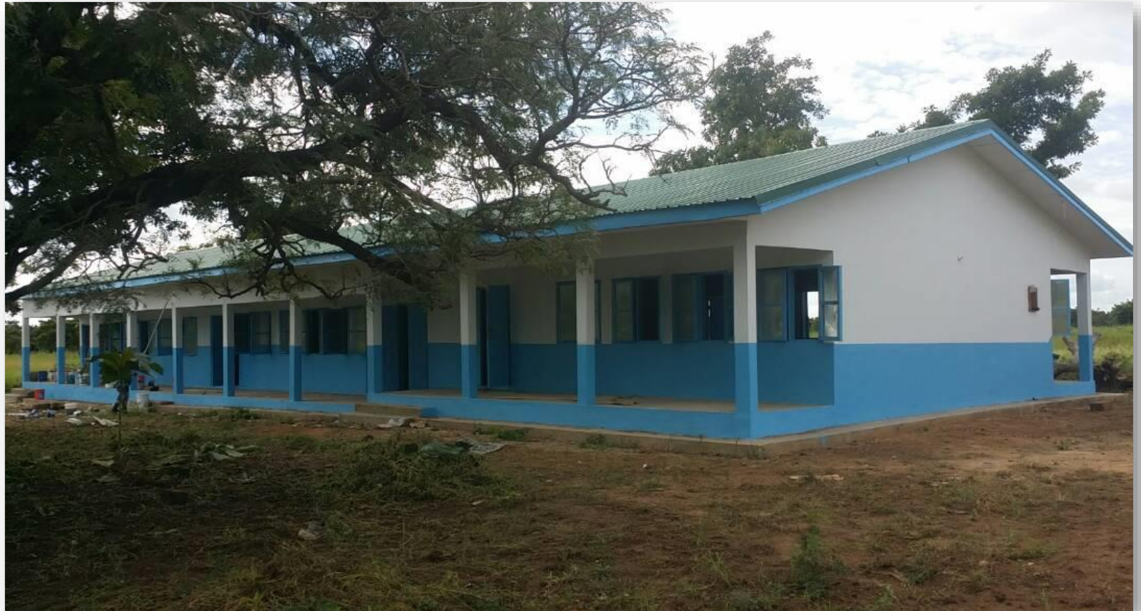
3-UNIT CLASSROOM BLOCK WITH URINAL AND 4-SEATER LATRINE AT TARSAW /KULFUO, SISSALA EAST DISTRICT