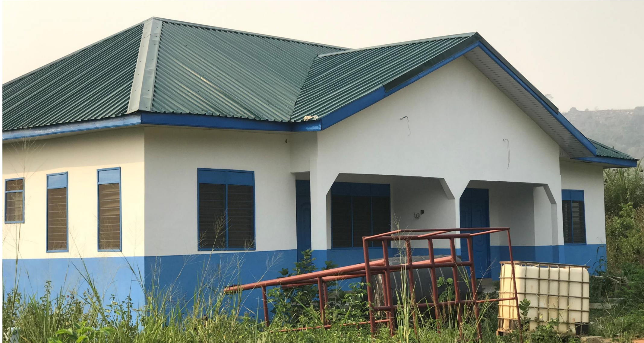
NURSES' QUARTERS WITH POTABLE WATER AT AKATENG, UPPER MANYA KROBO DISTRICT