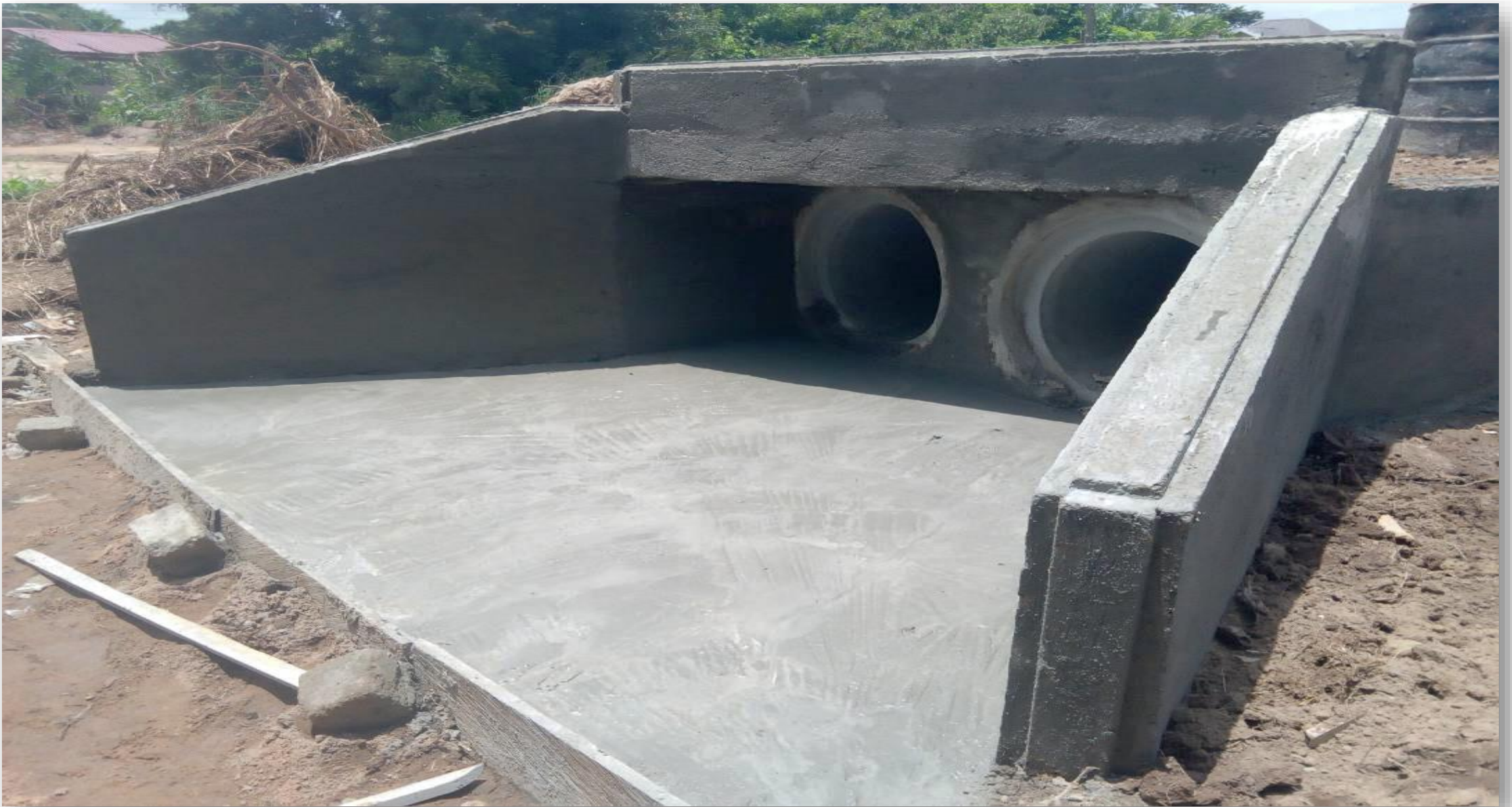
DOUBLE CULVERT AT PANTANG EAST, GA EAST MUNICIPALITY