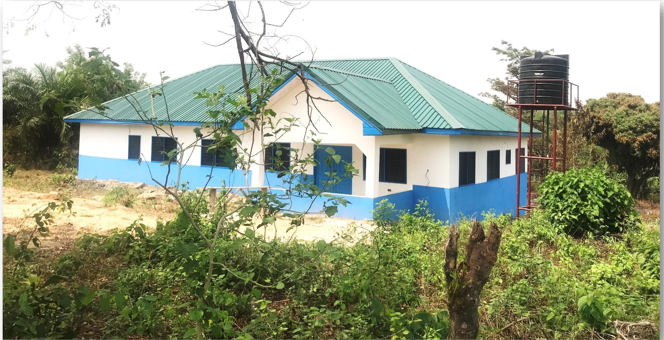
RURAL CLINIC WITH MECHANIZED BOREHOLE AT ESUOMANYA, UPPER MANYA KROBO DISTRICT