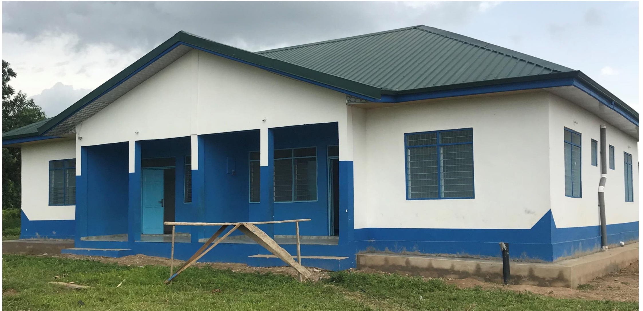
TEACHERS' QUARTERS WITH POTABLE WATER AT NABU, NKWANTA NORTH DISTRICT