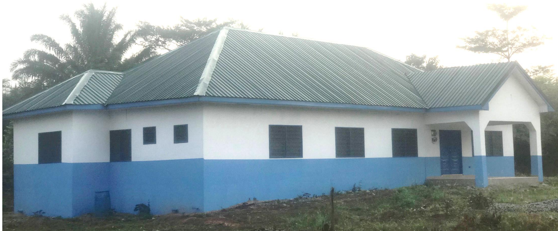
Community Clinic with potable water at Akorwu Bana In the Upper Manya Krobo District