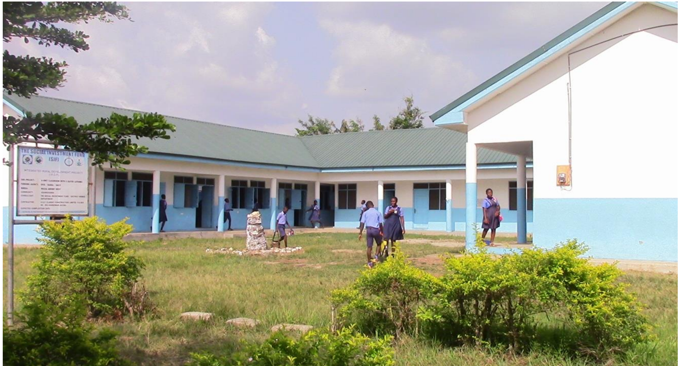
6-UNIT CLASSROOM BLOCK WITH 8-SEATER LATERINE AT ASANKRAGUA, WASSA AMENFI WEST MUNICIPALITY