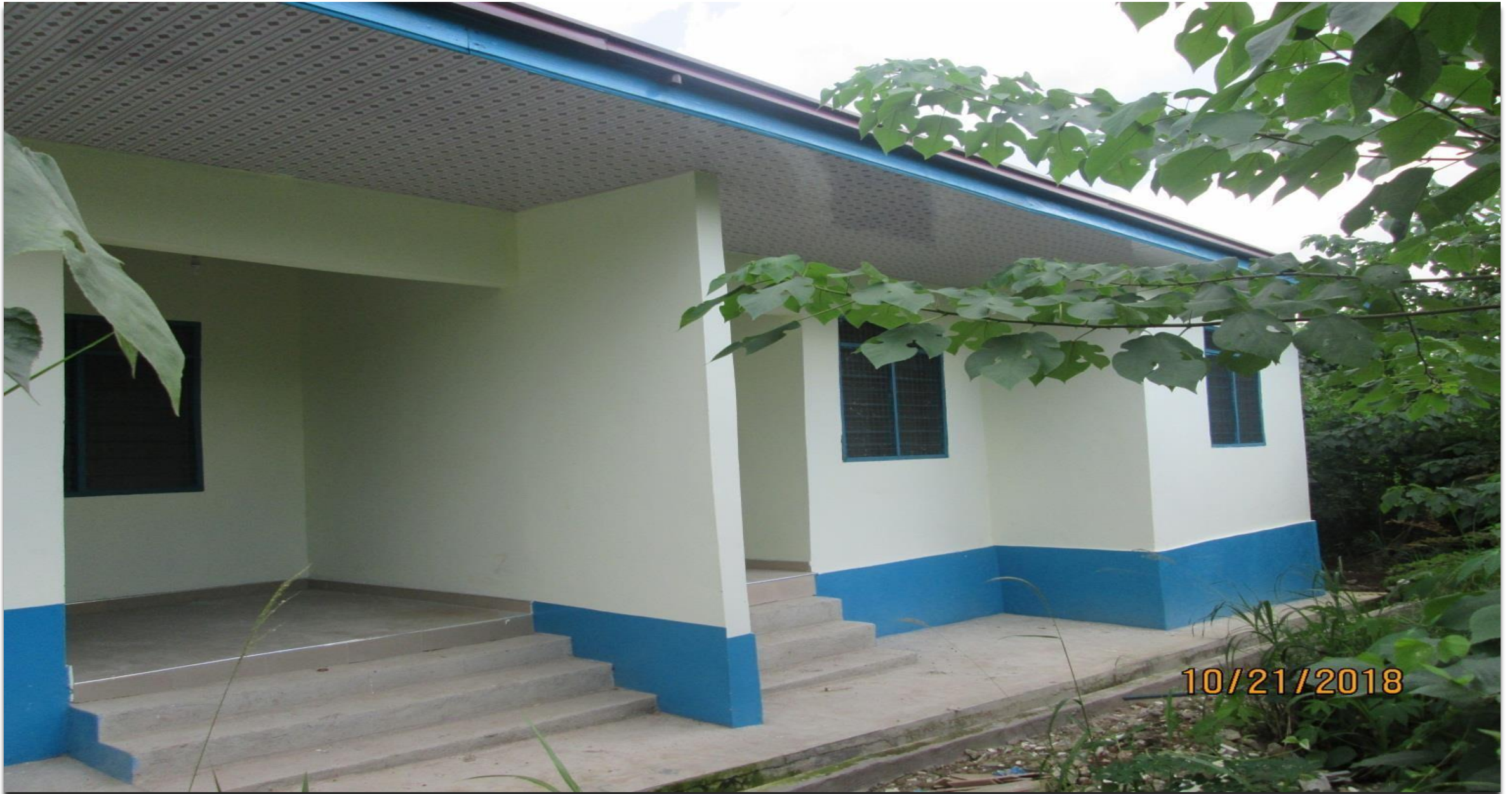
NURSES' QUARTERS WITH MECHANIZED BOREHOLE AT SABRONUM, AHAFO ANO SOUTH DISTRICT