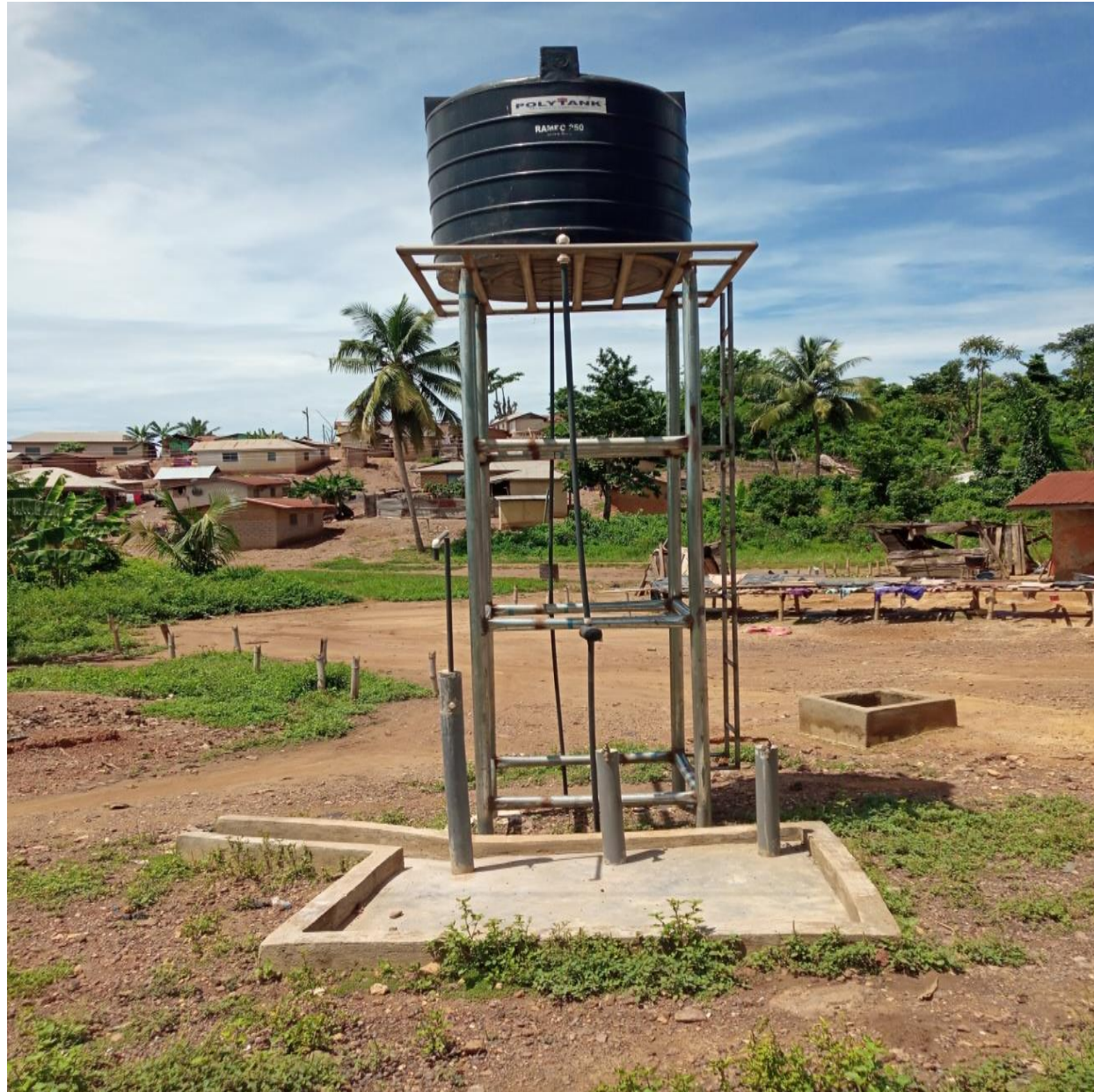
COMMUNITY MECHANISED BOREHOLE AT AMOAMAN, UPPER DENKYIRA WEST DISTRICT