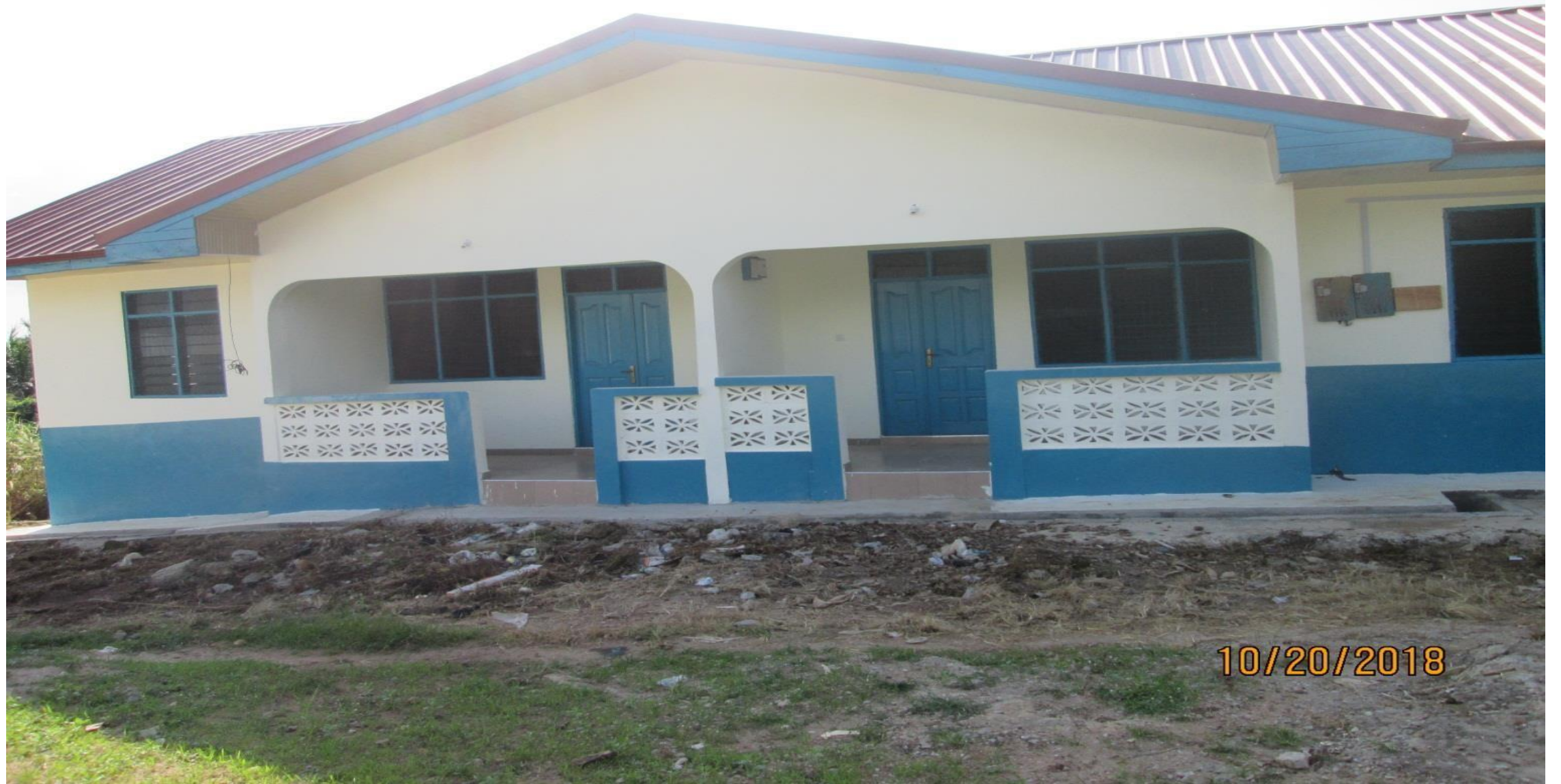
NURSES' QUARTERS WITH MECHANIZED BOREHOLE AT ADWUMAKAASEKESE, AFIGYA KWABRE DISTRICT