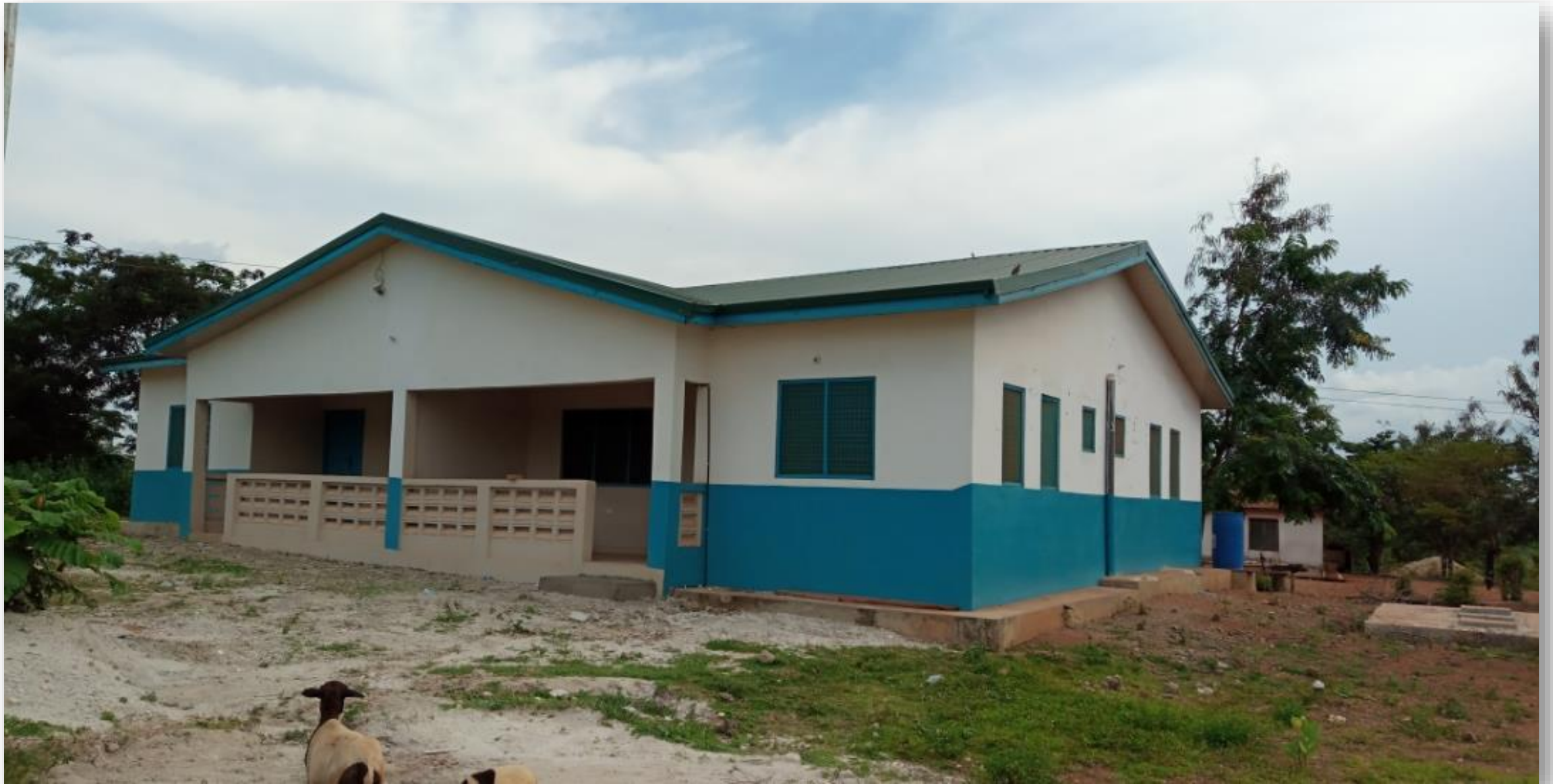
NURSES' QUARTERS WITH MECHANIZED BOREHOLE AT ASUADEI, UPPER DENKYIRA WEST DISTRICT