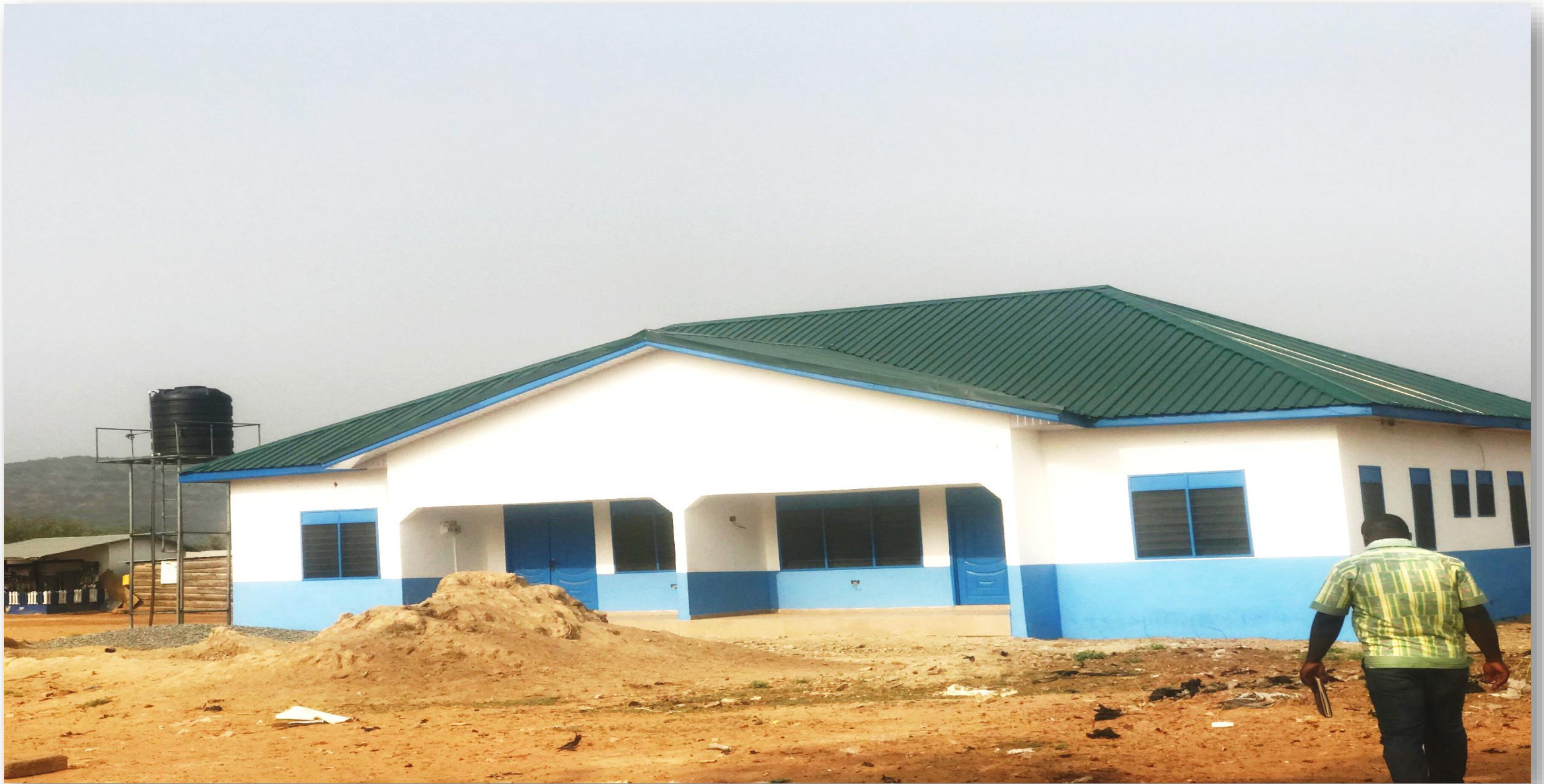
NURSES' QUARTERS WITH MECHANIZED BOREHOLE AT AKATENG, UPPER MANYA KROBO DISTRICT