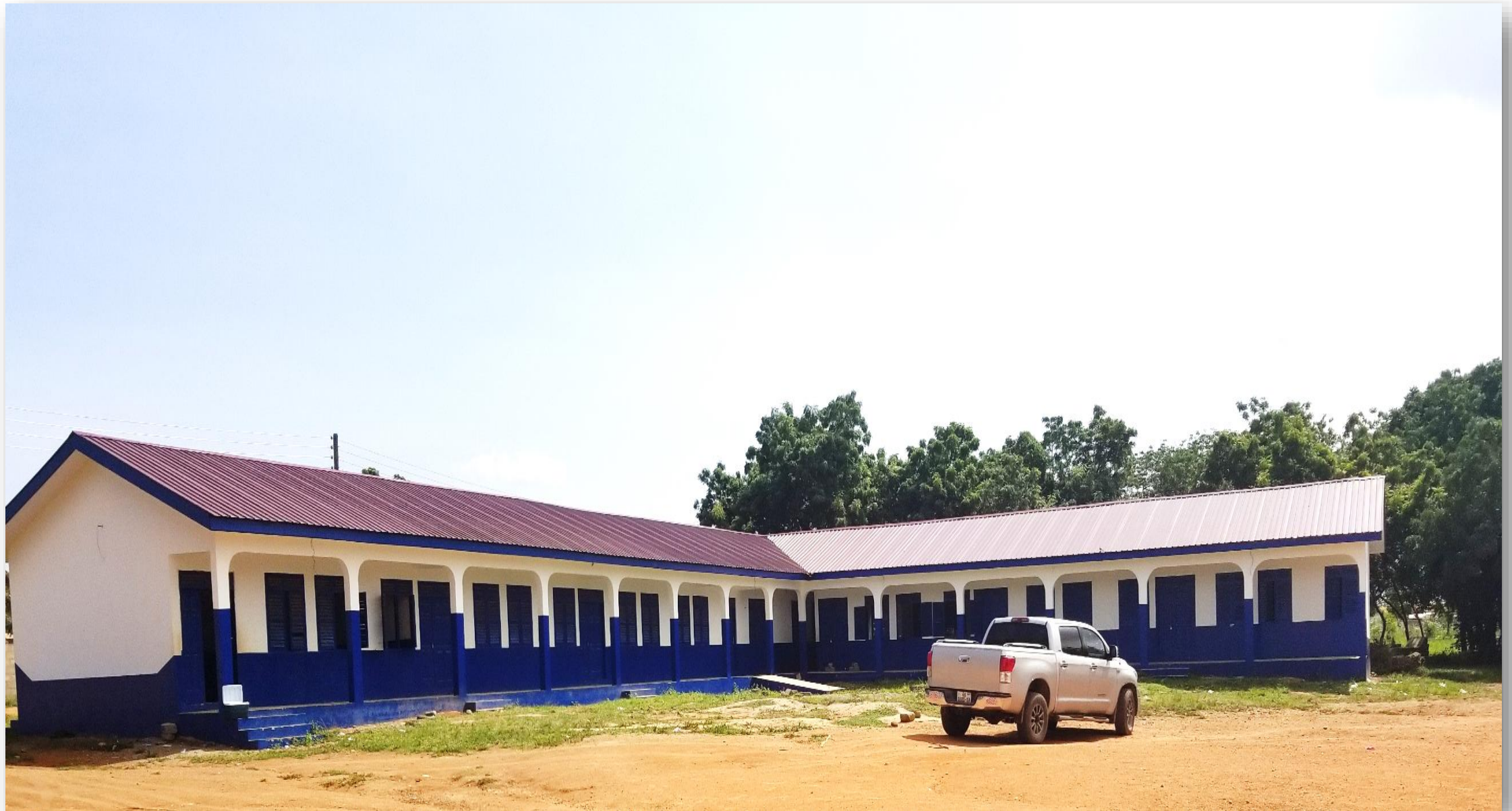
6-UNIT CLASSROOM BLOCK WITH 8-SEATER LATERINE AT HAATSO PAPA0, GA EAST MUNICIPALITY