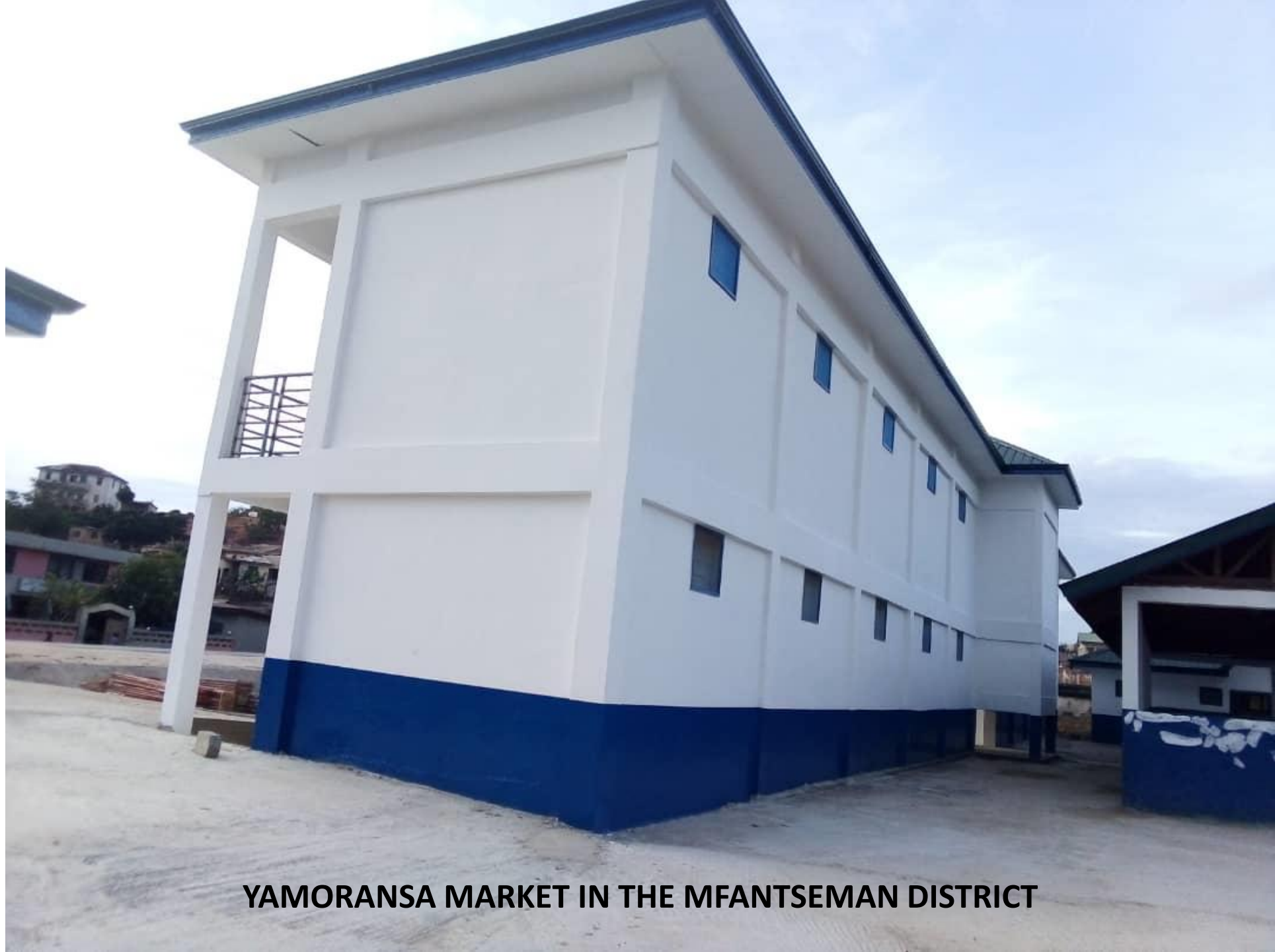
YAMORANSA MARKET IN THE MFANTSEMAN DISTRICT