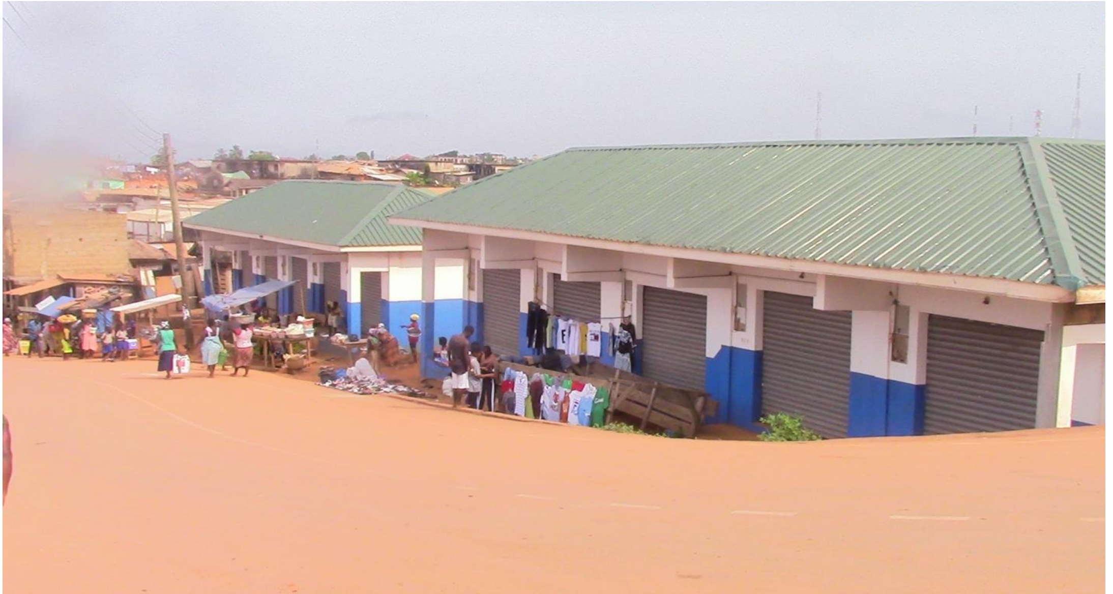
LOCKABLE MARKET SHOPS AT AXIM, NZEMA EAST MUNICIPALITY