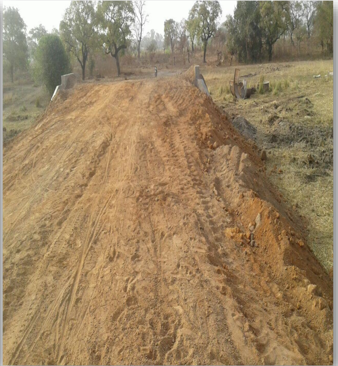
SIMPLE CULVERT AT METTEW, WA WEST DISTRICT