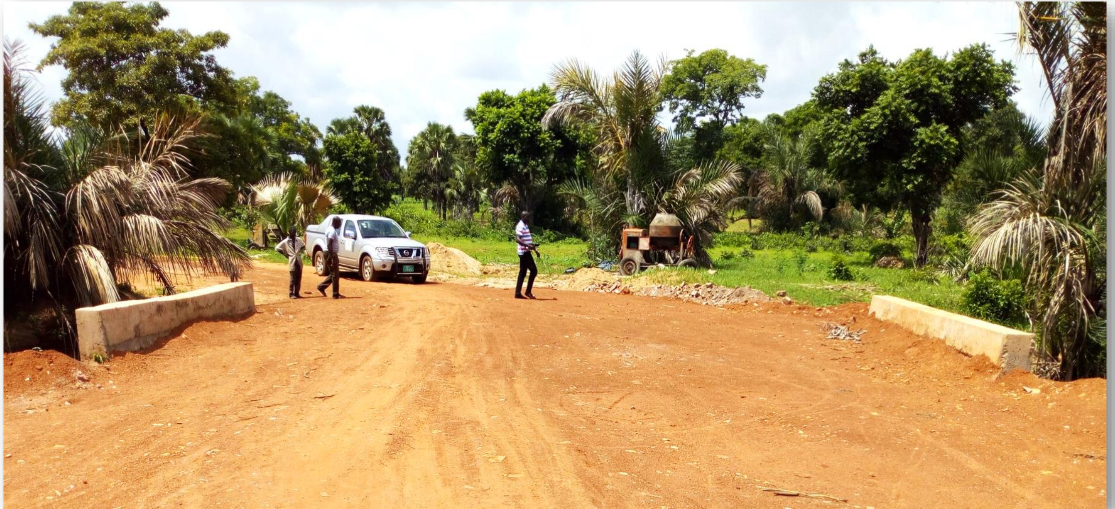
A CULVERT AT KPENTAUNG, BUNKPURUGU-YUNYOO DISTRICT