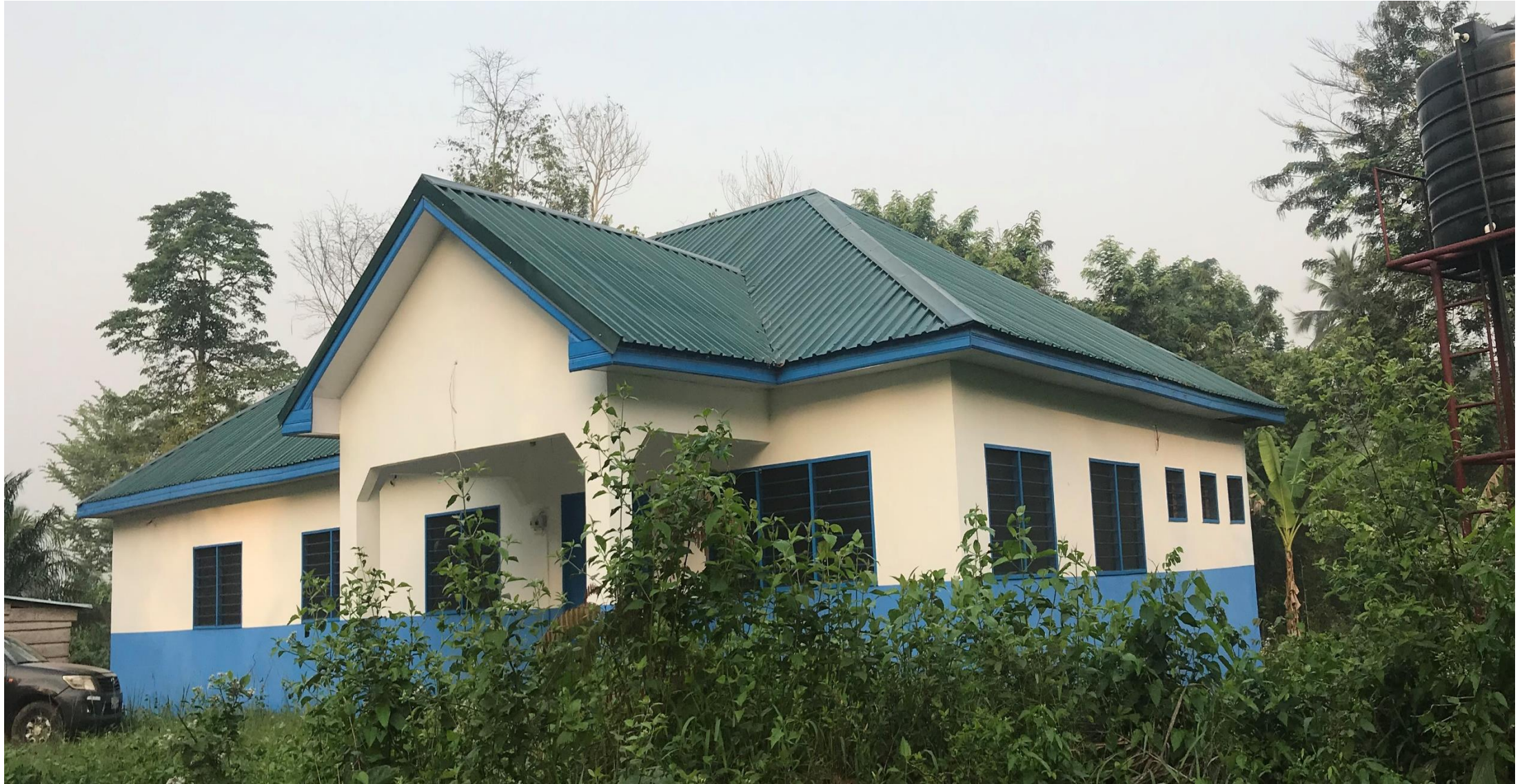
COMMUNITY CLINIC WITH POTABLE WATER AT KPLANDEY, FANTEAKWA DISTRICT