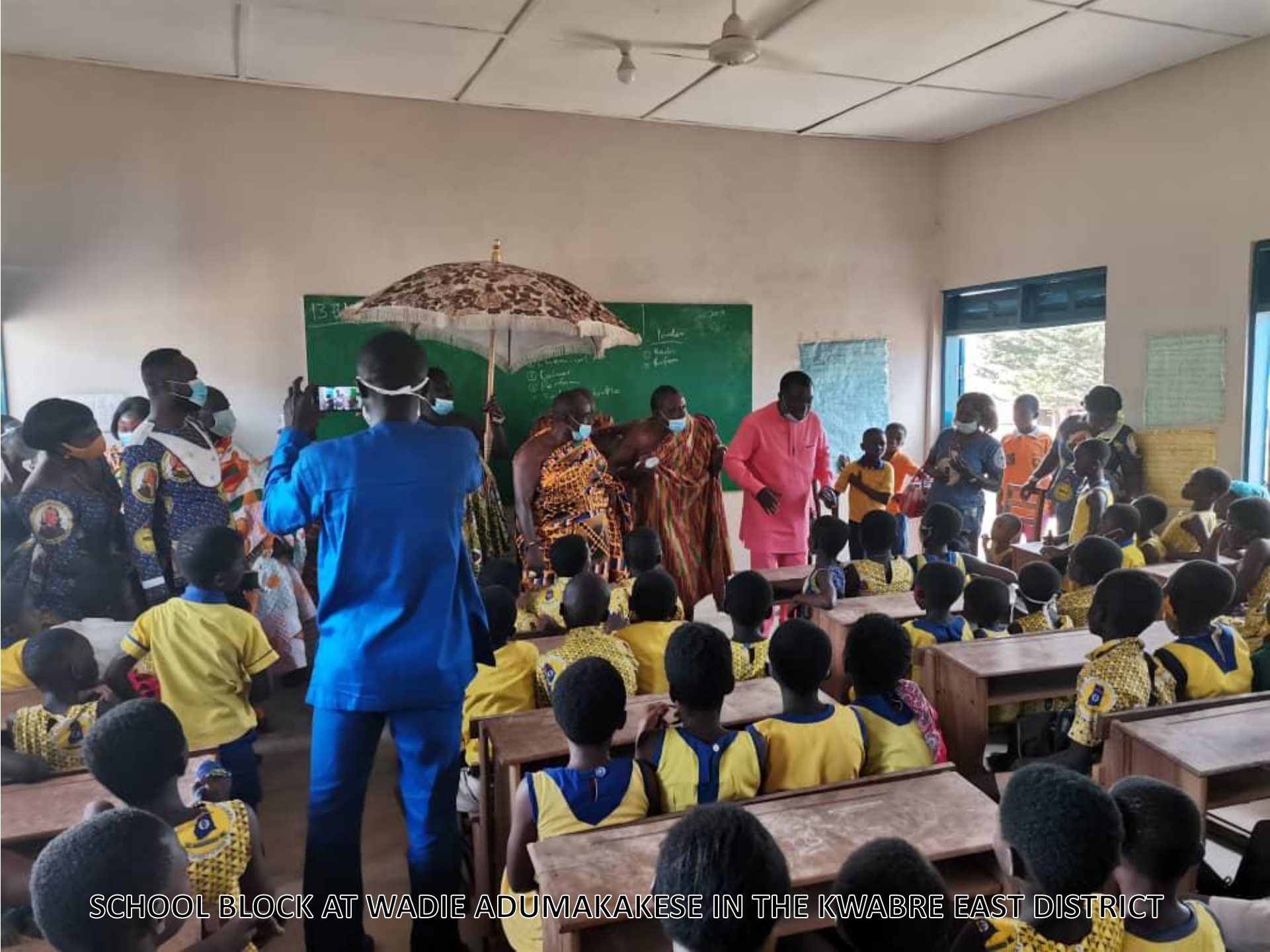
SCHOOL BLOCK AT WADIE ADUMAKAKESE IN THE KWABRE EAST DISTRICT