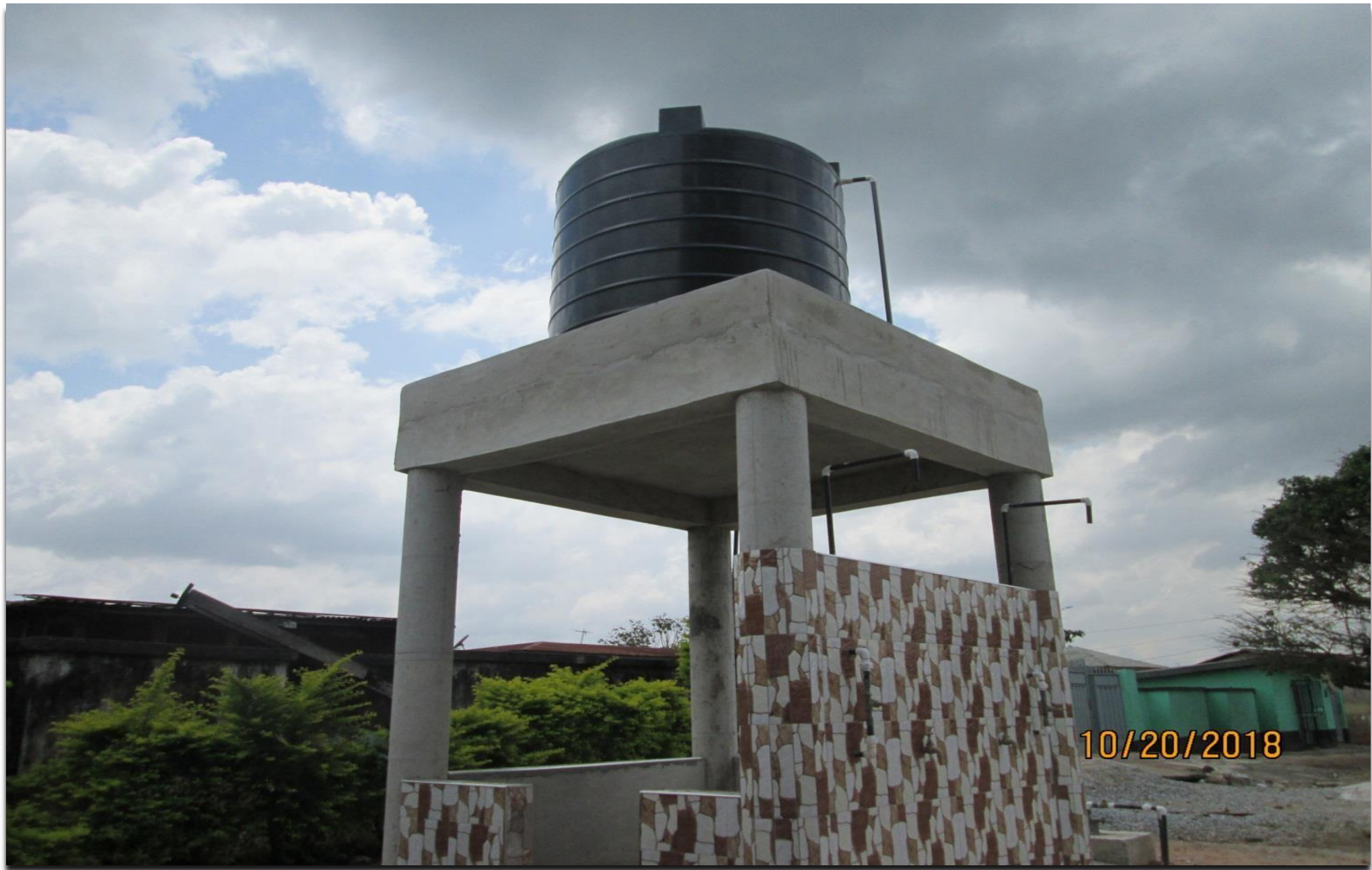
COMMUNITY MECHANIZED BOREHOLE AT BIEMSO NO.1, AHAFO-ANO SOUTH DISTRICT