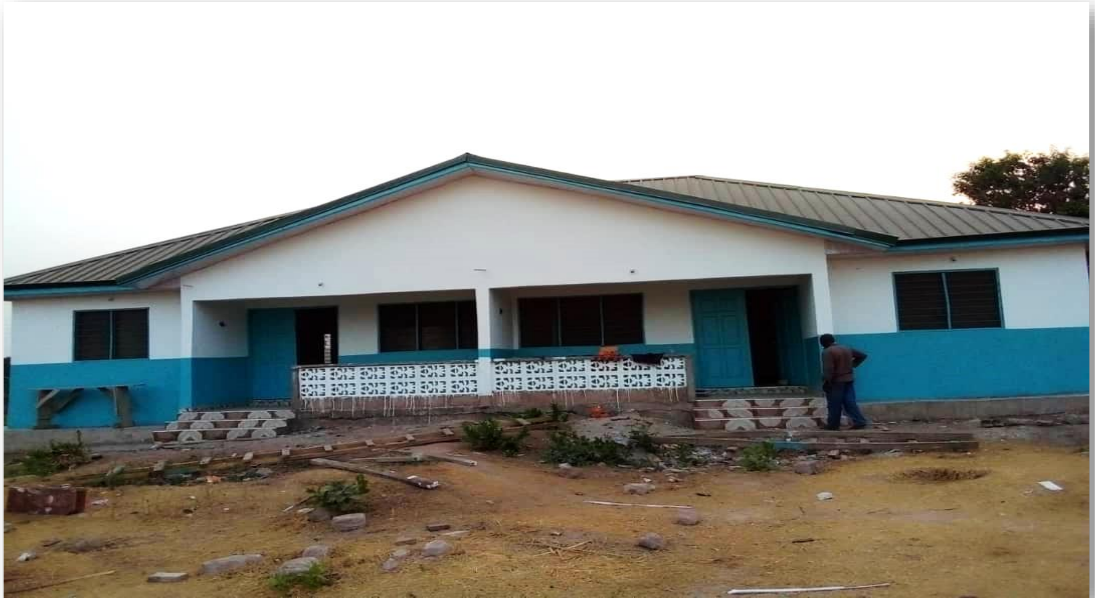
TEACHERS' QUARTERS WITH MECHANIZED BOREHOLE AT TATO BATTOR, SENE WEST DISTRICT