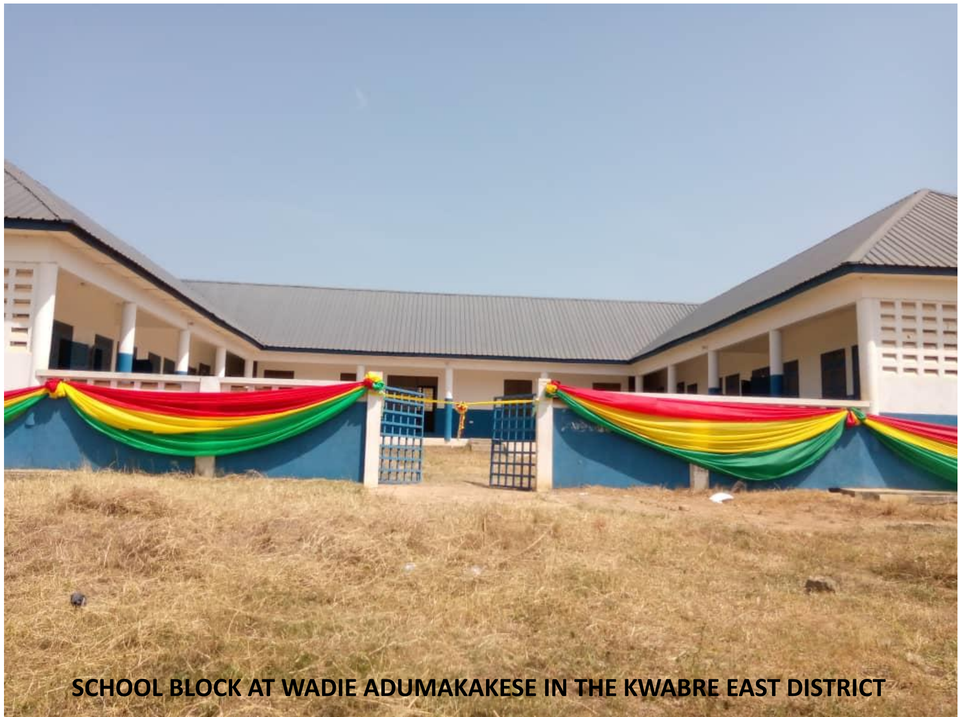
SCHOOL BLOCK AT WADIE ADUMAKAKESE IN THE KWABRE EAST DISTRICT