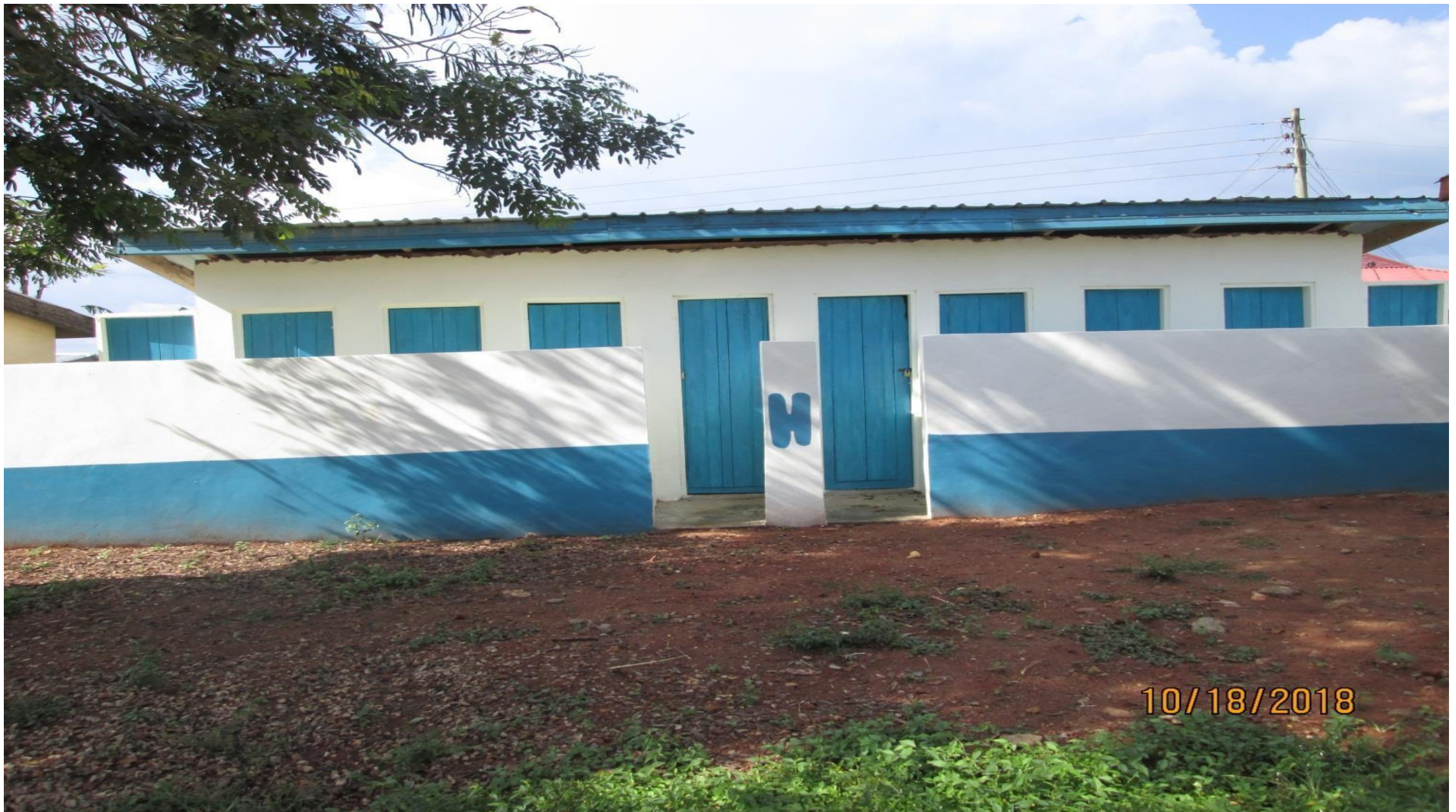
8-SEATER LATRINE ATTACHED TO THE 6-UNIT CLASSROOM BLOCK AT AHENKRO, AFIGYA KWABRE DISTRICT