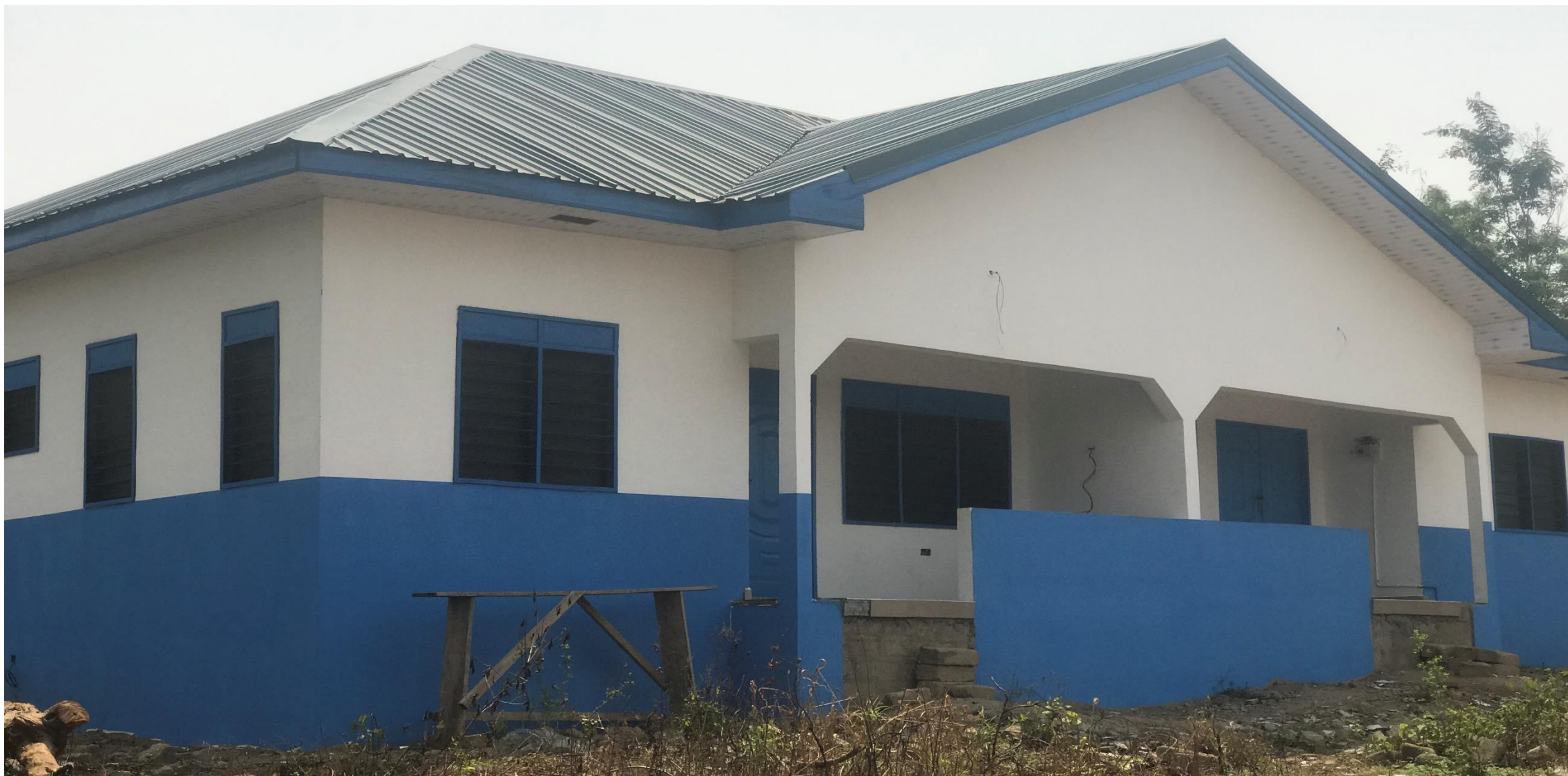
NURSES' QUARTERS WITH POTABLE WATER AT ESSUOMANYA, UPPER MANYA KROBO DISTRICT