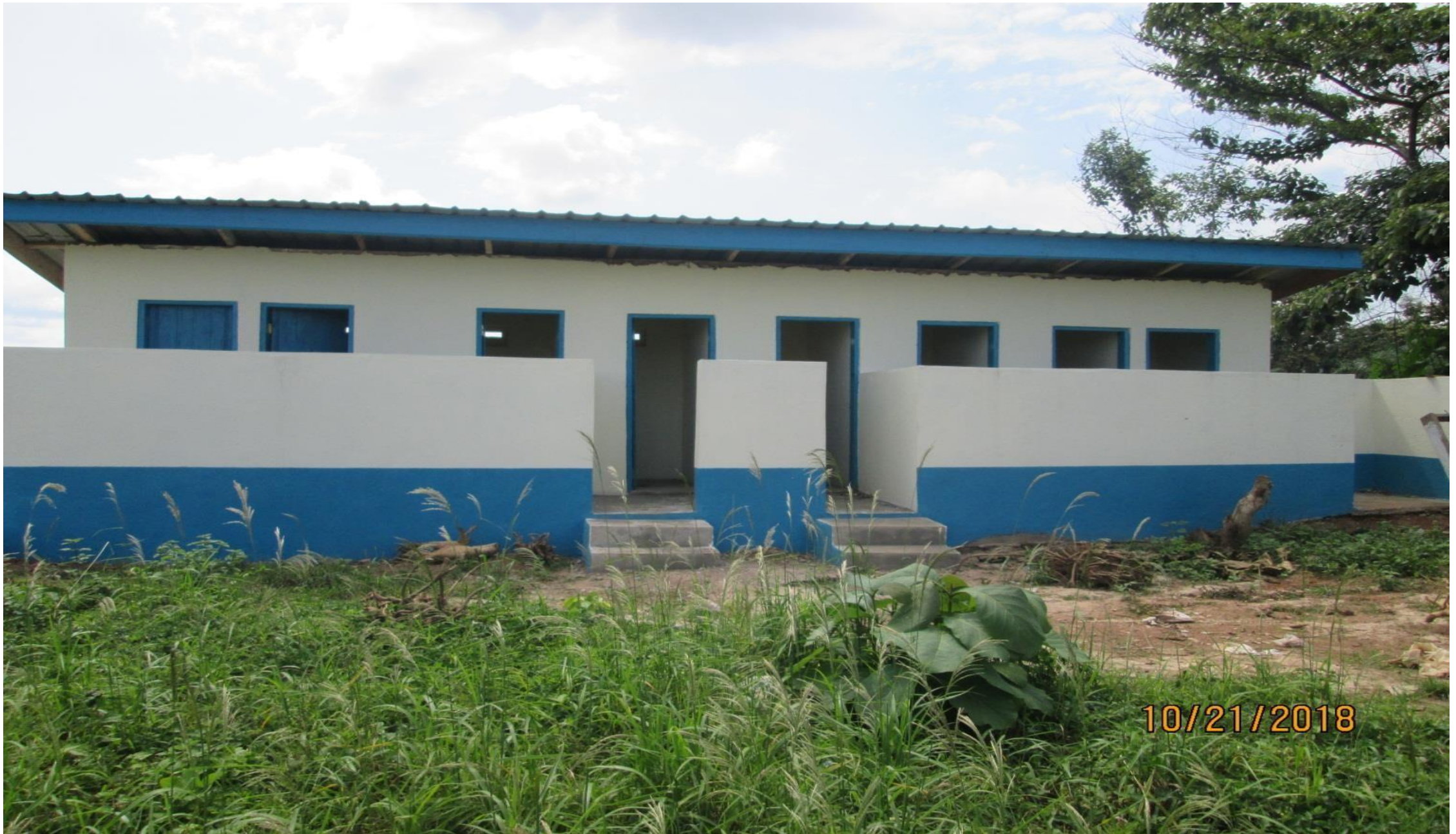
8-SEATER LATRINE ATTACHED TO THE 6-UNIT CLASSROOM BLOCK AT SABRONUM, AHAFO-ANO SOUTH DISTRICT