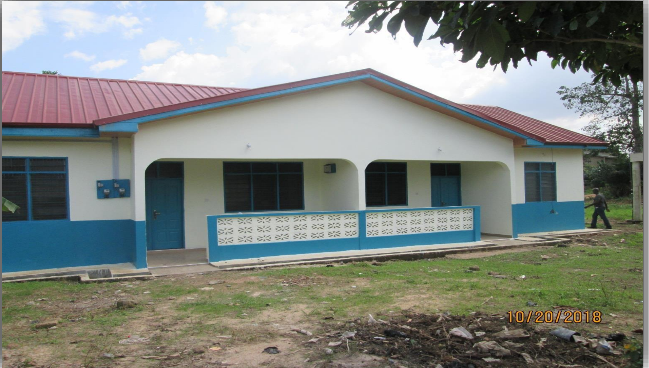
TEACHERS' QUARTERS WITH MECHANISED BOREHOLE AT HEMAN, AFIGYA KWABRE DISTRICT