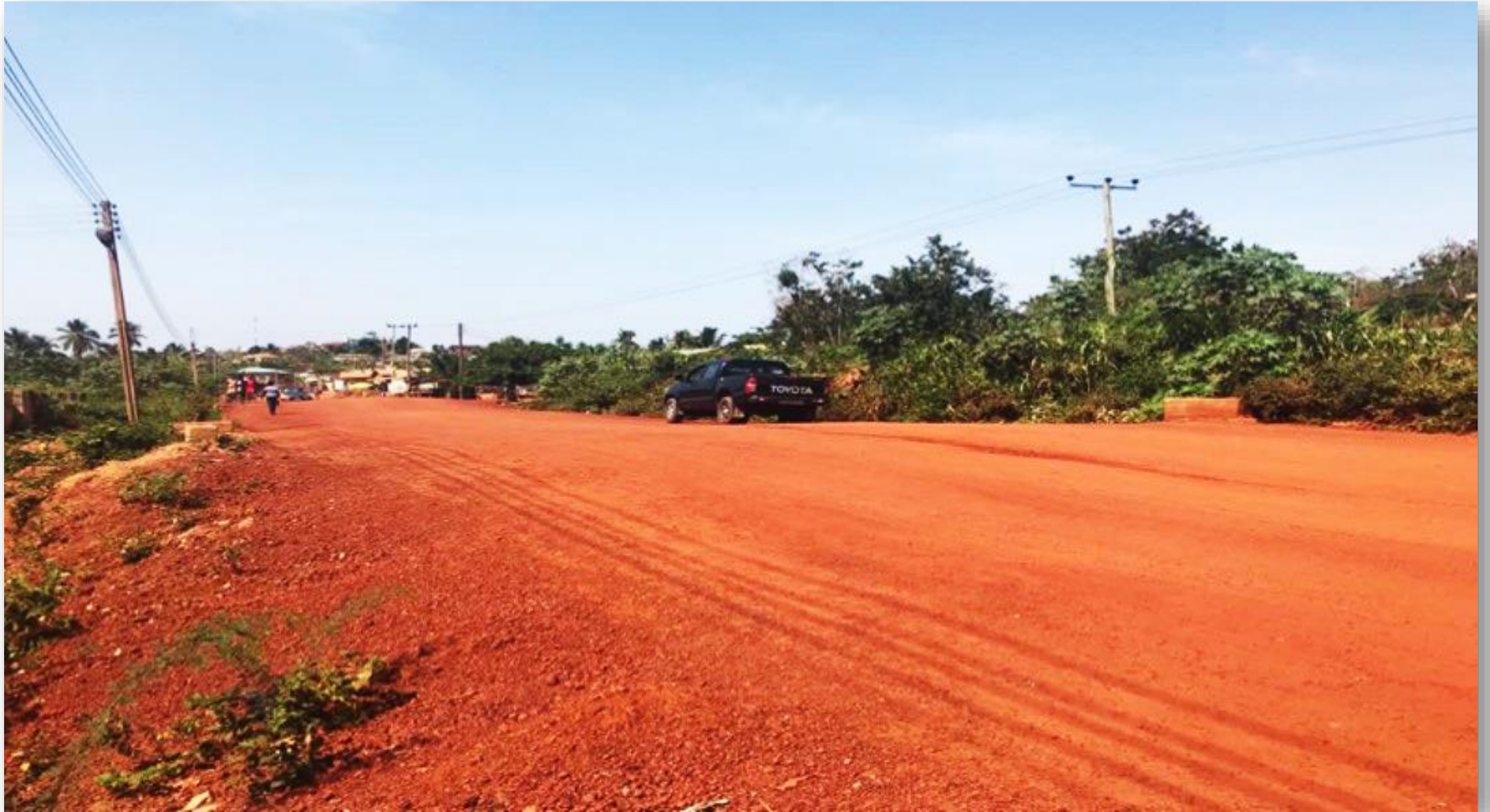
CULVERT AT BEGORO, FANTEAKWA DISTRICT