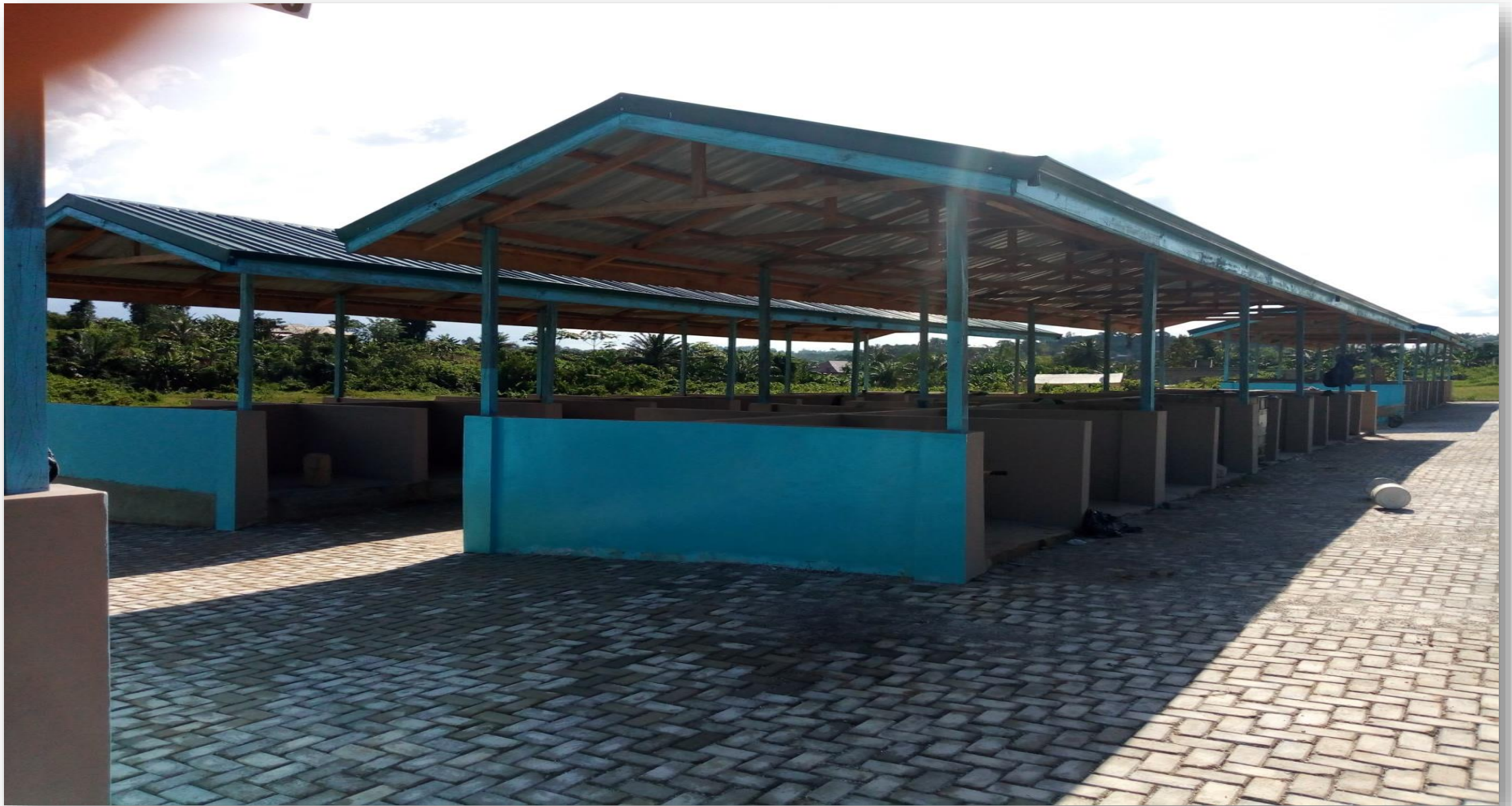
STALLS ATTACHED TO THE MARKET AT ASANKRAGUA, AMENFI WEST MUNICIPALITY