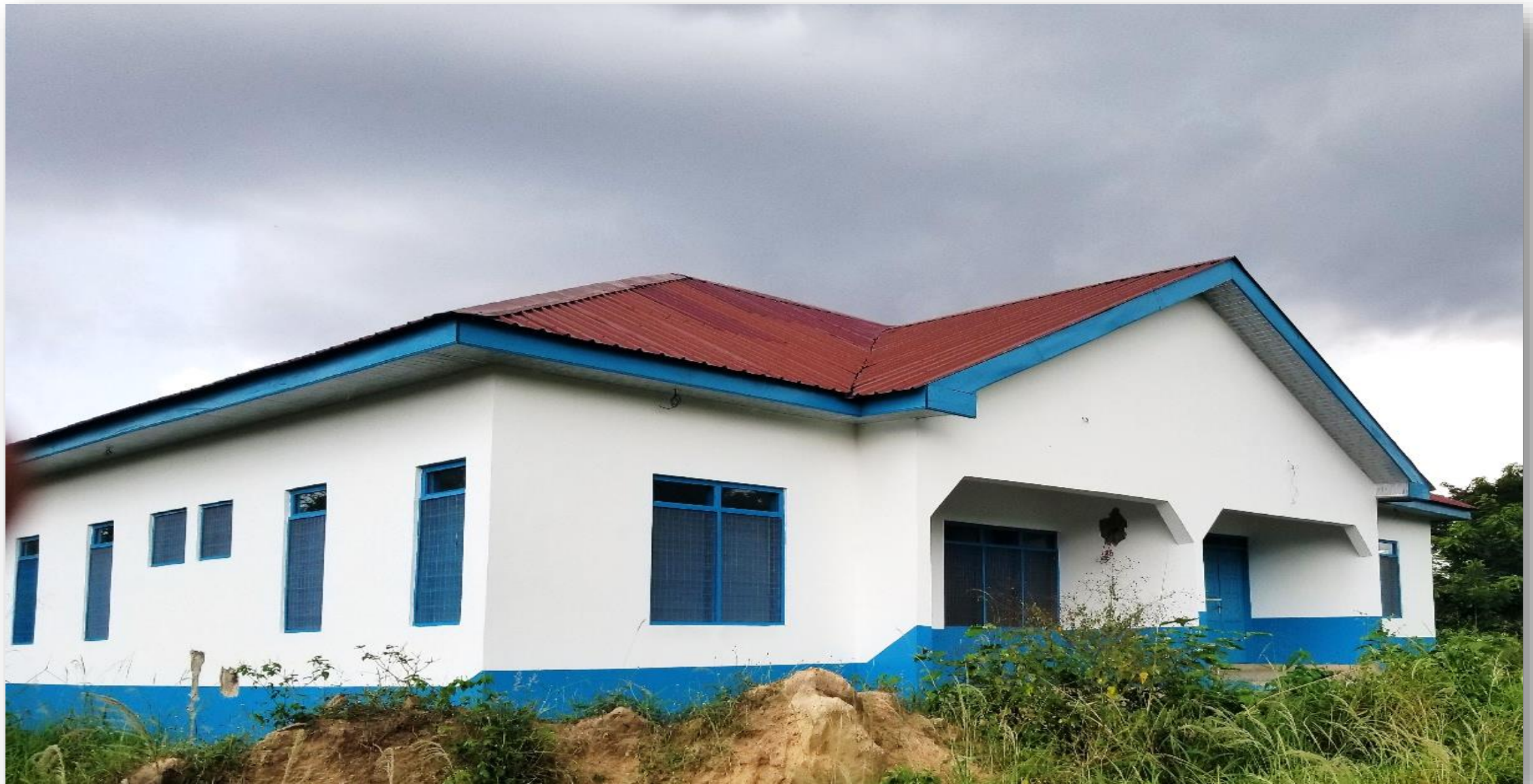
NURSES' QUARTERS WITH MECHANIZED BOREHOLE AT ABOKOBI, GA EAST MUNICIPALITY