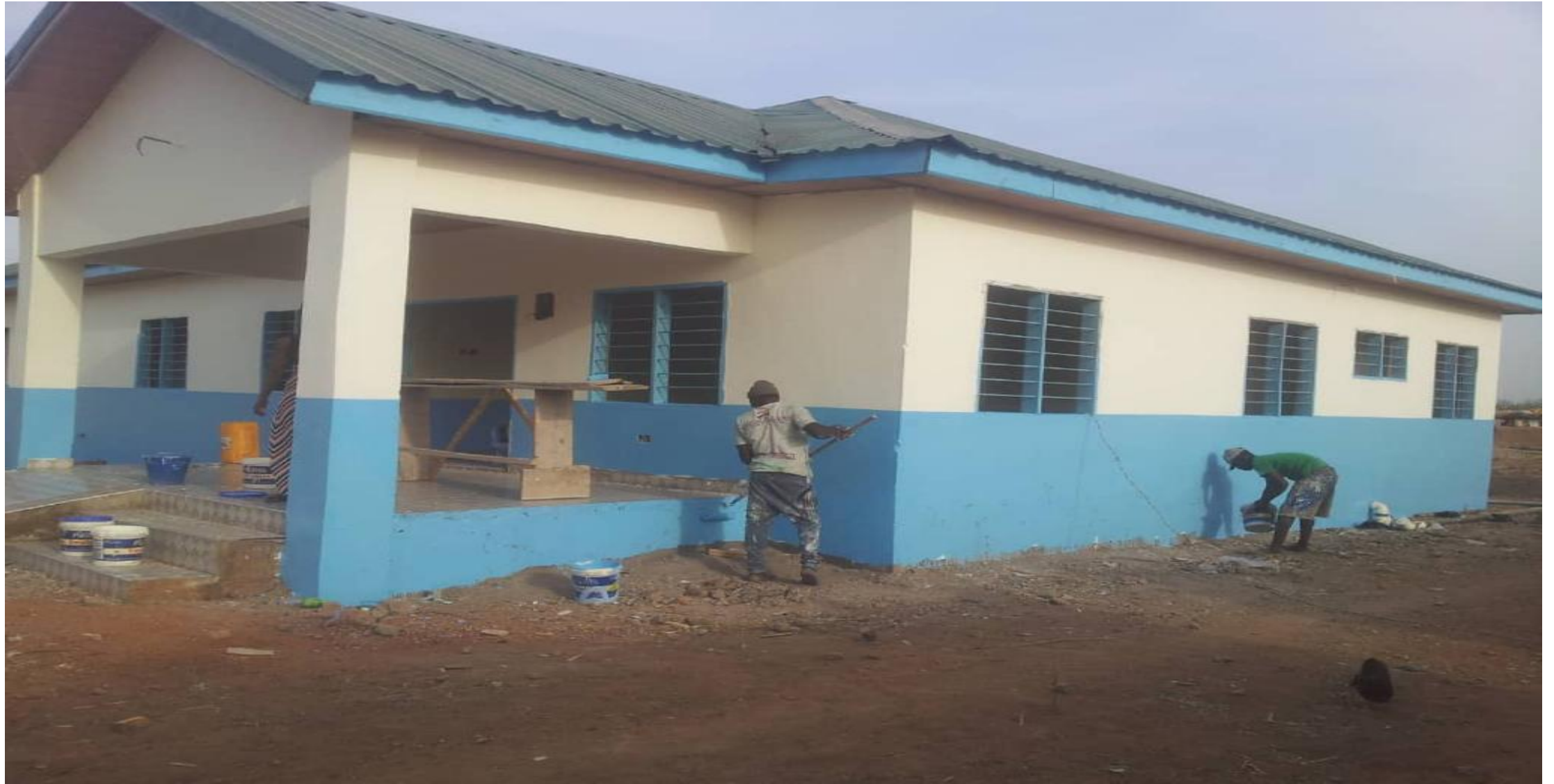
MATERNITY BLOCK AT NAKONG, KASSANA NANKANA WEST DISTRICT