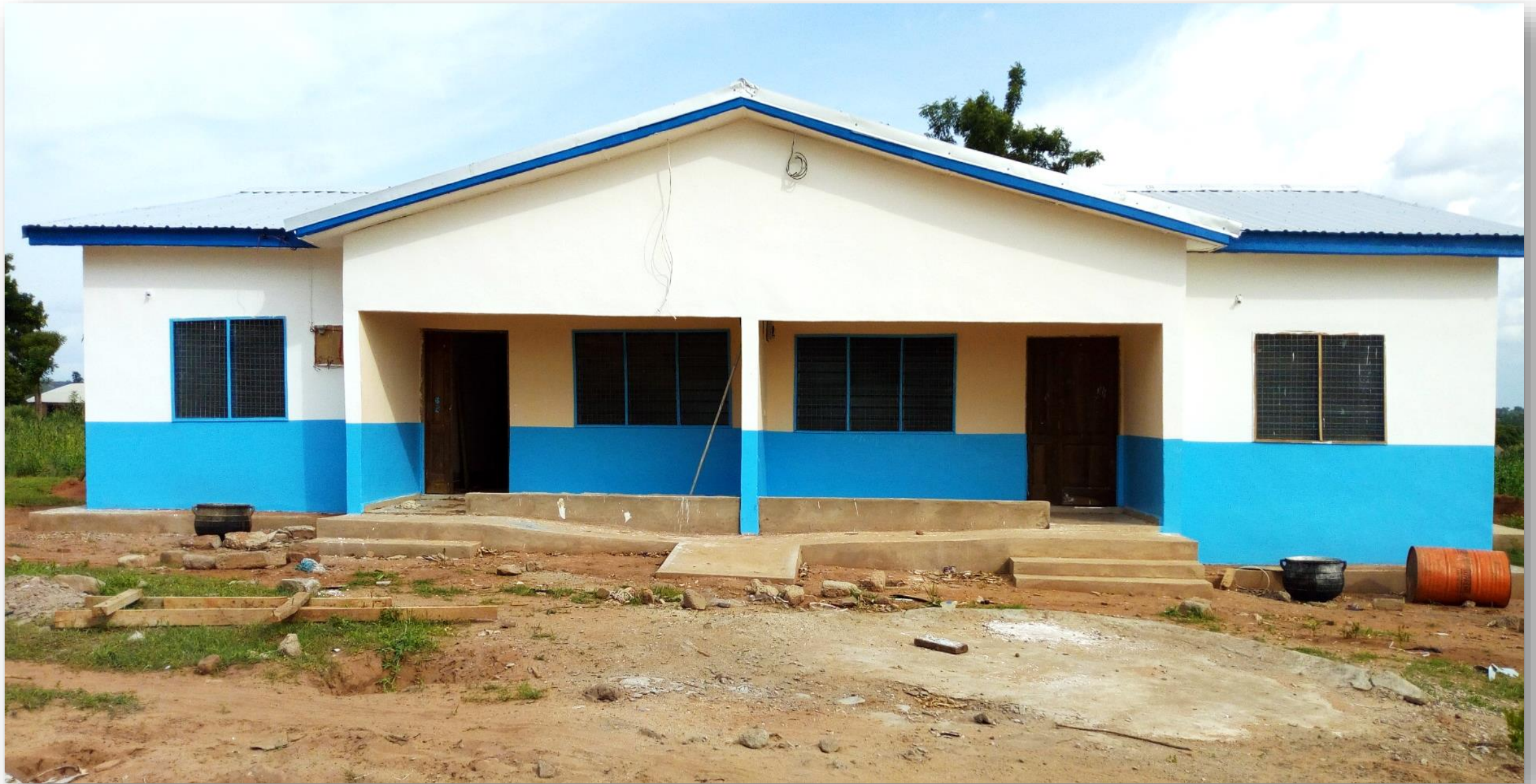
TEACHERS' QUARTERS WITH MECHANIZED BOREHOLE AT KAMBATIAK, BUNKPURUGU-YUNYOO DISTRICT