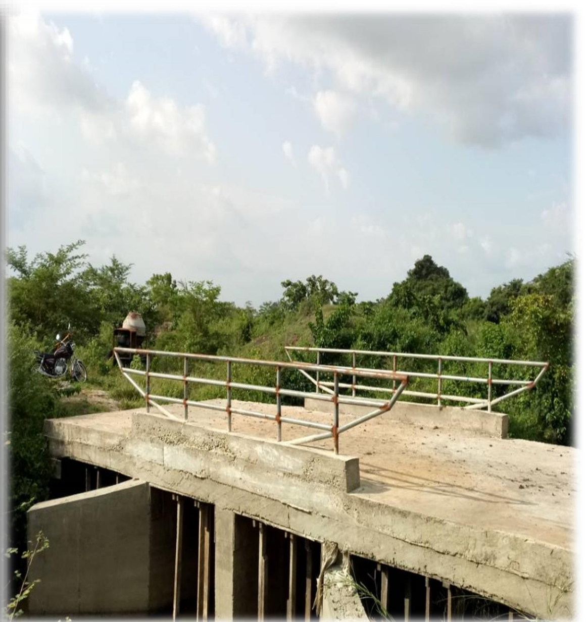
BOX CULVERT AT ABUTIA AGORTIVE, HO WEST DISTRICT