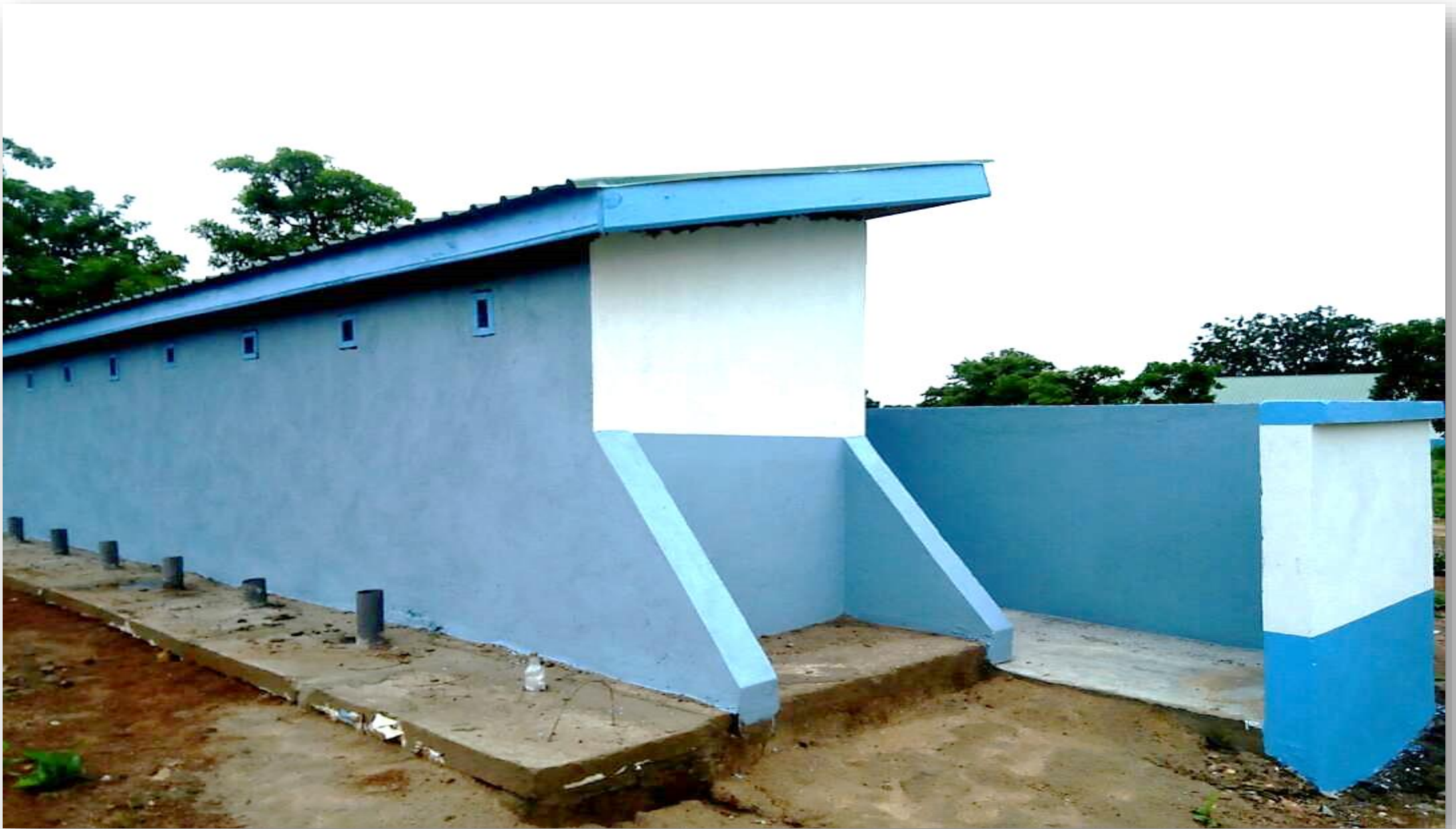
8-SEATER KVIP ATTACHED TO THE 6-UNIT CLASSROOM BLOCK AT WECHIAU, WA WEST DISTRICT