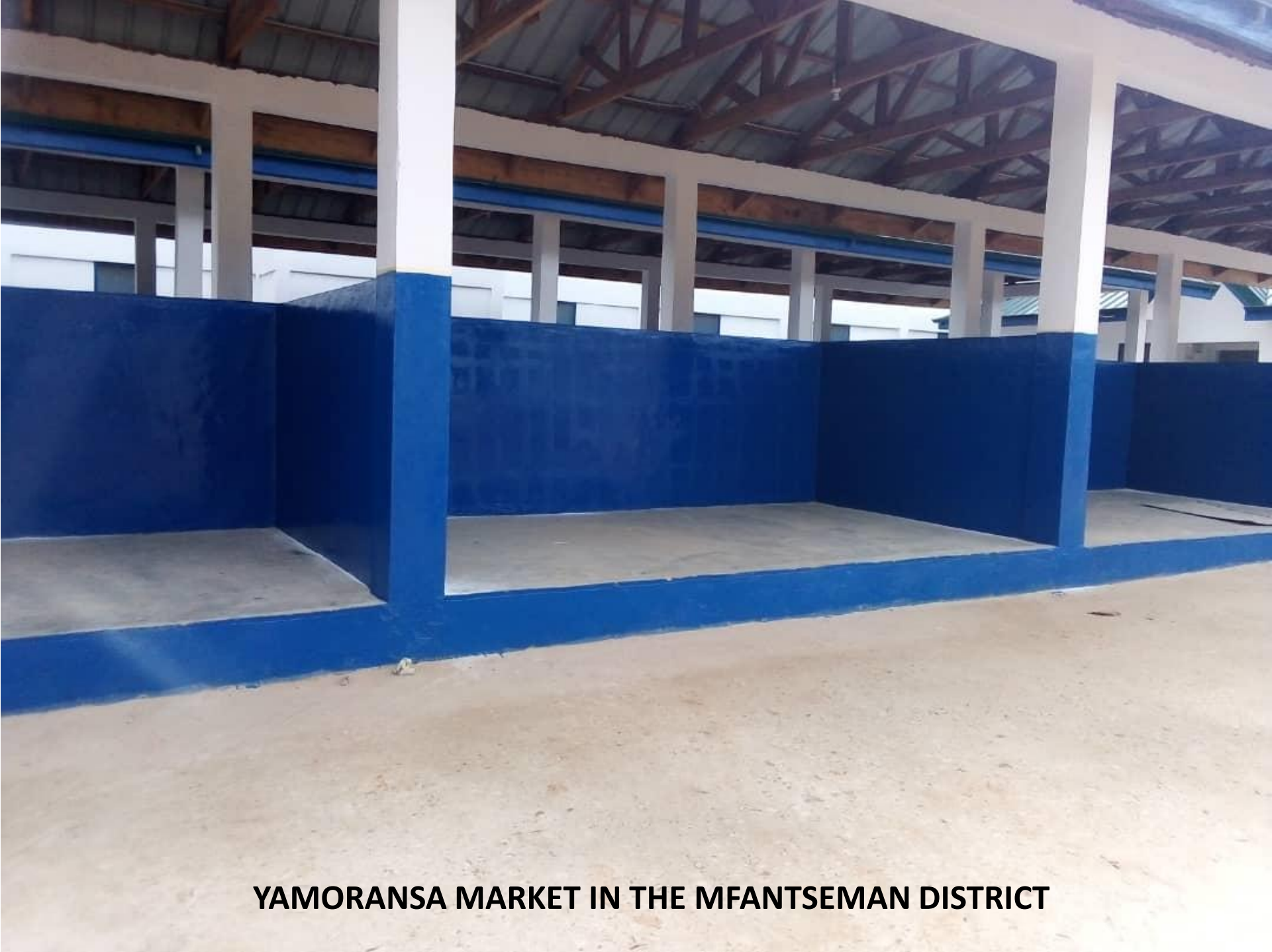
YAMORANSA MARKET IN THE MFANTSEMAN DISTRICT