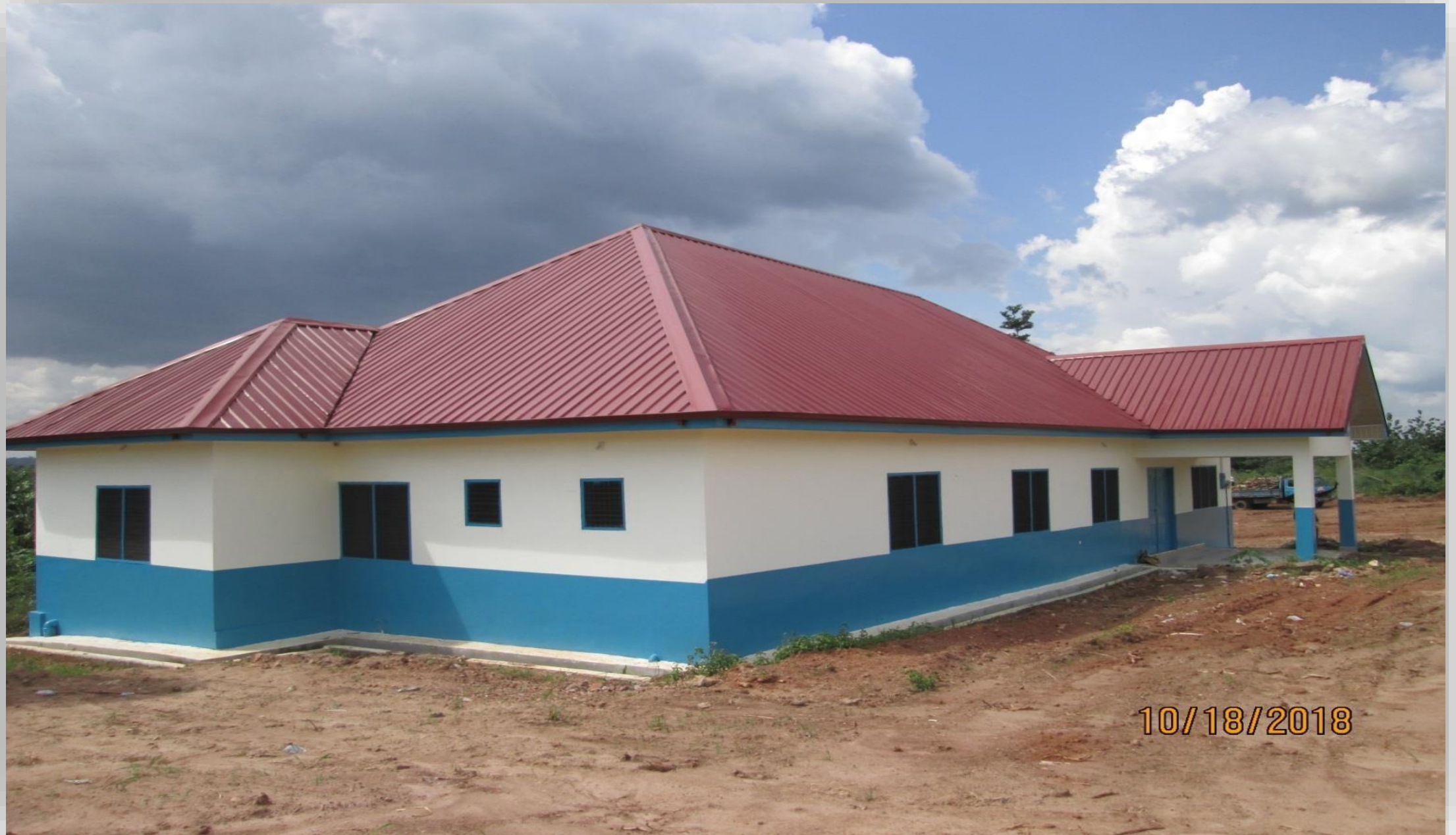
RURAL CLINIC WITH MECHANIZED BOREHOLE AT NKWANTAKESE, AFIGYA KWABRE DISTRICT