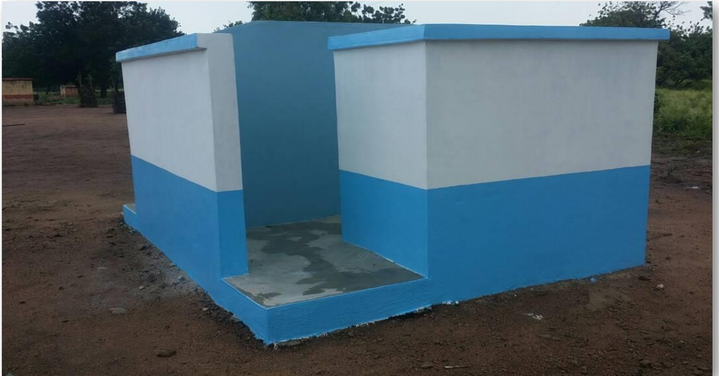
URINAL ATTACHED TO THE 3-UNIT CLASSROOM BLOCK AT TARSAW /KULFUO, SISSALA EAST DISTRICT