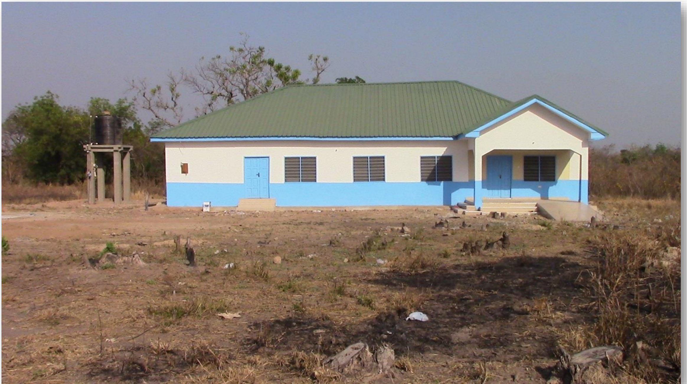
MATERNITY HOME WITH MECHANIZED BOREHOLE AT KASSANA, SISSALA EAST DISTRICT