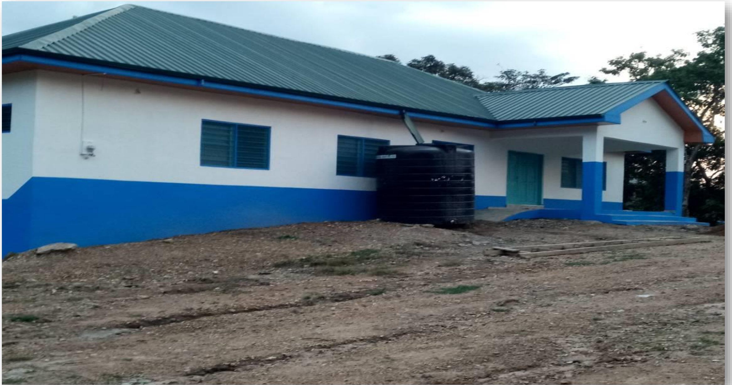
MATERNITY HOME WITH MECHANIZED BOREHOLE AT VANE AVATIME, HO WEST DISTRICT