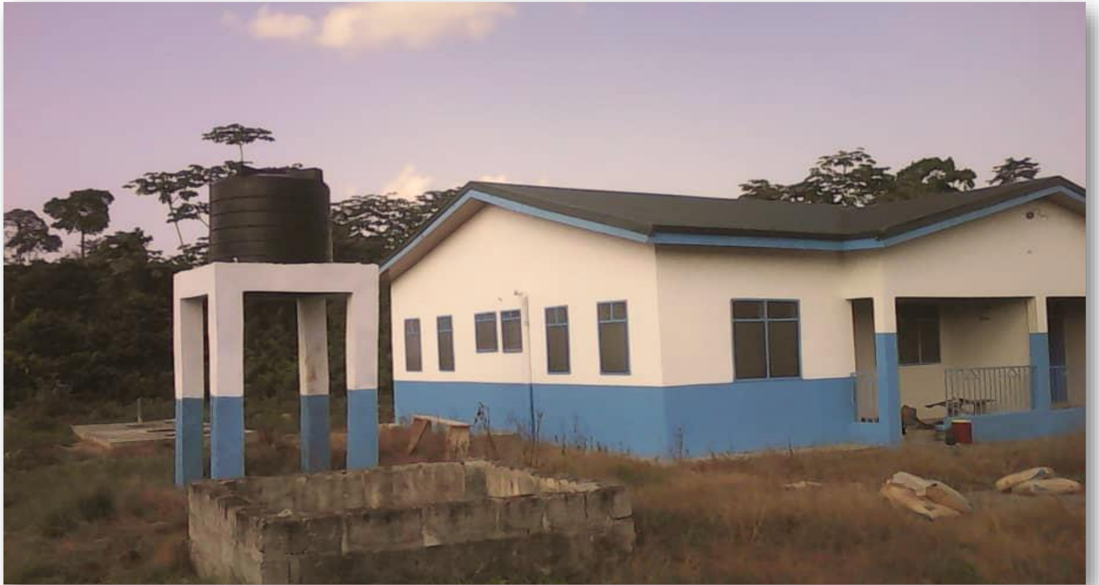
TEACHERS' QUARTERS AT AMOAKU, WASSA AMENFI WEST MUNICIPALITY