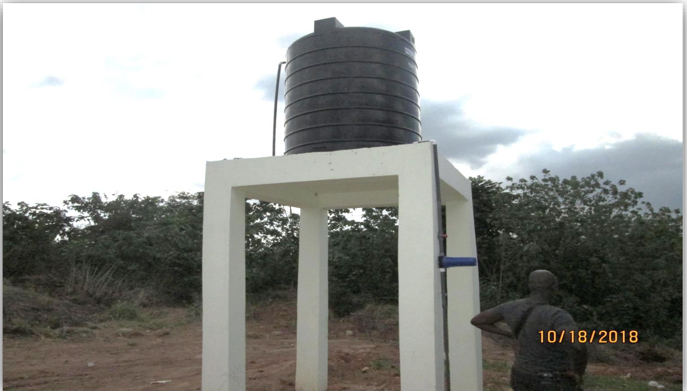
MECHANIZED BOREHOLE ATTACHED TO THE RURAL CLINIC AT NKWANTAKESE, AFIGYA KWABRE DISTRICT