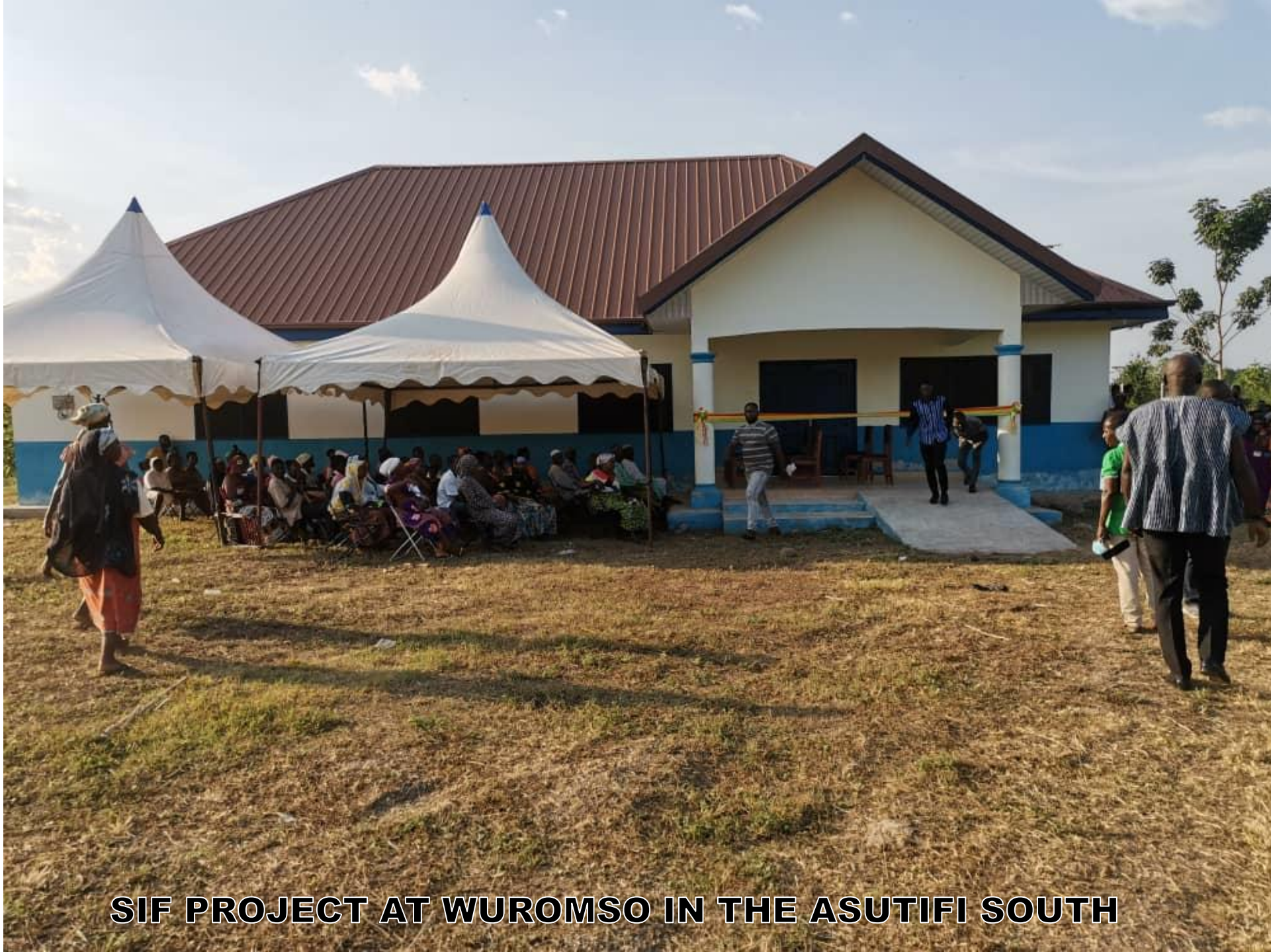
SIF PROJECT AT WUROMSO IN THE ASUTIFI SOUTH