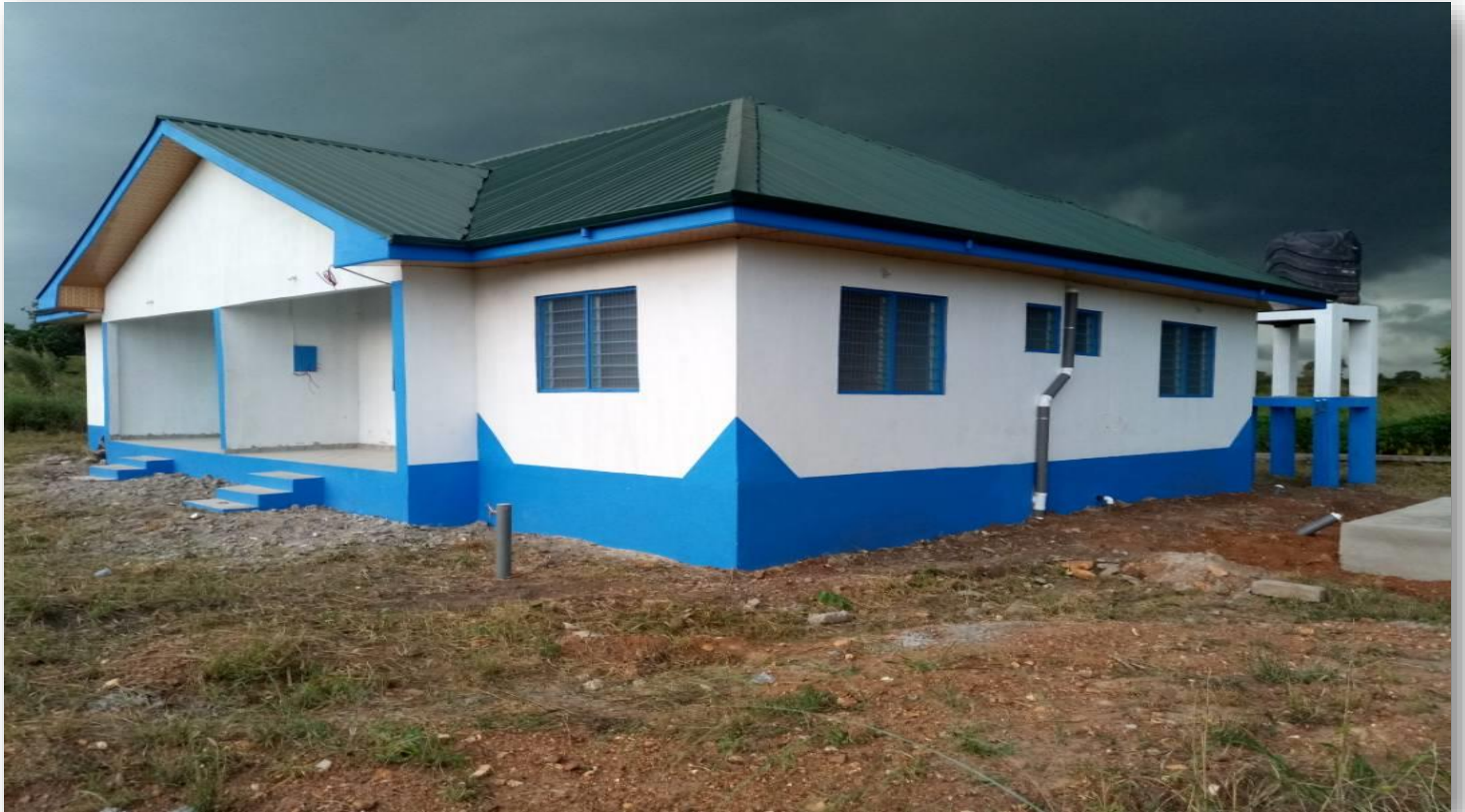
NURSES' QUARTERS WITH MECHANIZED BOREHOLE AT ABUTIA KISSIFLUI, HO WEST DISTRICT