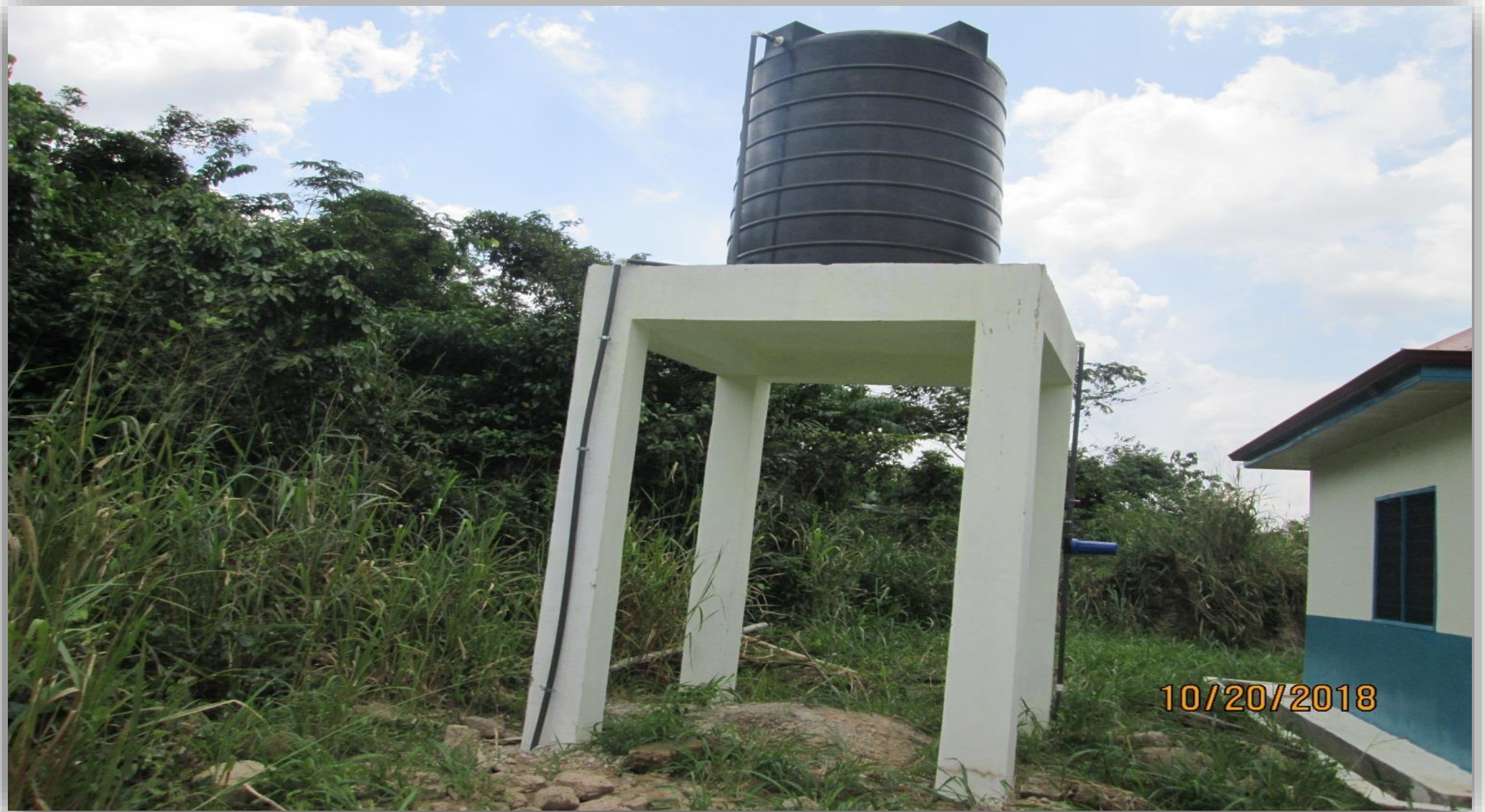
MECHANIZED BOREHOLE ATTACHED TO THE RURAL CLINIC AT ADUBINSOKESE, AFIGYA KWABRE DISTRICT