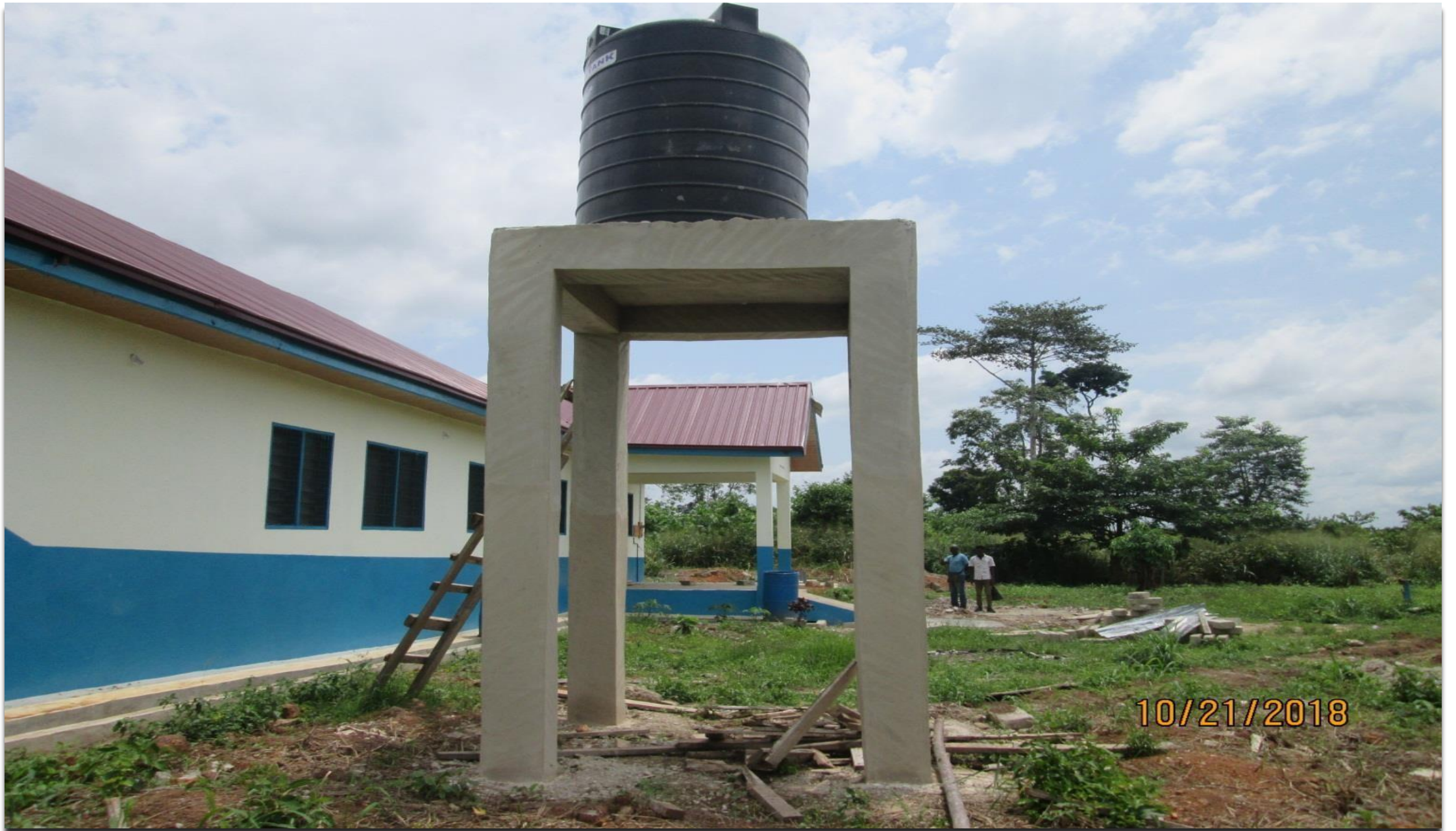
MECHANIZED BOREHOLE ATTACHED TO THE MATERNITY CENTER AT FAWOMAN, AHAFO ANO SOUTH DISTRICT