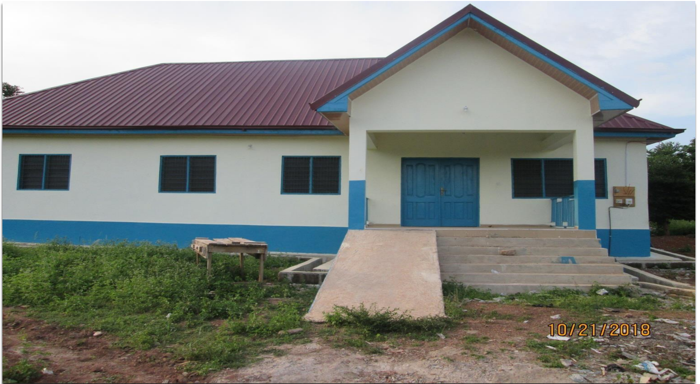
RURAL CLINIC WITH MECHANIZED BOREHOLE AT KUNSU CAMP, AHAFO ANO SOUTH DISTRICT