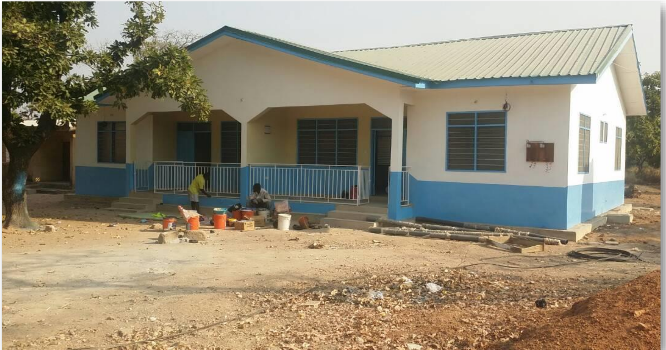
TEACHERS' QUARTERS WITH MECHANIZED BOREHOLE AT BICHEMBOI, SISSALA EAST DISTRICT