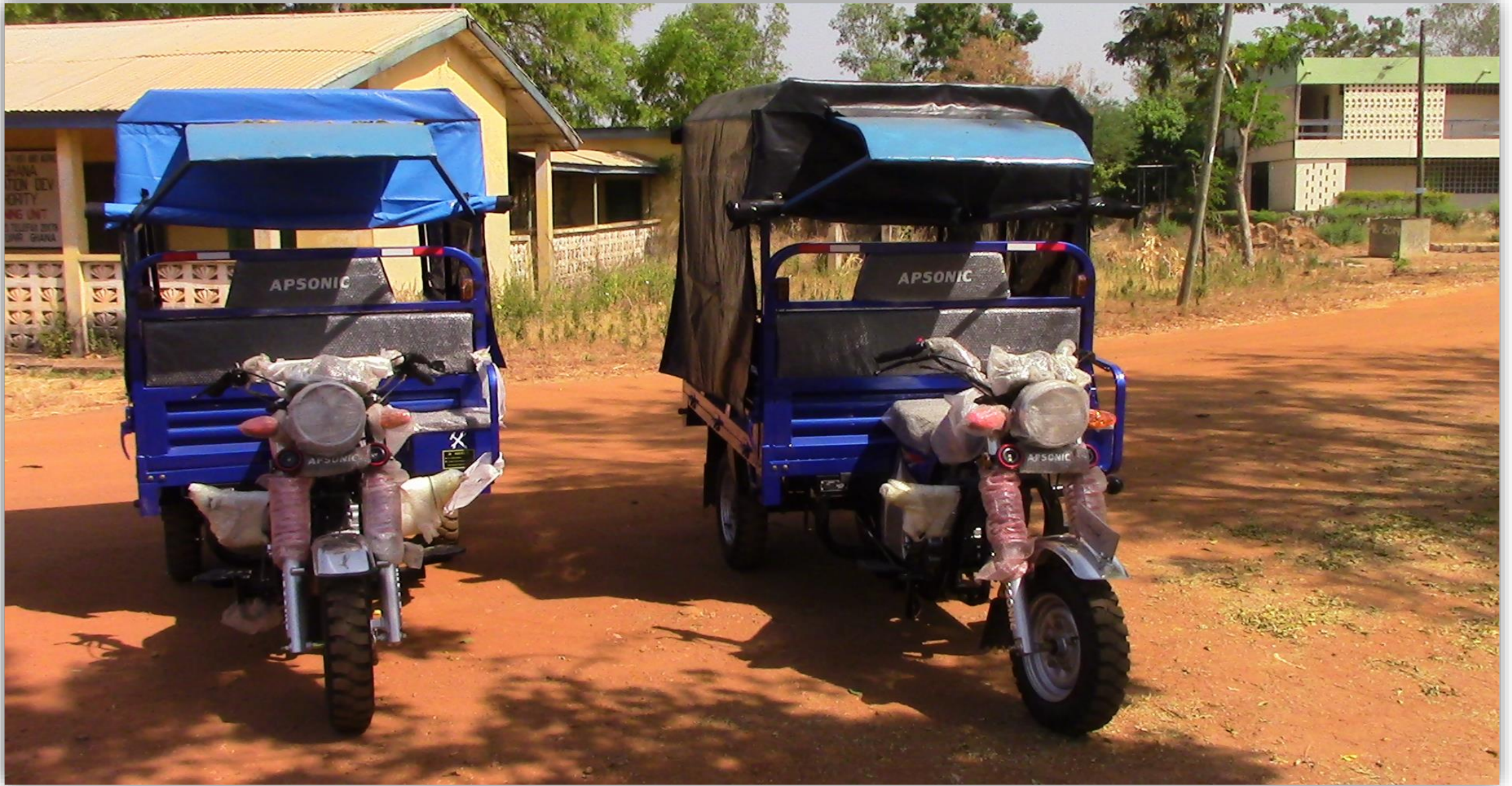
COMMUNITY AMBULANCE FOR THE MATERNITY HOMES AT KASSANA, SISSALA EAST DISTRICT