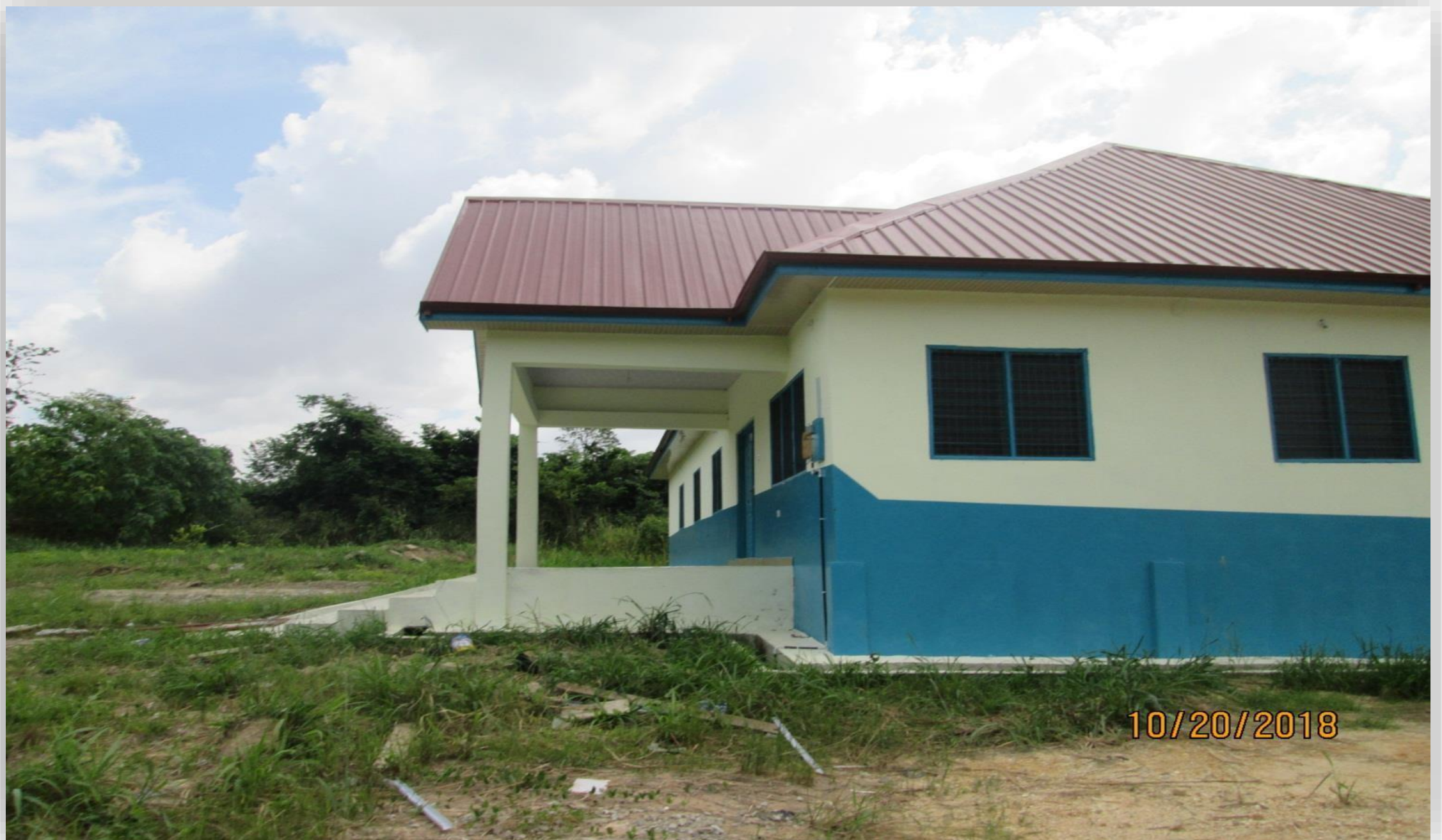
RURAL CLINIC WITH MECHANIZED BOREHOLE AT ADUBINSOKESE, AFIGYA KWABRE DISTRICT