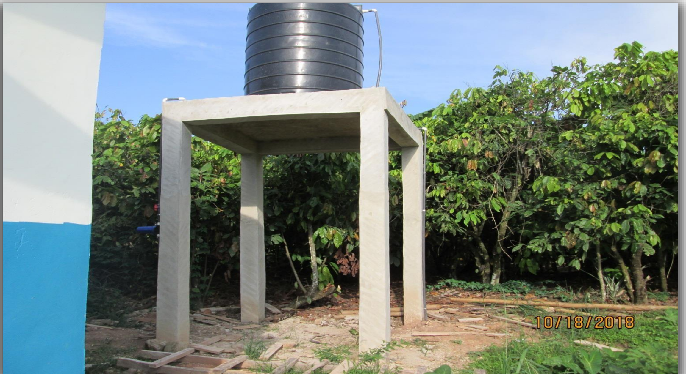
MECHANIZED BOREHOLE ATTACHED TO THE TEACHERS' QUARTERS AT ABIDJAN, AFIGYA KWABRE DISTRICT