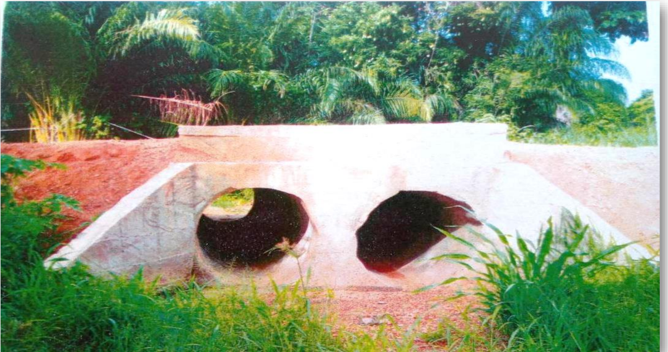
CULVERT AT GBILI, SENE EAST DISTRICT