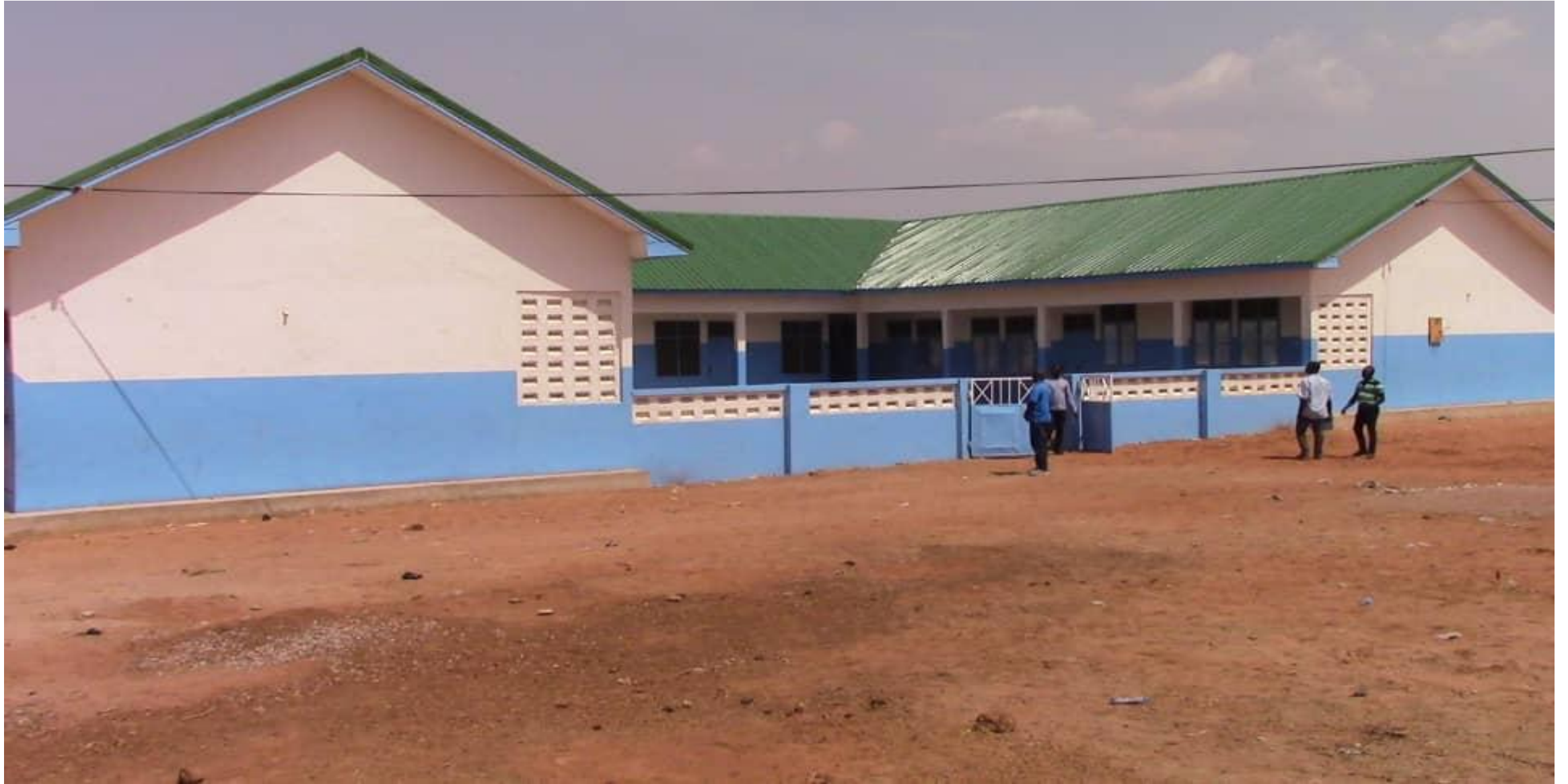
6-UNIT CLASSROOM BLOCK AT KPERIGA, WEST MAMPRUSI MUNICIPALITY