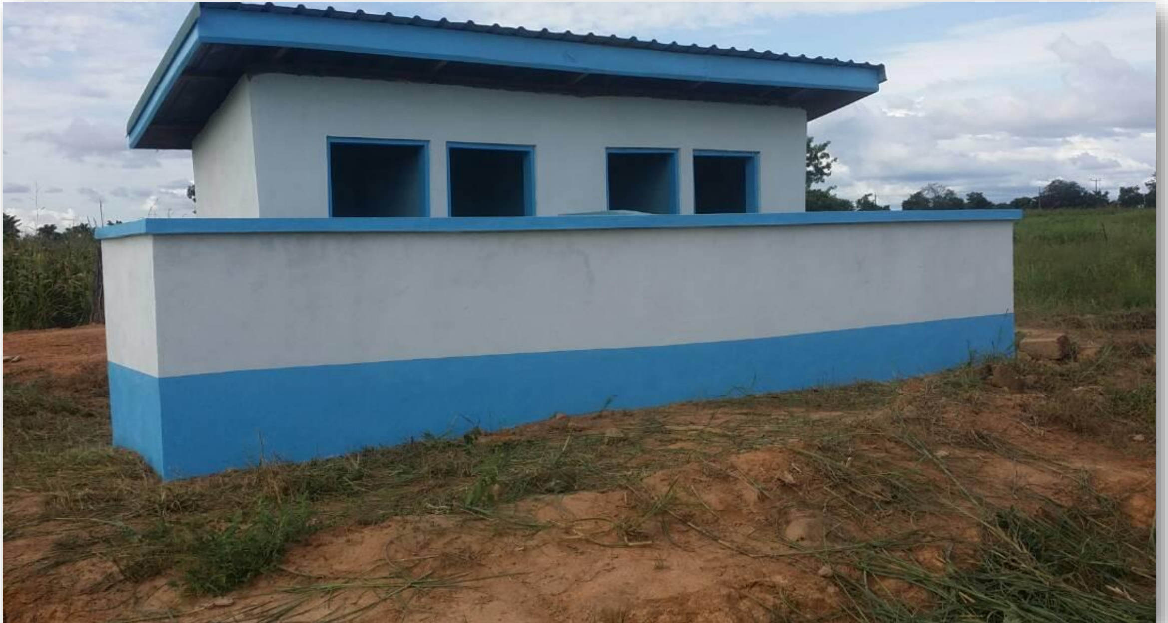
4-SEATER LATRINE ATTACHED TO THE 3-UNIT CLASSROOM BLOCK AT TARSAW /KULFUO, SISSALA EAST DISTRICT