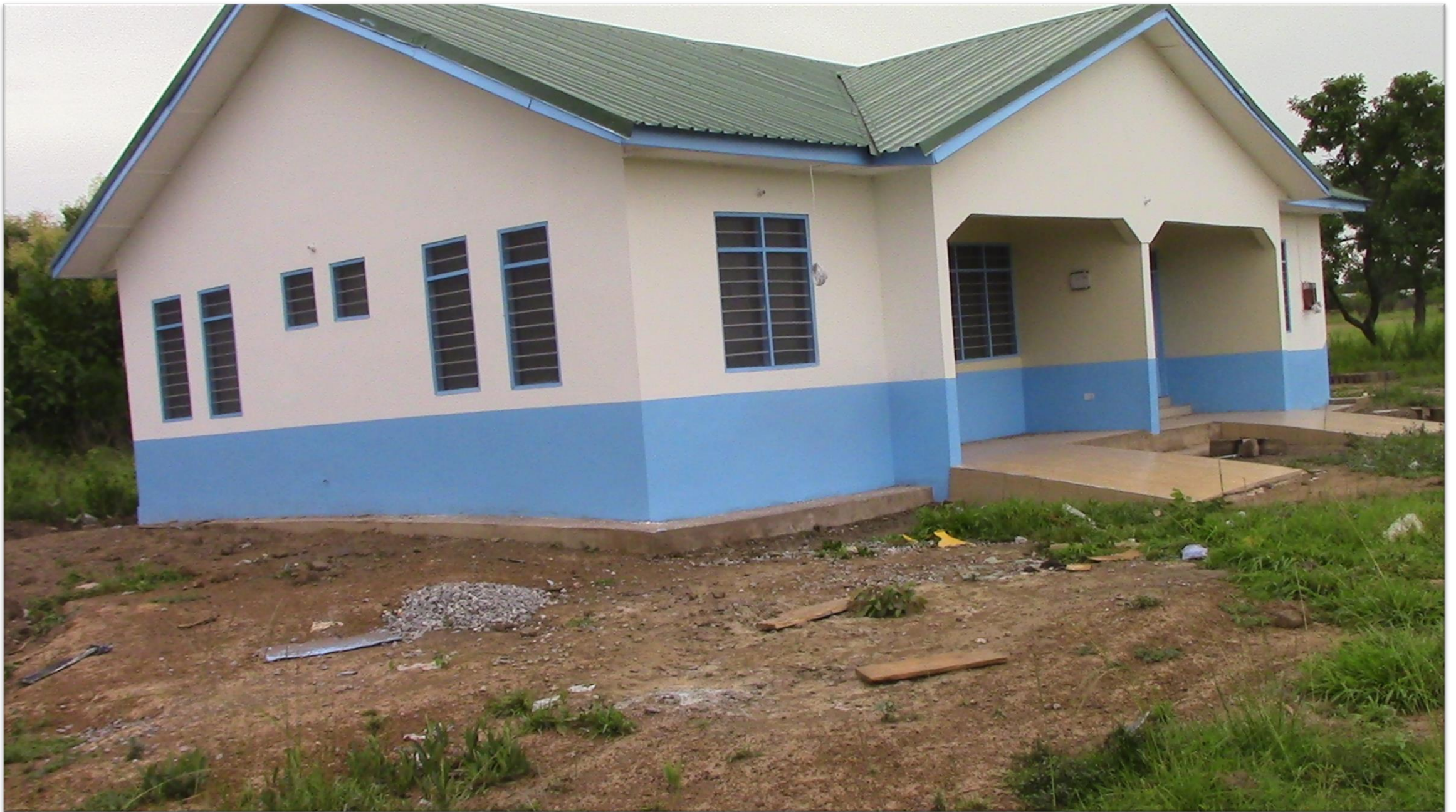
TEACHERS' QUARTERS WITH MECHANIZED BOREHOLE AT GBACHE, WA WEST DISTRICT