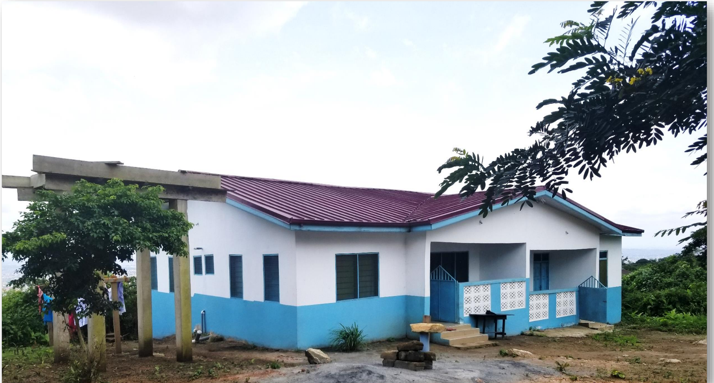
TEACHERS' QUARTERS WITH MECHANIZED BOREHOLE AT ADENKREBI, GA EAST MUNICIPALITY