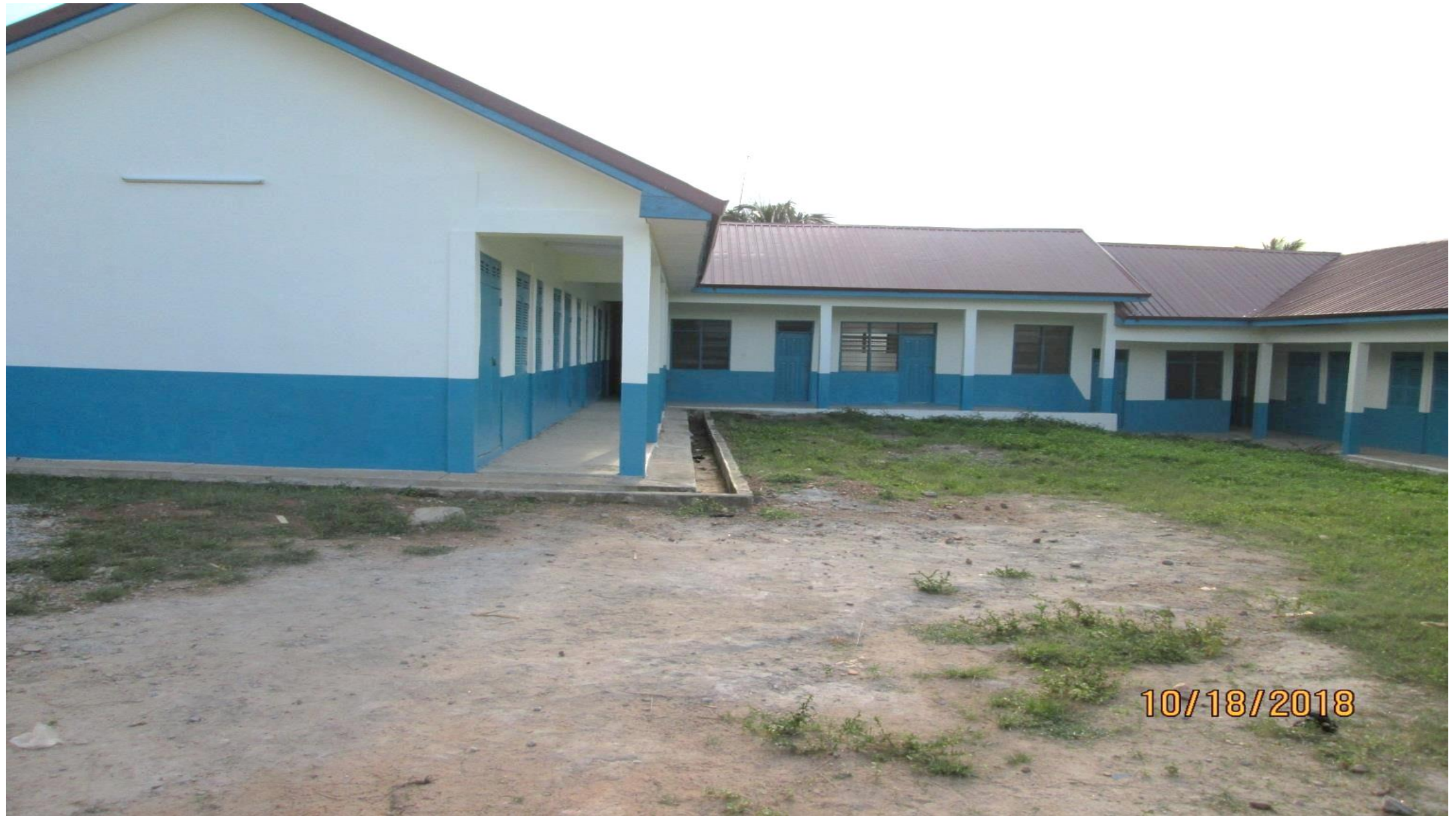
6-UNIT CLASSROOM BLOCK WITH 8-SEATER LATRINE AT TETREM, AFIGYA KWABRE DISTRICT