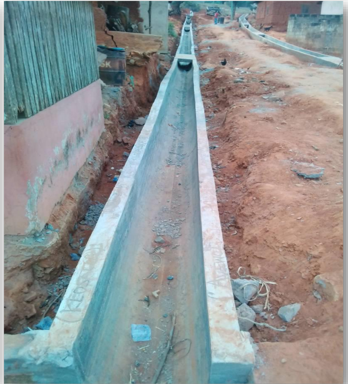
U-DRAIN AT AKOME, HO WEST DISTRICT