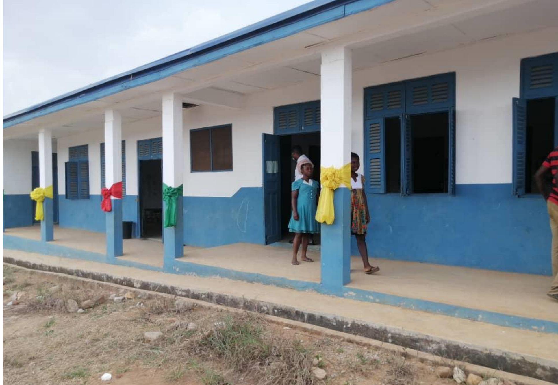
6 UNIT CLASSROOM BLOCK AT KASAAM IN THE KWABRE EAST DISTRICT