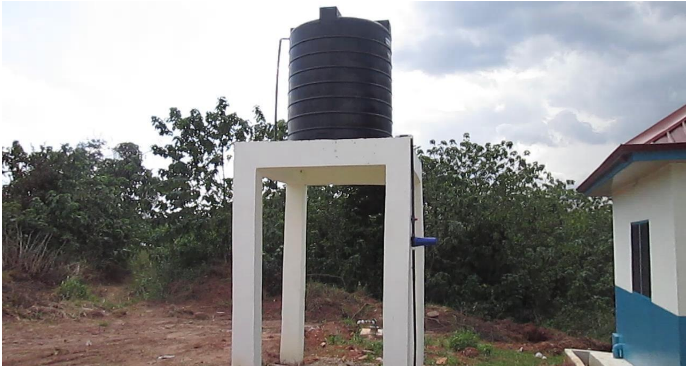
MECHANIZED BOREHOLE ATTACHED TO THE TEACHERS' QUARTERS AT ASUKESE, AHAFO-ANO SOUTH DISTRICT