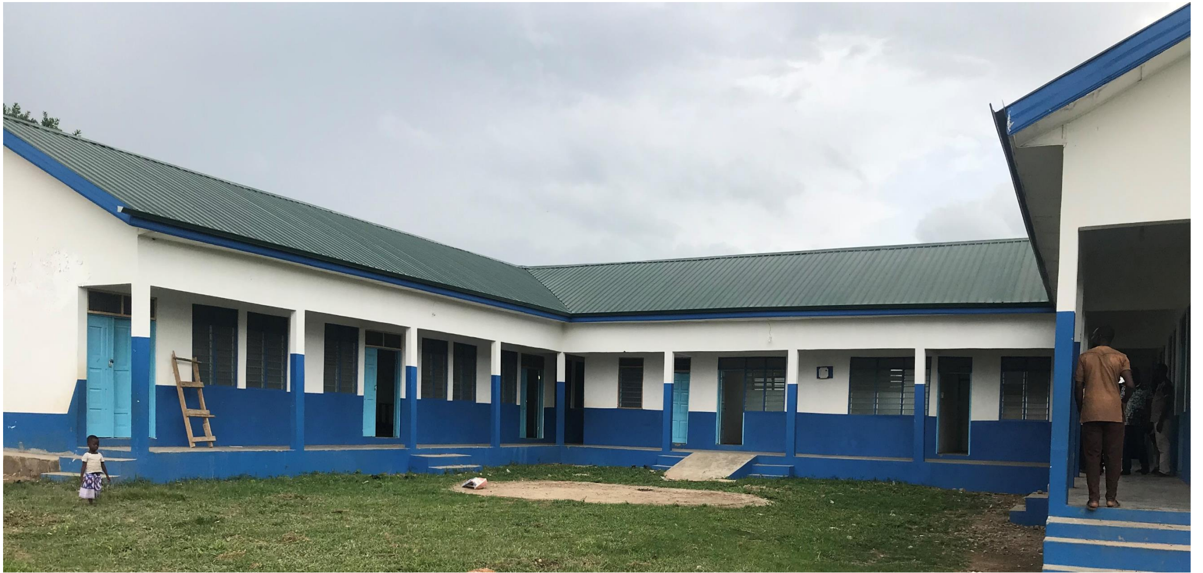
SIX-UNIT CLASSROOM BLOCK WITH 8-SEATER LATRINE AT NABU, NKWANTA NORTH DISTRICT