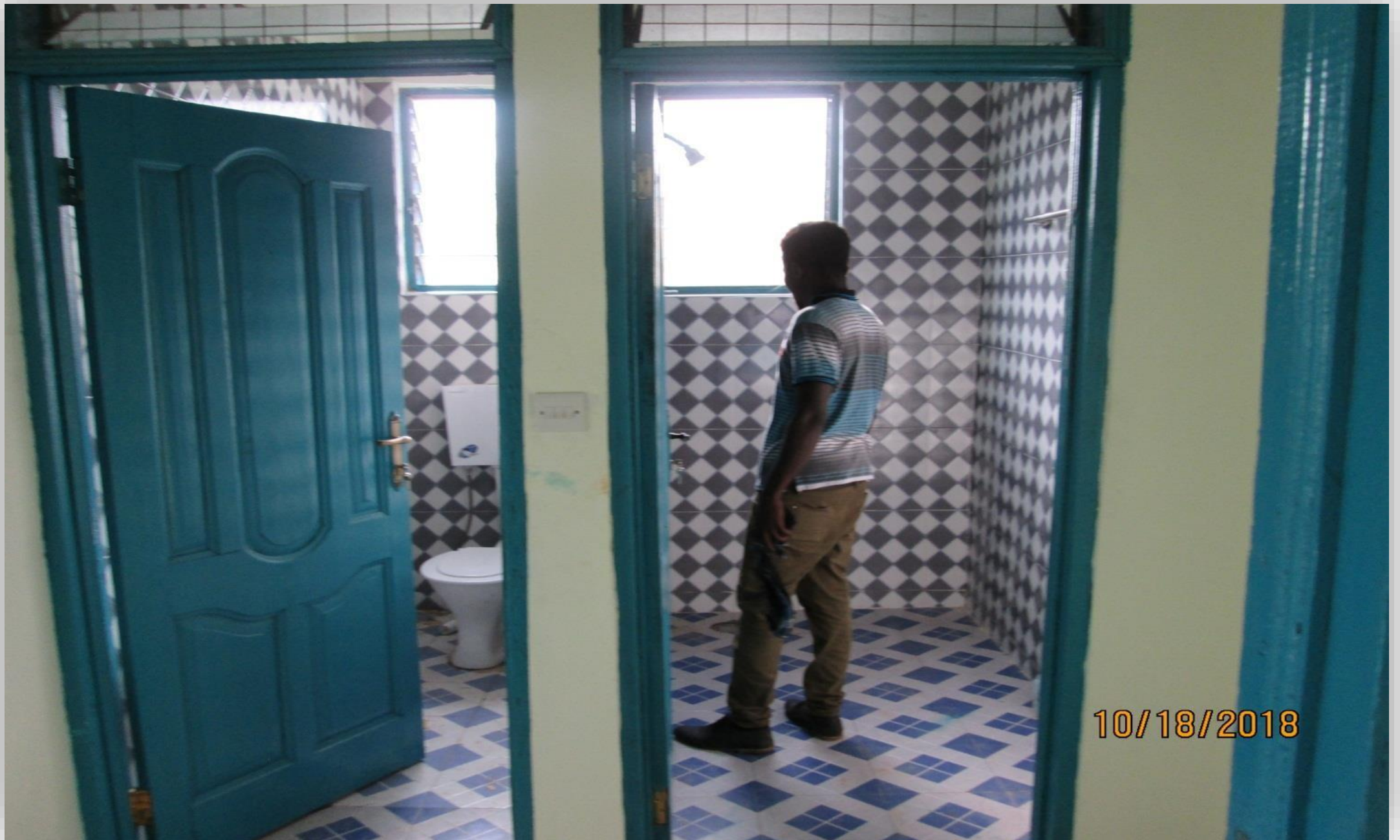
TEACHERS' QUARTERS WITH MECHANIZED BOREHOLE AT ABIDJAN - CONTINUED, AFIGYA KWABRE DISTRICT