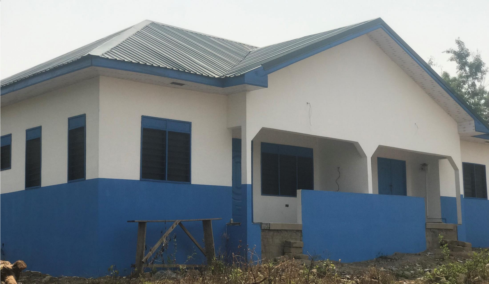
Nurses Quarters with potable water at Essuomanya in the Upper Manya Krobo District