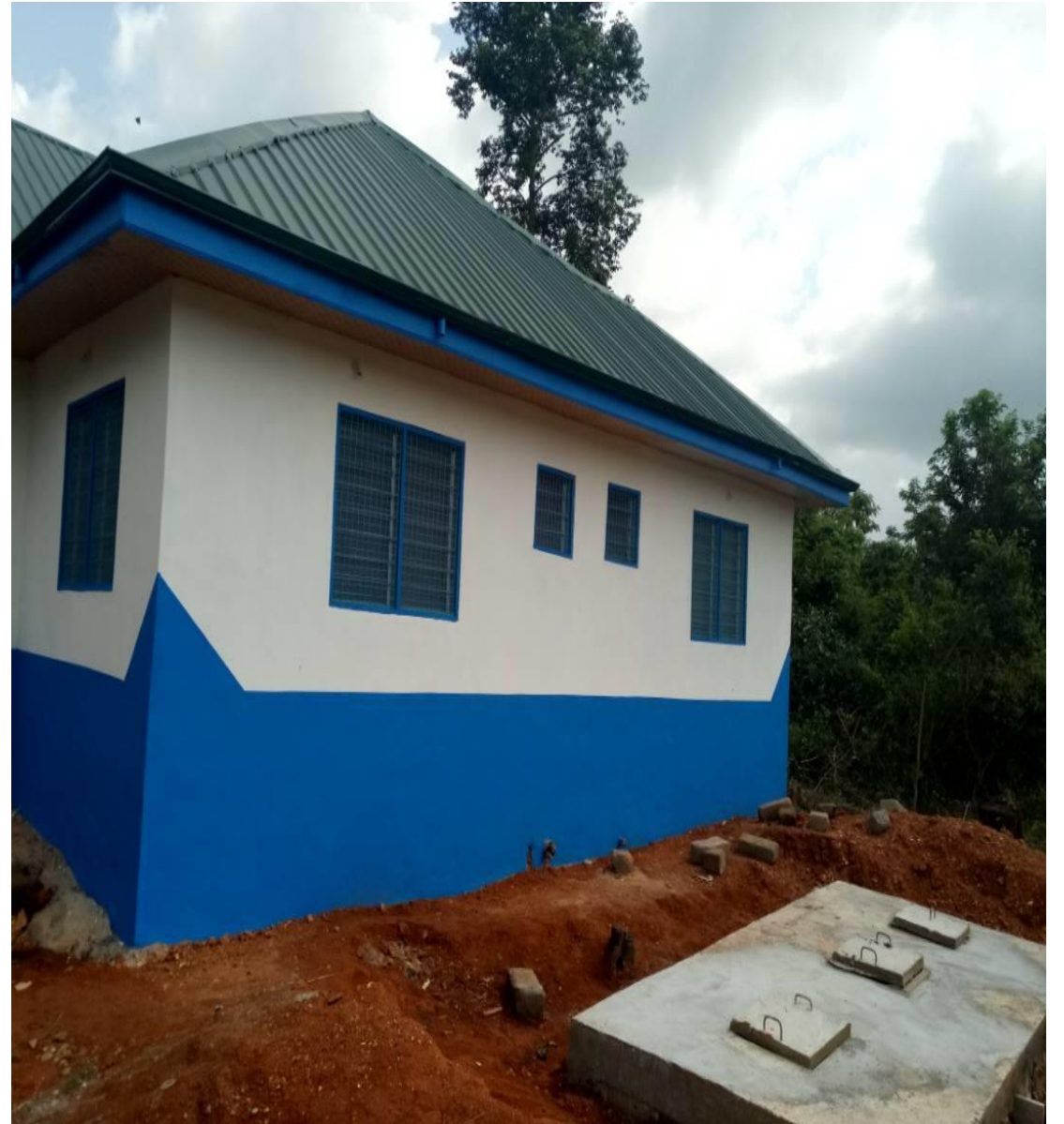
NURSES' QUARTERS WITH MECHANIZED BOREHOLE AT ASHANTI KPOETA, HO WEST DISTRICT