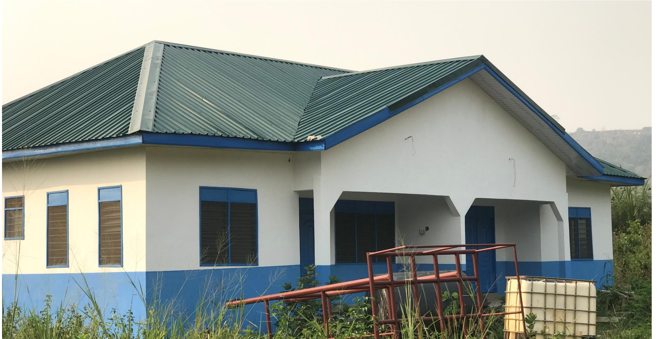
Nurses Quarters with potable water at Akateng