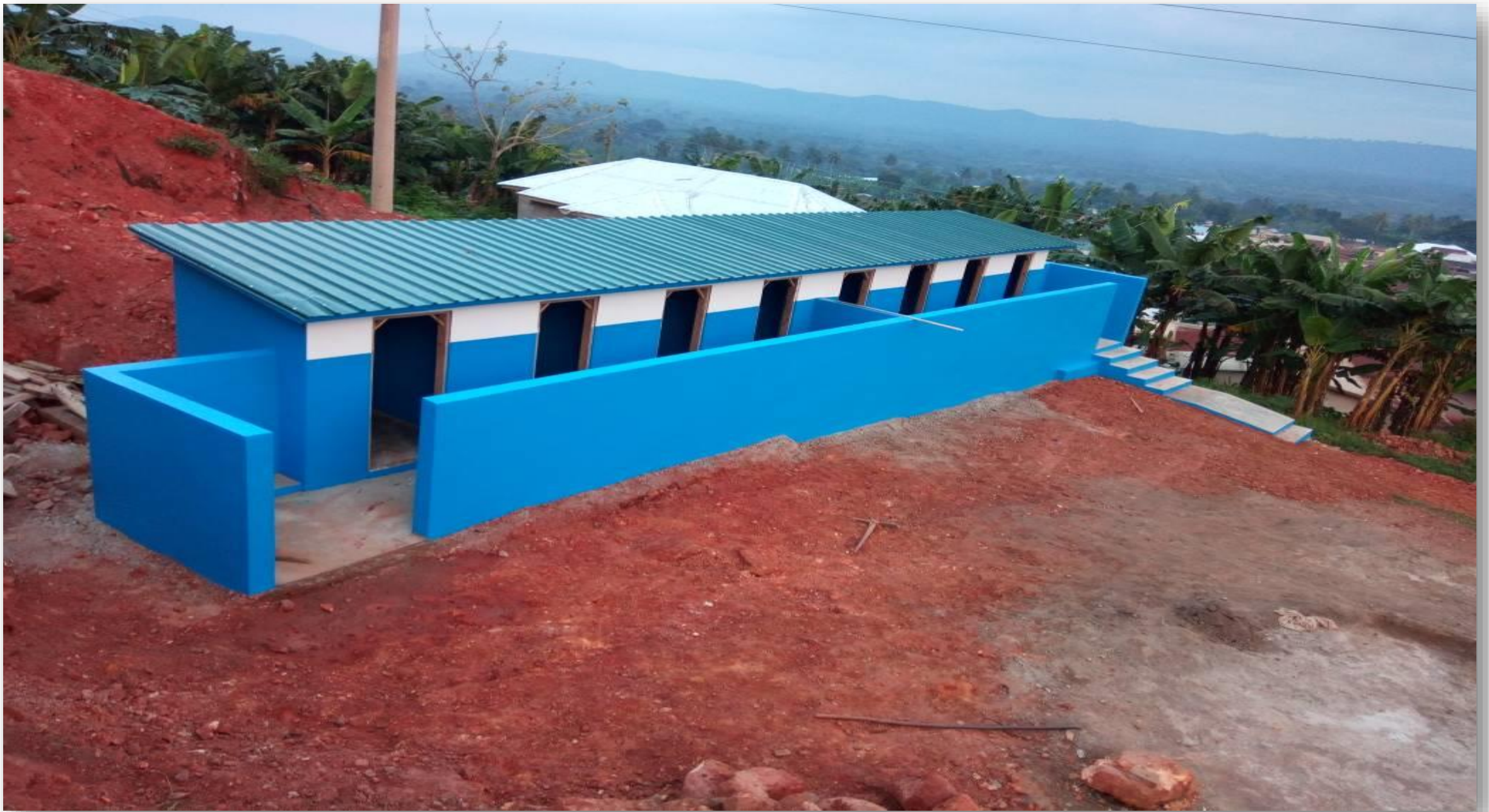
8-SEATER KVIP ATTACHED TO THE 6-UNIT CLASSROOM BLOCK AT TSITO, HO WEST DISTRICT