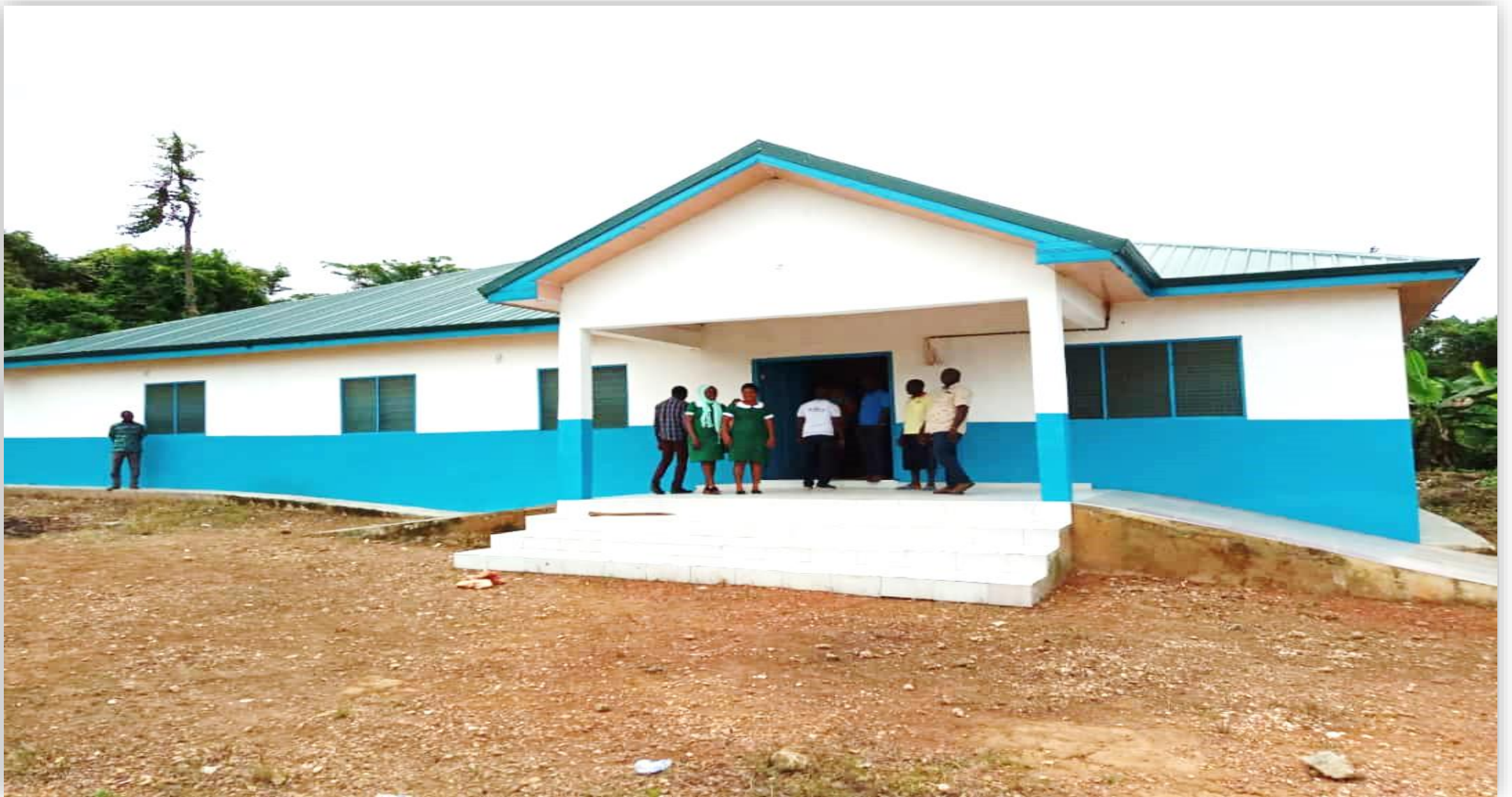
RURAL CLINIC WITH MECHANIZED BOREHOLE AT NKOTOMSO, UPPER DENKYIRA WEST DISTRICT