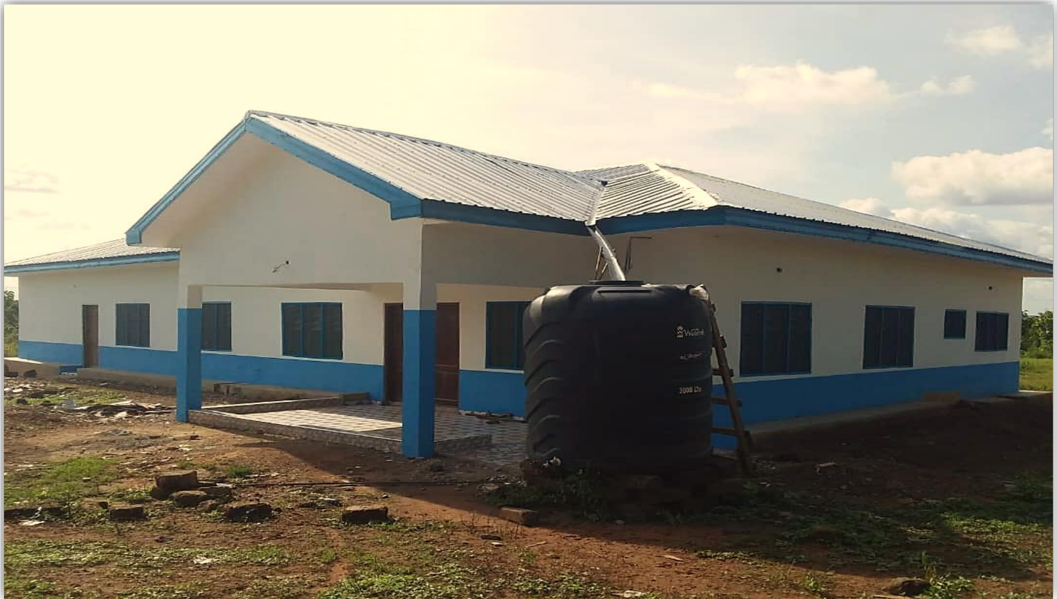
MATERNITY CENTER WITH MECHANIZED BOREHOLE AT GBUNGBALIGA, NANUMBA SOUTH DISTRICT