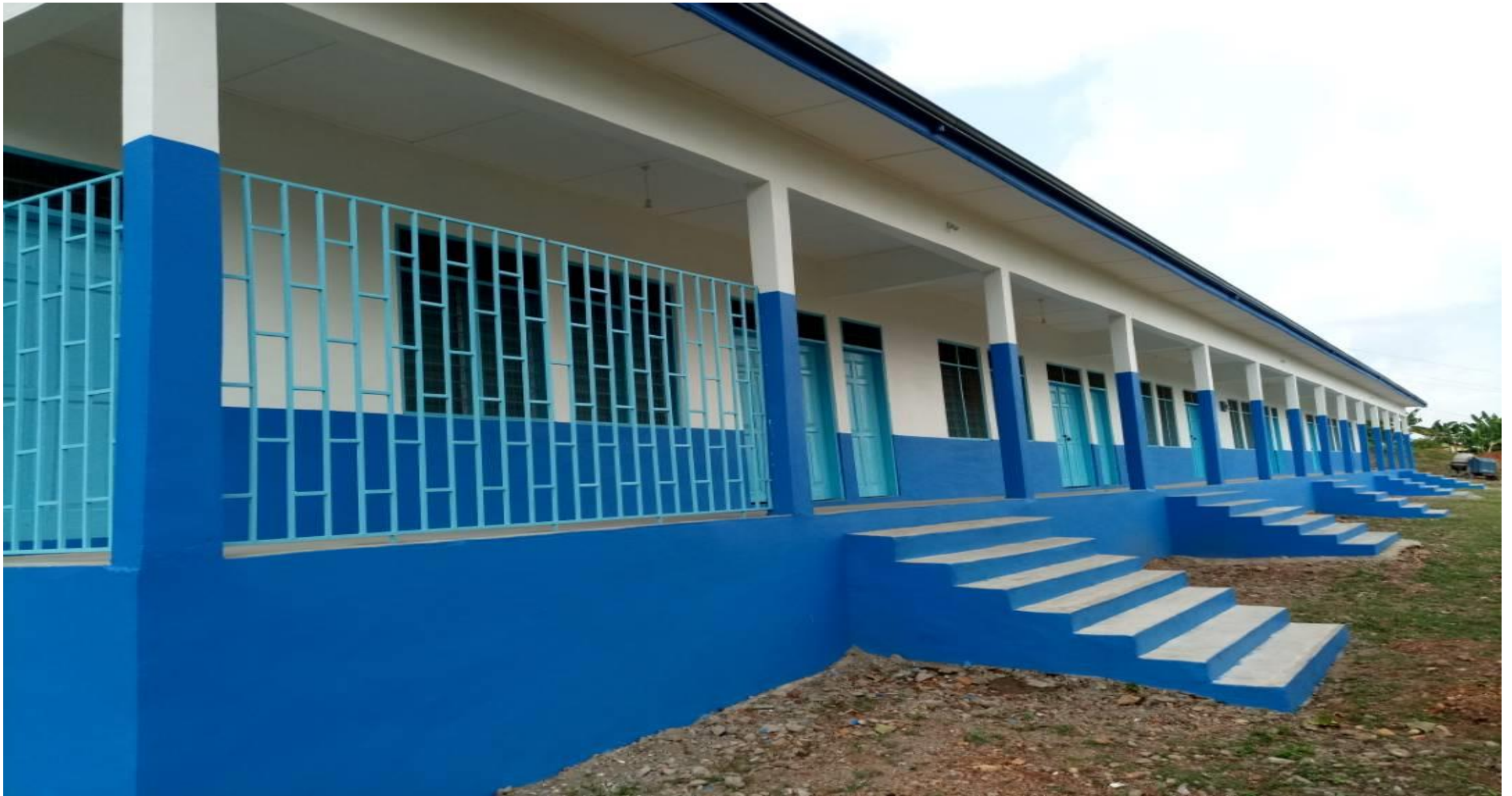
6-UNIT CLASSROOM BLOCK WITH 8-SEATER LATRINE AT TSITO, HO WEST DISTRICT