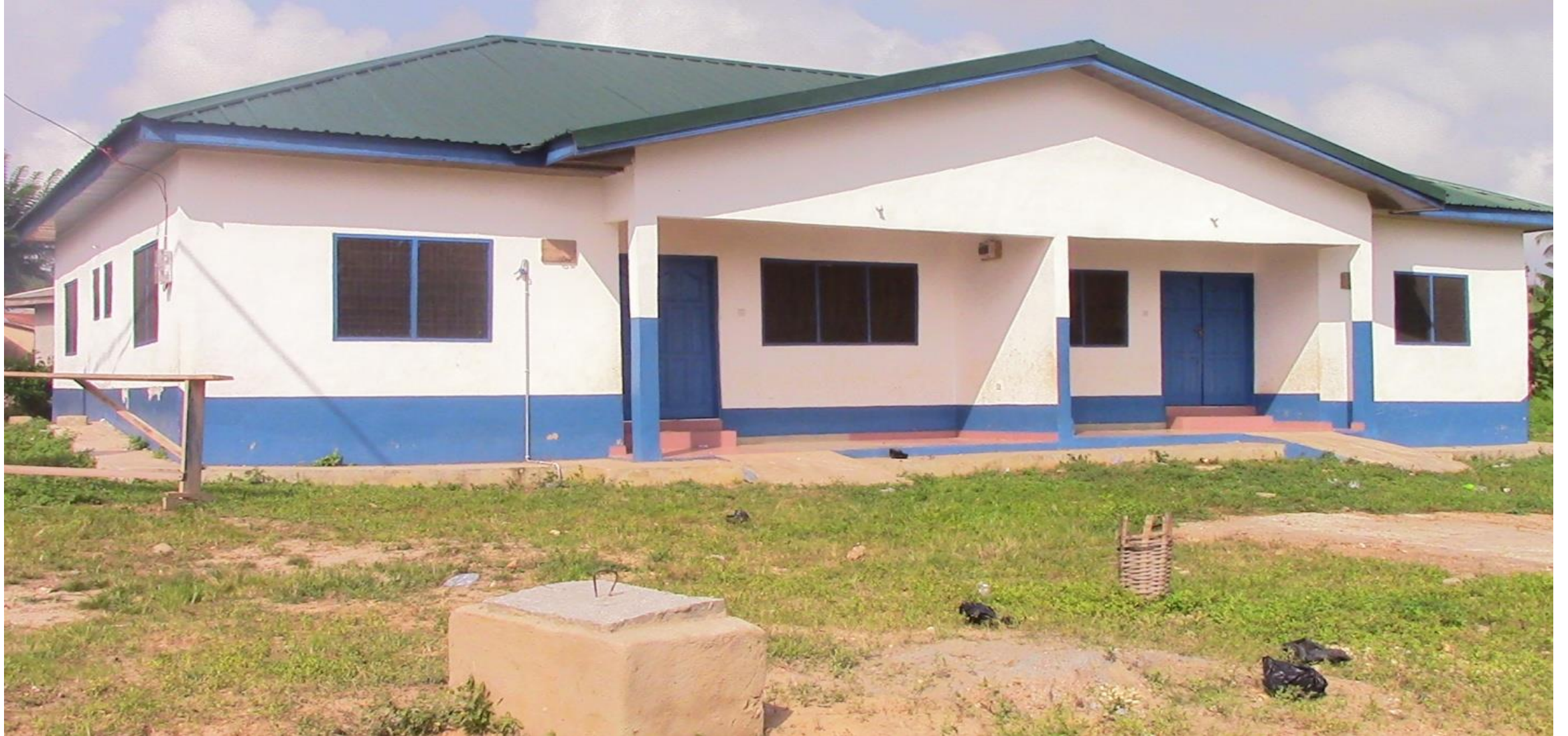
2-UNIT SEMI DETACHED NURSES QUARTERS AT NYINAWUSU, UPPER DENKYIRA WEST DISTRICT