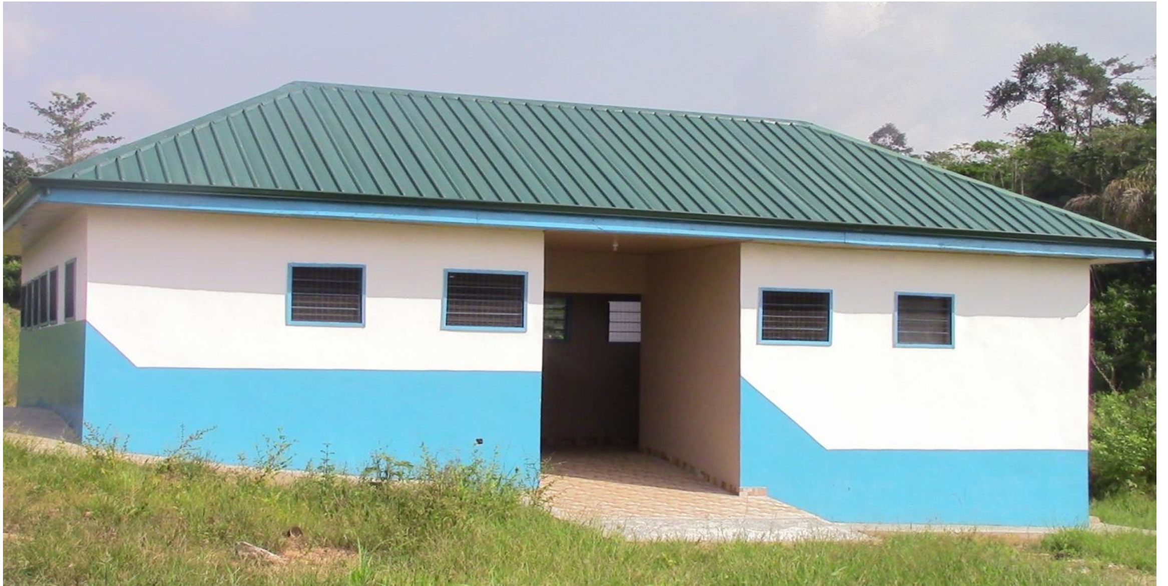
10-SEATER WC FACILITY ATTACHED TO THE MARKET AT ASANKRAGUA, AMENFI WEST MUNICIPALITY