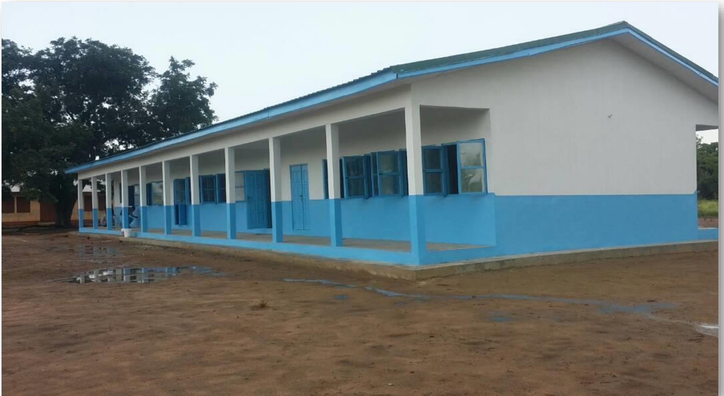
3-UNIT CLASSROOM BLOCK WITH URINAL AND 4-SEATER LATRINE AT KUROBOI, SISSALA EAST DISTRICT