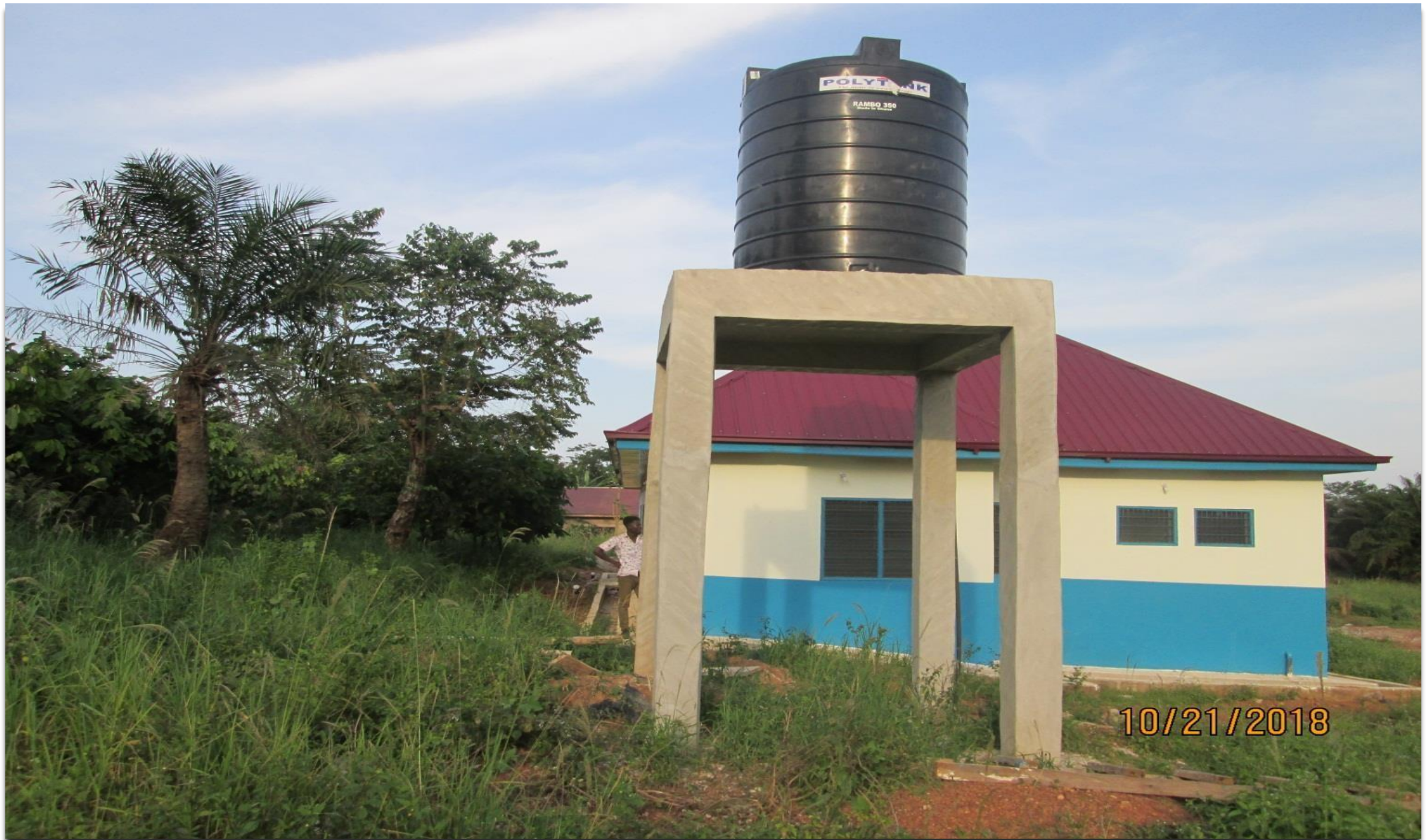
MECHANIZED BOREHOLE ATTACHED TO THE RURAL CLINIC AT KUNSU CAMP, AHAFO ANO SOUTH DISTRICT