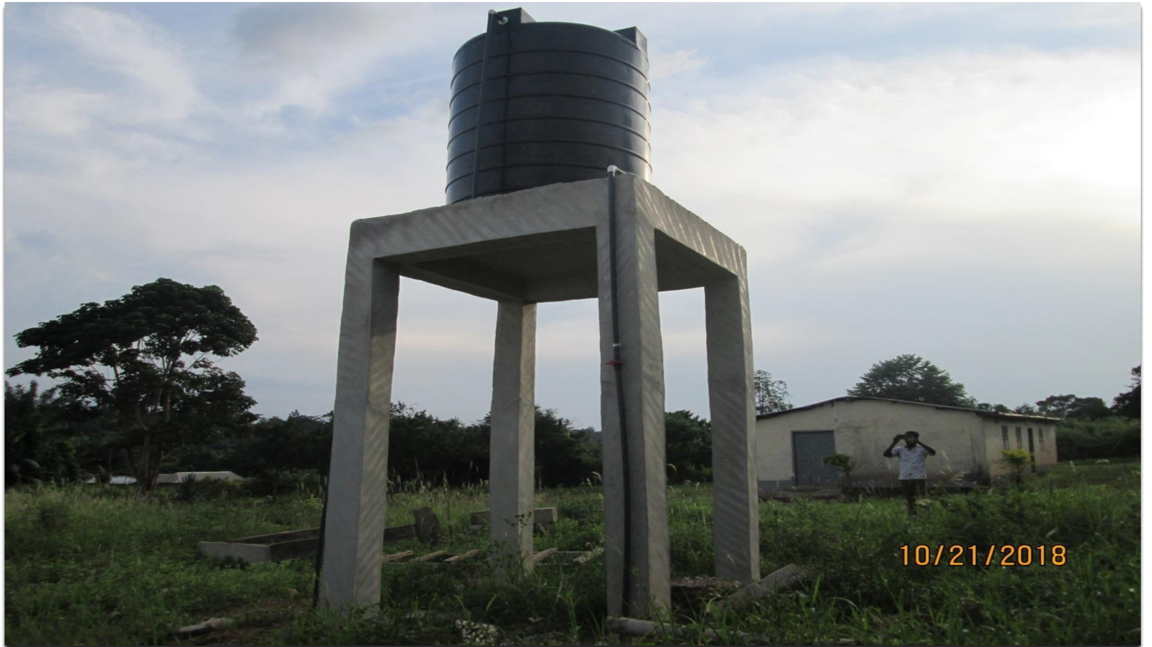
MECHANIZED BOREHOLE ATTACHED TO THE NURSES' QUARTERS AT SABRONUM, AHAFO ANO SOUTH DISTRICT