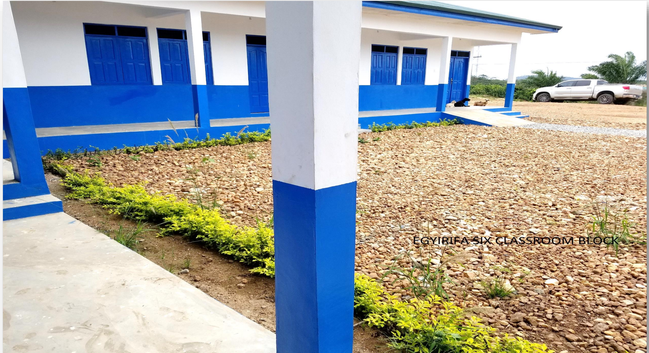
6-UNIT CLASSROOM WITH 8-SEATER LATRINE AT EGYIRIFA – CONT..., MFANTSEMAN MUNICIPALITY