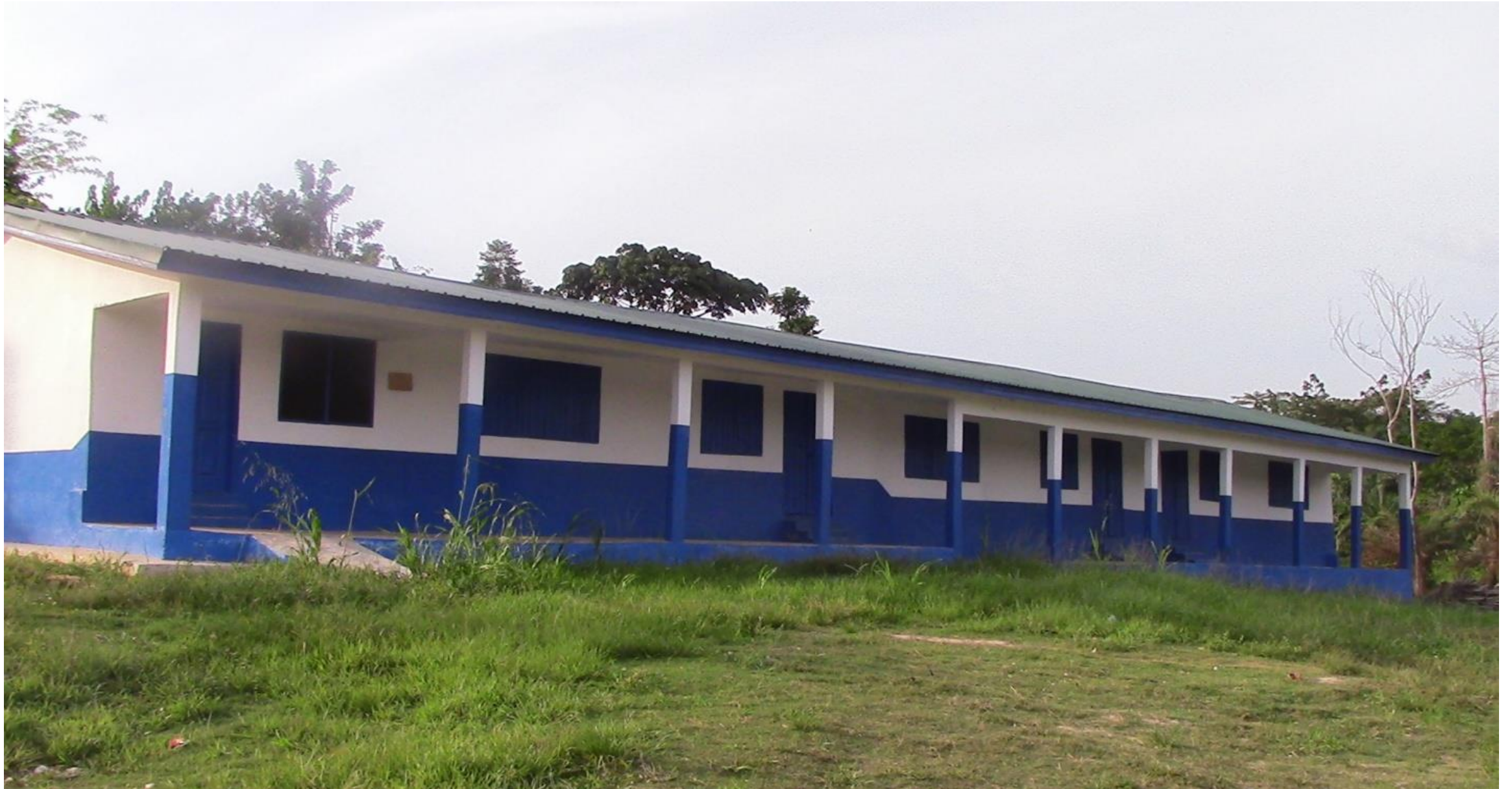
3-UNIT CLASSROOM BLOCK WITH 4-SEATER LATRINE AT MENSAHKROM, UPPER DENKYIRA WEST DISTRICT