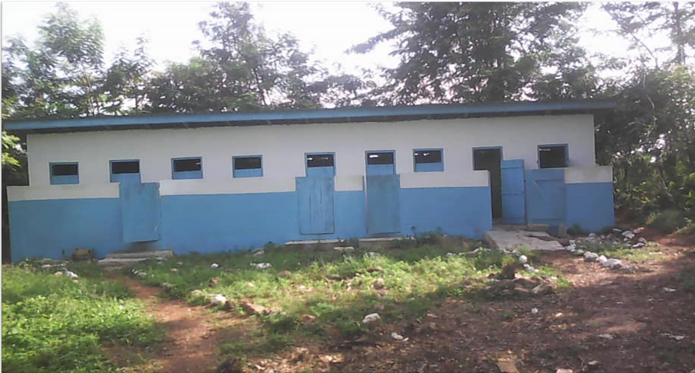
8-SEATER LATERINE ATTACHED TO THE 6-UNIT CLASSROOM BLOCK AT ASANKRAGUA, WASSA AMENFI WEST MUNICIPALITY