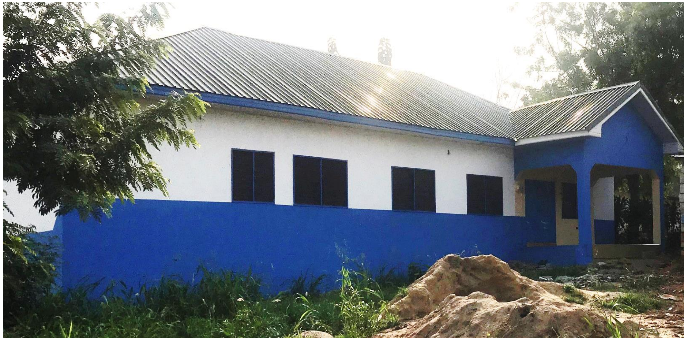
MATERNITY HOME WITH POTABLE WATER AT AHUMAH, FANTEAKWA DISTRICT