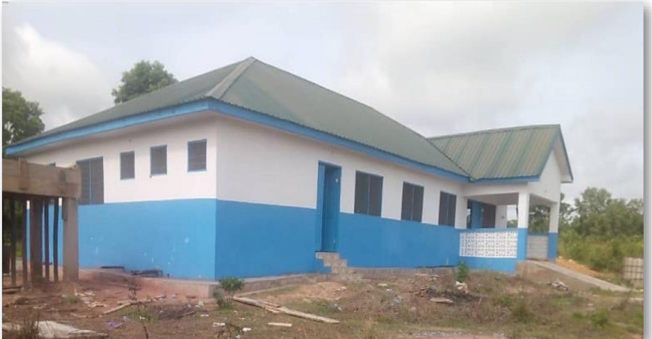
MATERNITY CENTER WITH MECHANIZED BOREHOLE AT BANTAMA, SENE WEST DISTRICT