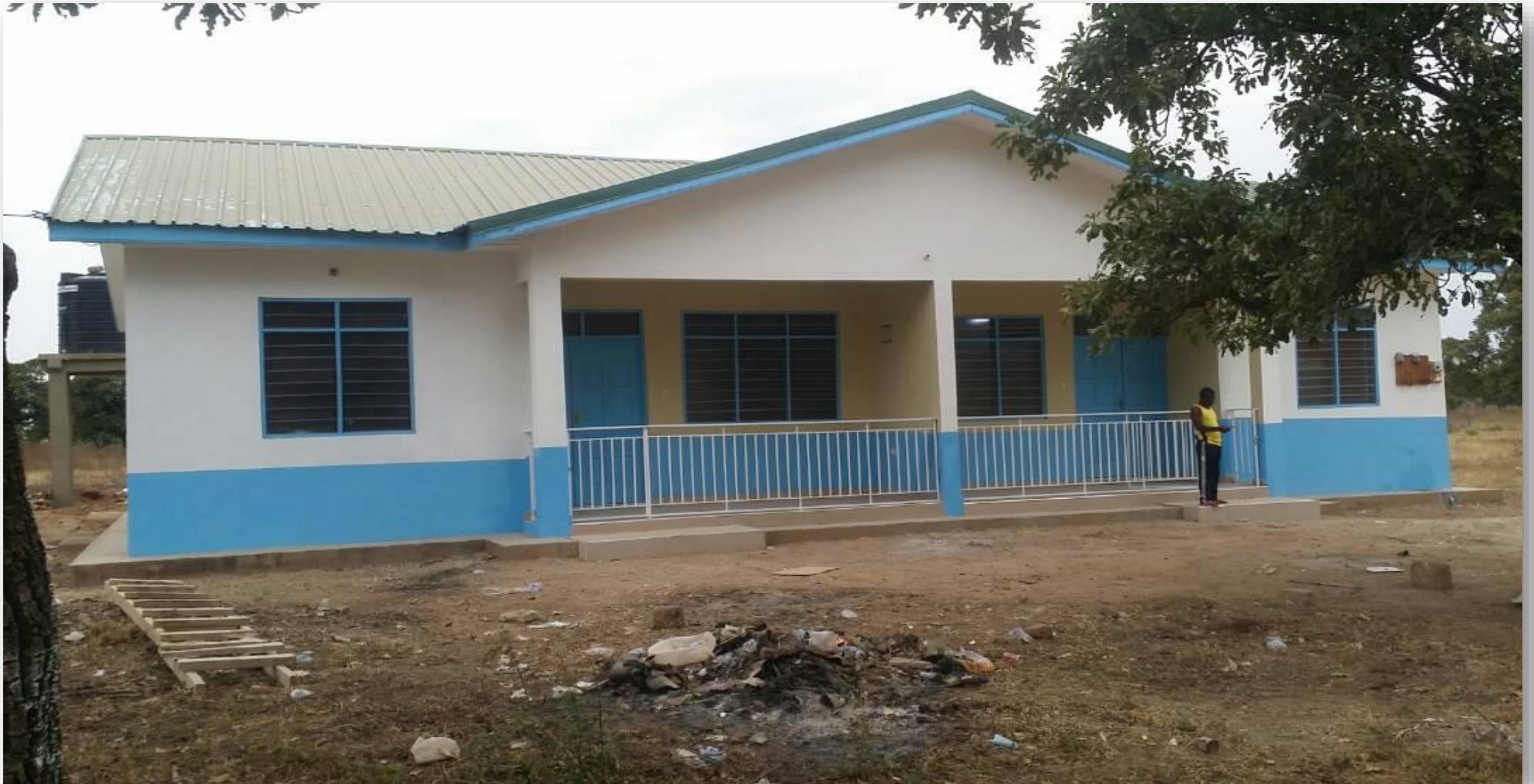
NURSES' QUARTERS WITH MECHANIZED BOREHOLE AT TUMU, SISSALA EAST DISTRICT