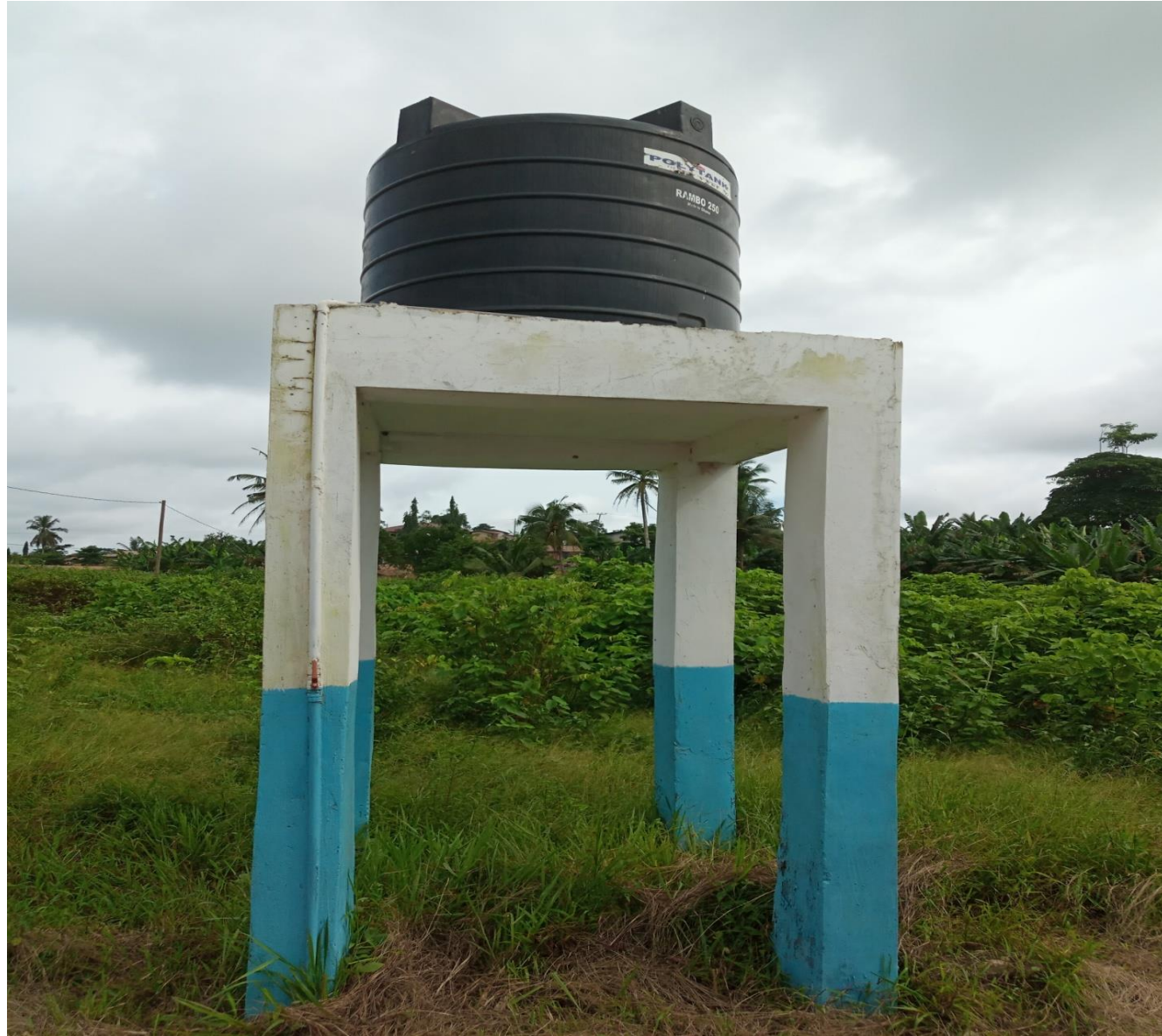
COMMUNITY MECHANIZED BOREHOLE AT NKENKENSO, AMENFI WEST MUNICIPALITY