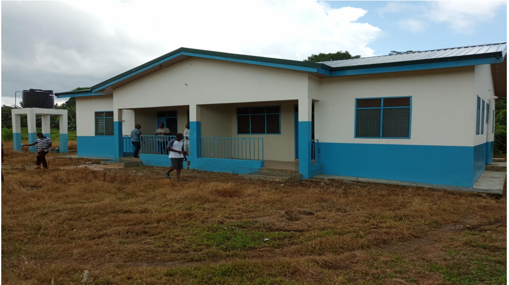
2-UNIT NURSES' WITH MECHANIZED BOREHOLE QUARTERS AT AMOAKU, WASSA AMENFI WEST MUNICIPALITY