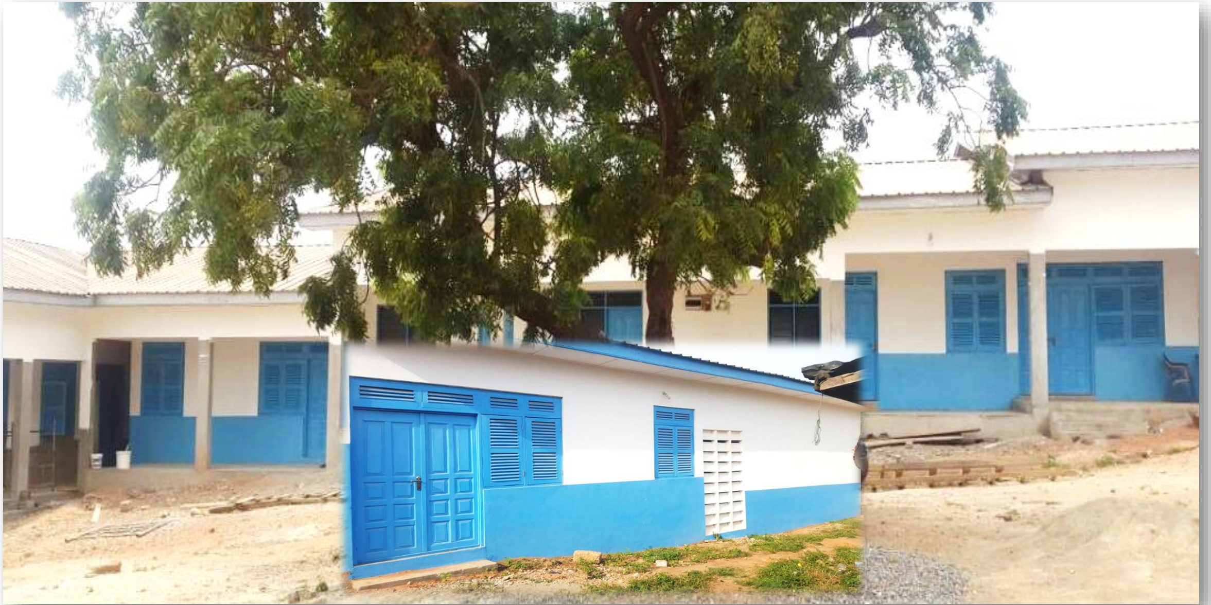
6-UNIT CLASSROOM BLOCK WITH 8-SEATER LATERINE AT AYI MENSAH, GA EAST MUNICIPALITY