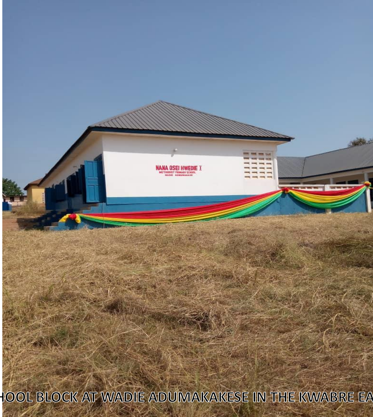
SCHOOL BLOCK AT WADIE ADUMAKAKESE IN THE KWABRE EAST DISTRICT