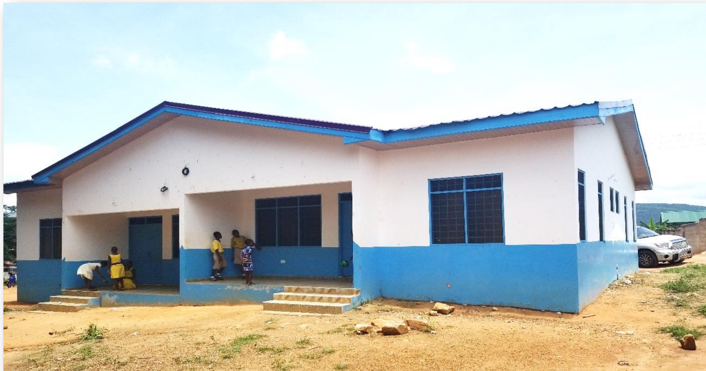
TEACHERS' QUARTERS WITH MECHANIZED BOREHOLE AT DANFA, GA EAST MUNICIPALITY