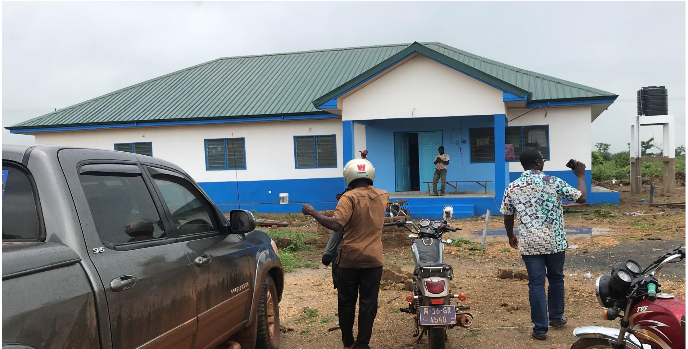
MATERNITY HOME WITH POTABLE WATER AT AZUA, NKWANTA NORTH DISTRICT