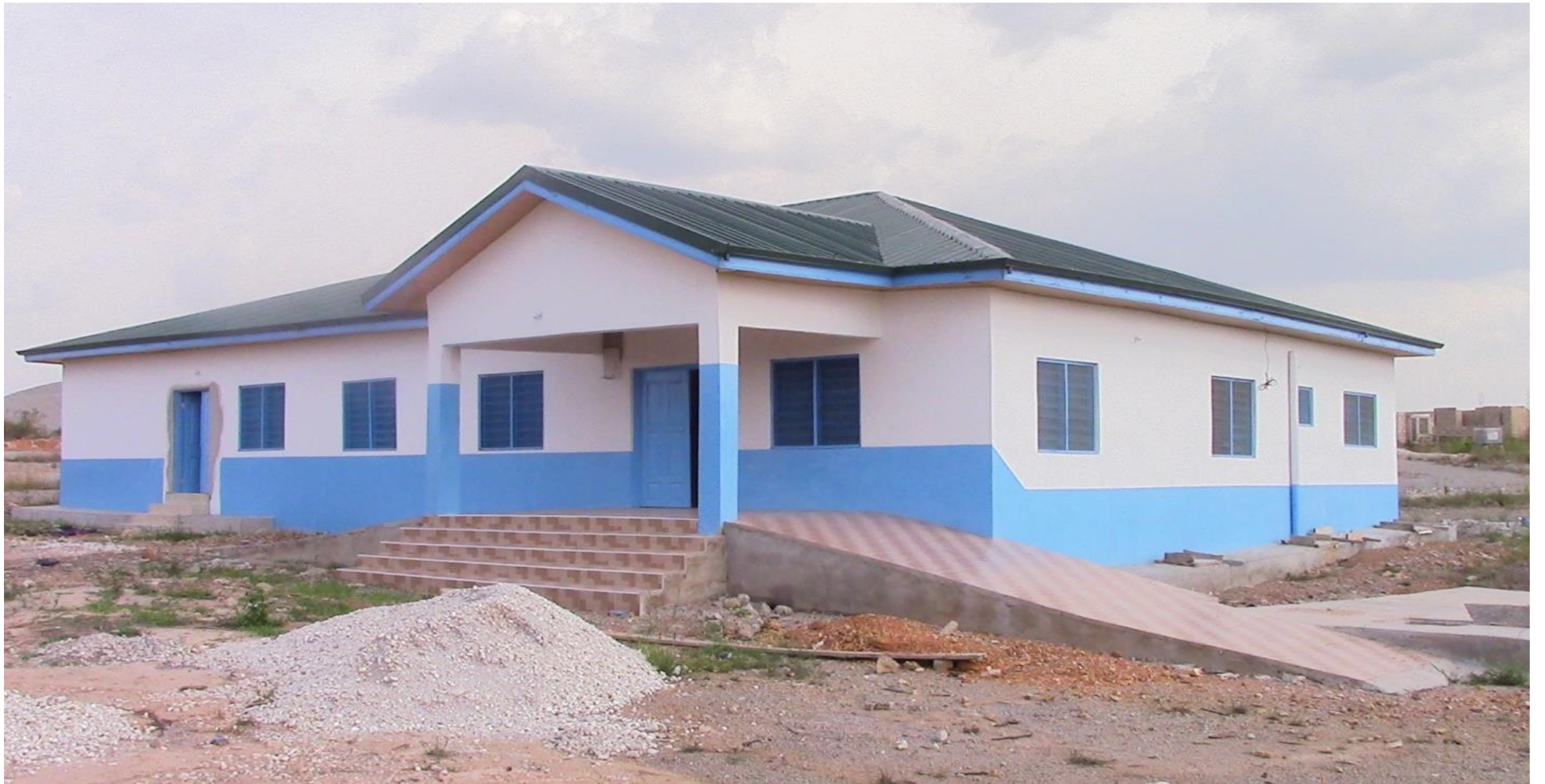
MATERNITY HOME WITH MECHANISED BOREHOLE AT AYANFURI, UPPER DENKYIRA WEST DISTRICT