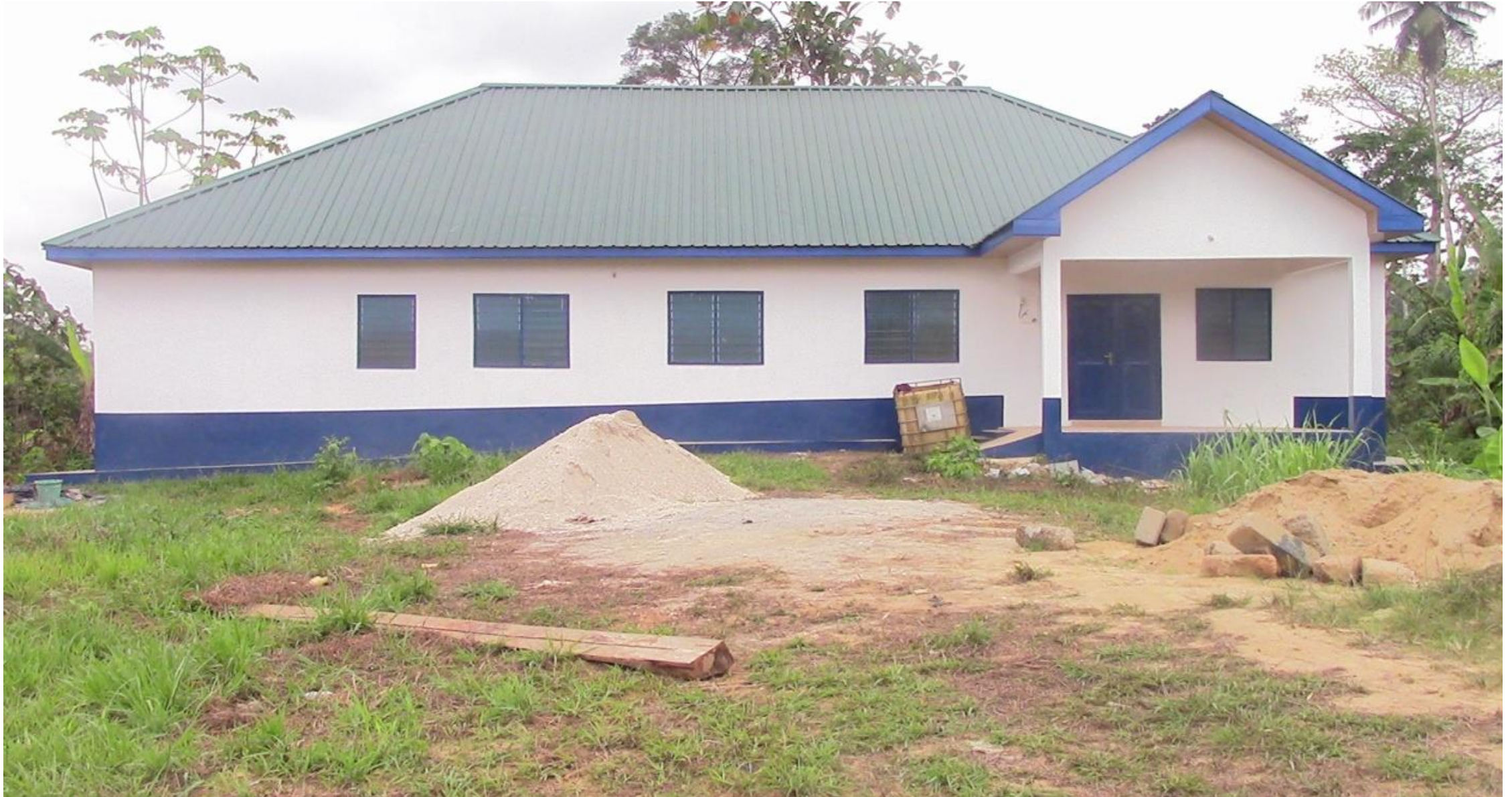
2-UNIT NURSES QUARTERS WITH MECHANIZED BOREHOLE AT GWIRA ESHIEM, NZEMA EAST MUNICIPALITY