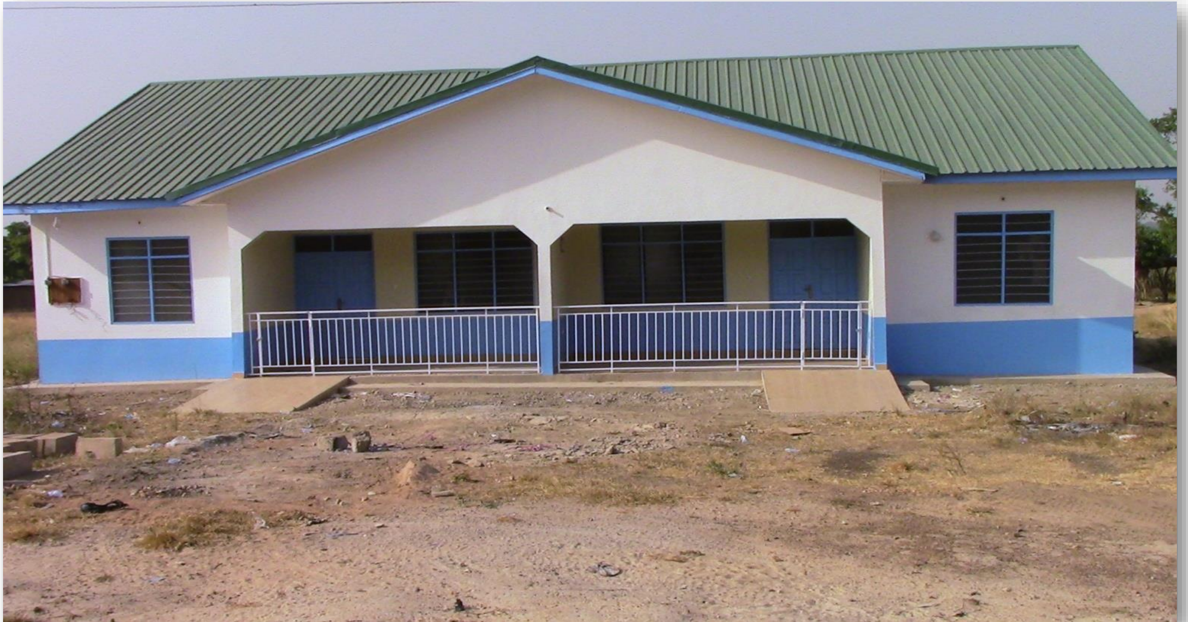
NURSES' QUARTERS WITH MECHANIZED BOREHOLE AT WECHIAU, WA WEST DISTRICT