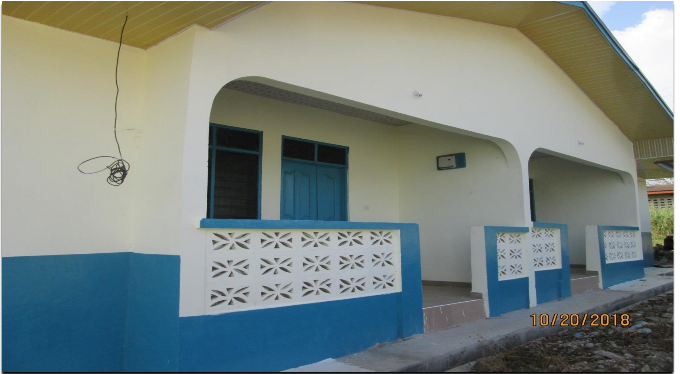
TEACHERS' QUARTERS WITH MECHANIZED BOREHOLE AT ASUKESE, AHAFO-ANO SOUTH DISTRICT