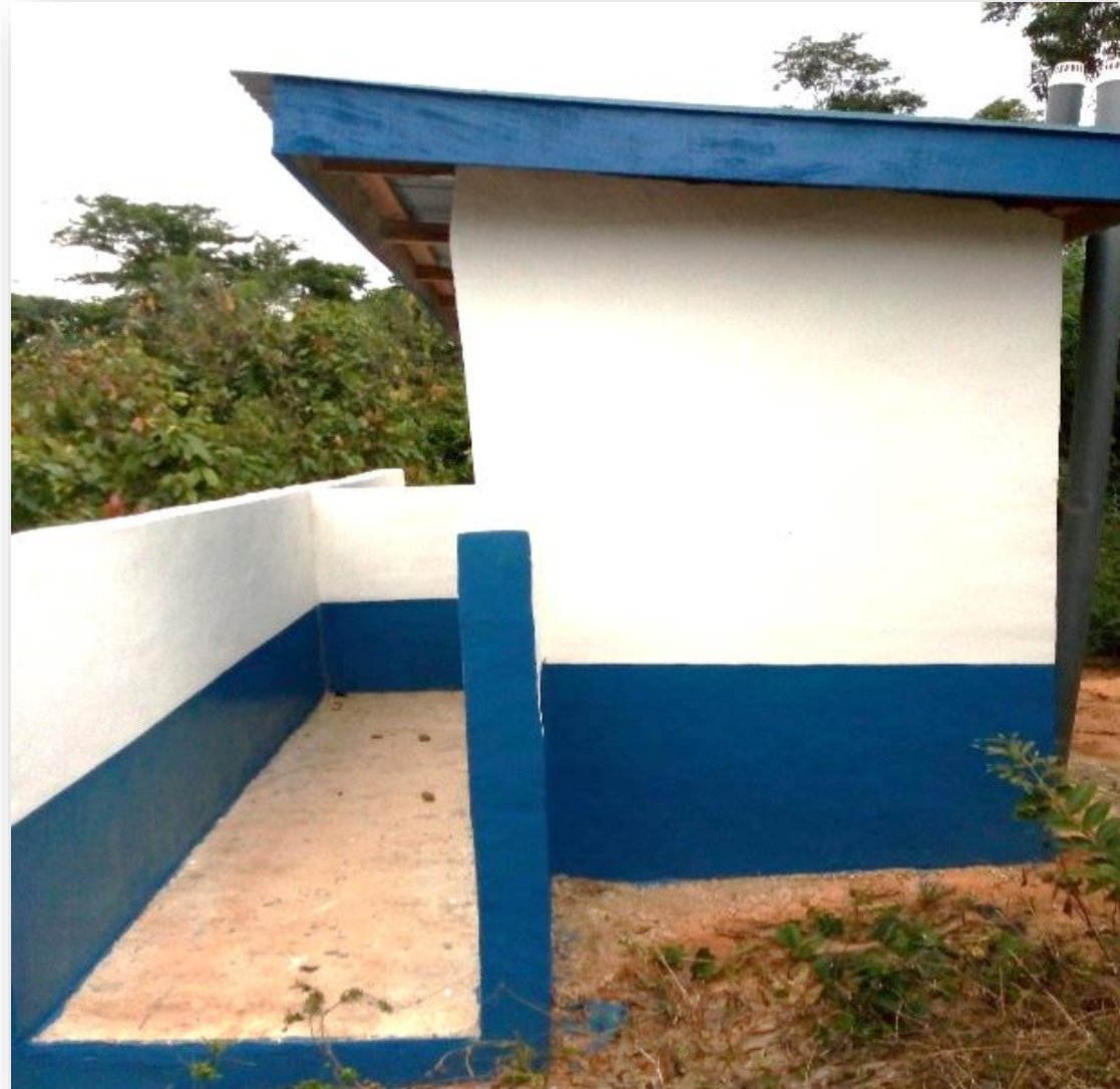
4-SEATER LATRINE ATTACHED TO THE 3-UNIT CLASSROOM BLOCK AT MENSAHKROM, UPPER DENKYIRA WEST DISTRICT