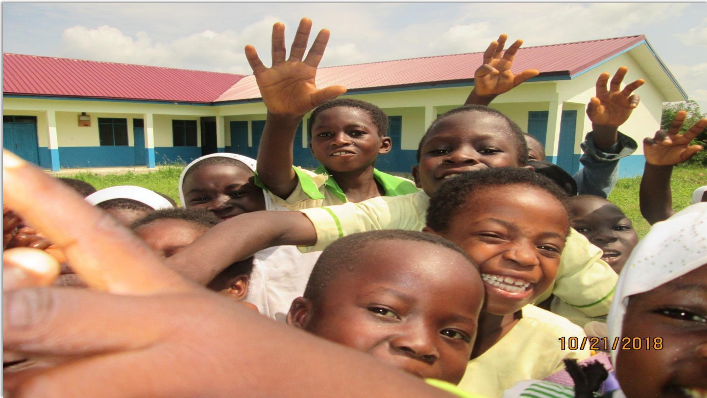
6-UNIT CLASSROOM BLOCK WITH 8-SEATER LATERINE AT SABRONUM – CONTINUED, AHAFO-ANO SOUTH DISTRICT