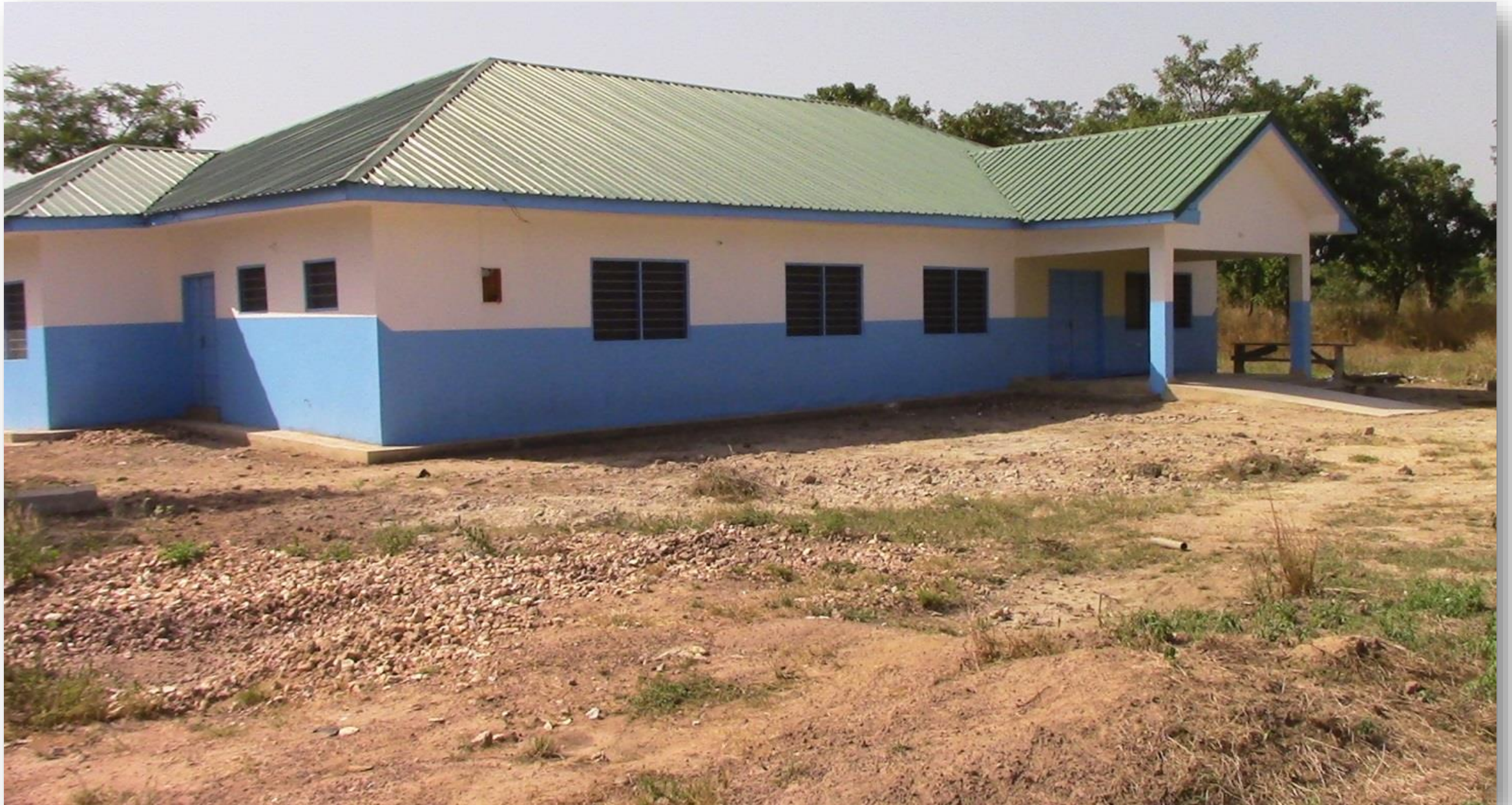
RURAL CLINIC WITH MECHANIZED BOREHOLE AT KUKPALI, WA WEST DISTRICT