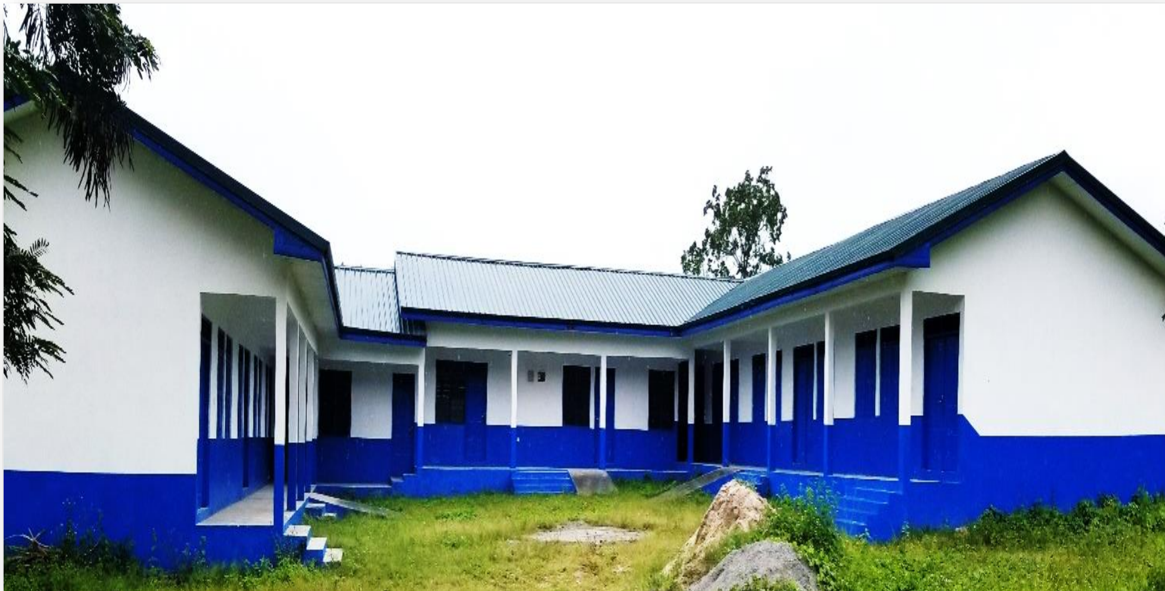
6-UNIT CLASSROOM BLOCK WITH 8-SEATER LATERINE AT AWORODO, MFANTSEMAN MUNICIPALITY