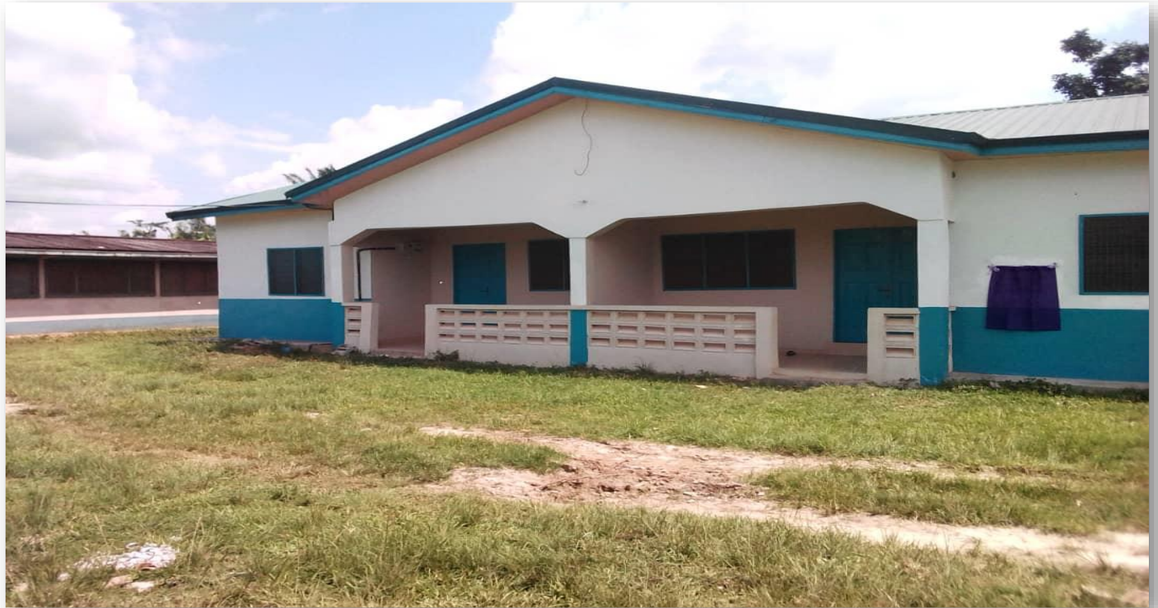
NURSES' QUARTERS WITH POTABLE WATER AT DIASO, UPPER DENKYIRA WEST DISTRICT