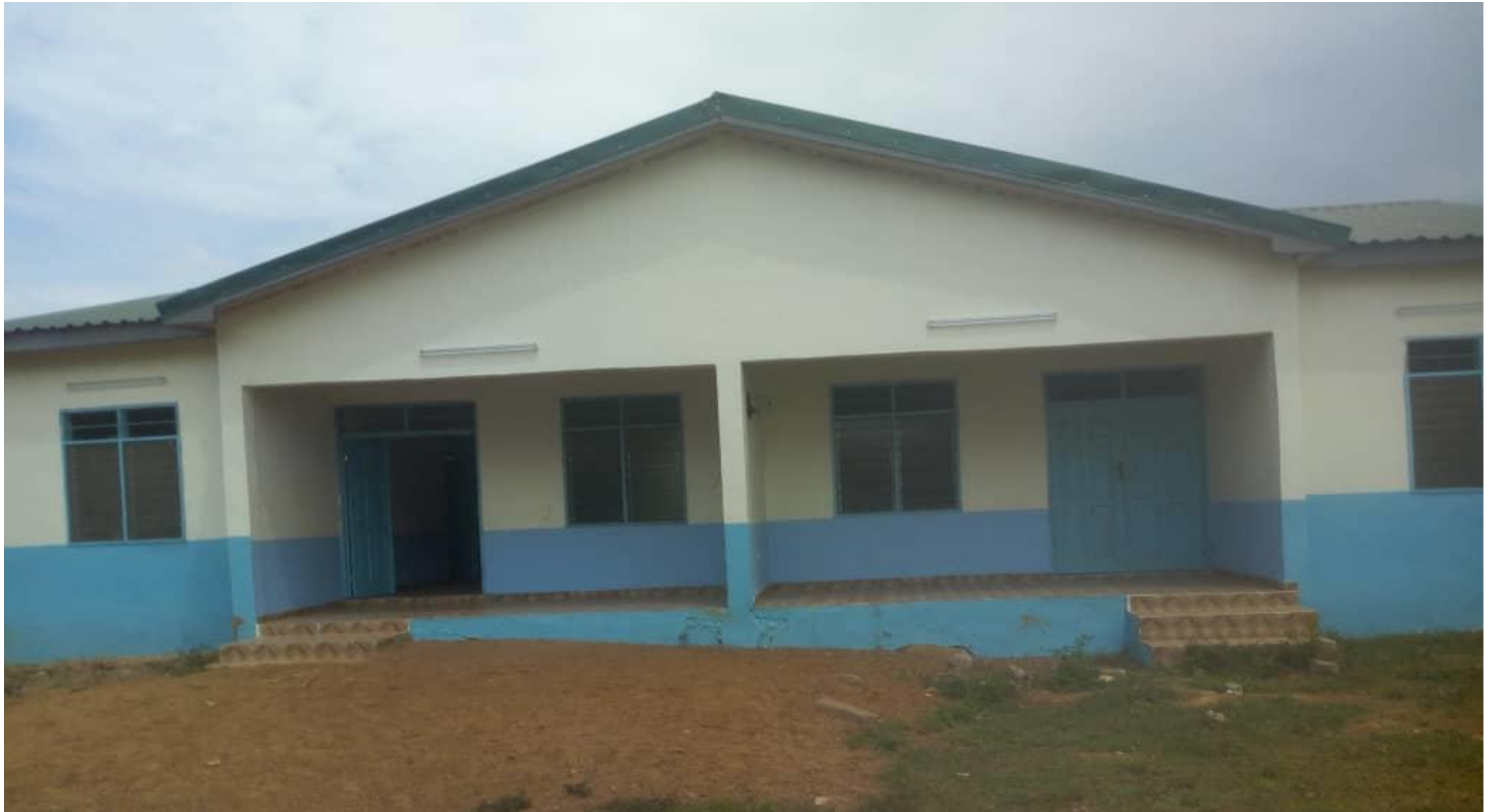
TEACHERS' QUARTERS AT SIRIGU, KASSANA NANKANA WEST DISTRICT