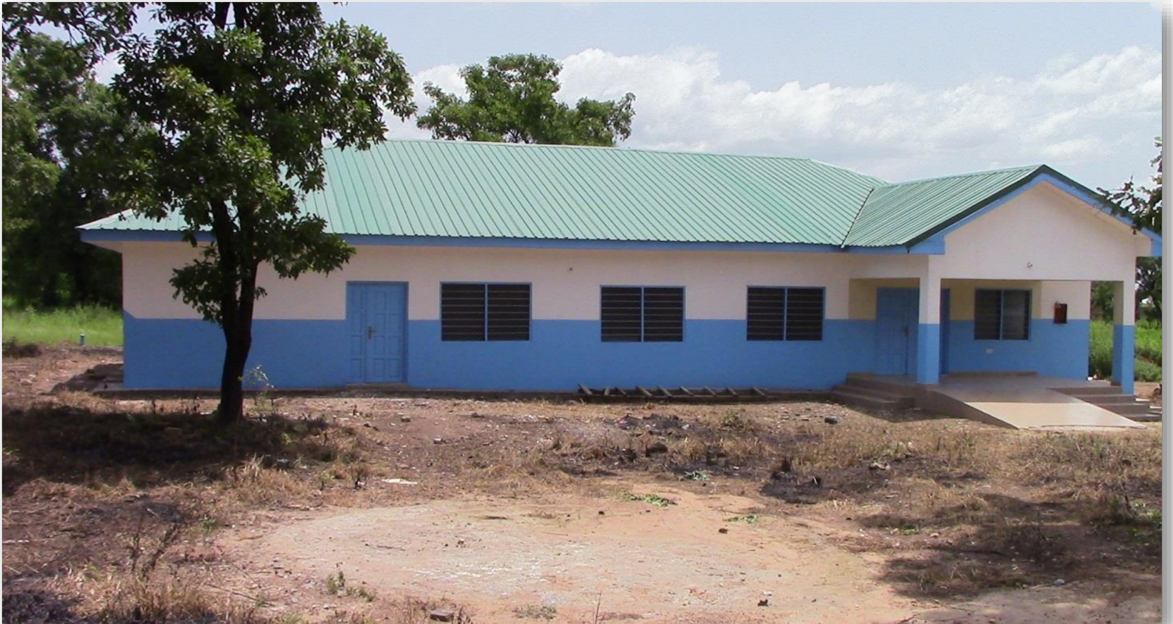
MATERNITY HOME WITH MECHANIZED BOREHOLE AT DORIMON, WA WEST DISTRICT