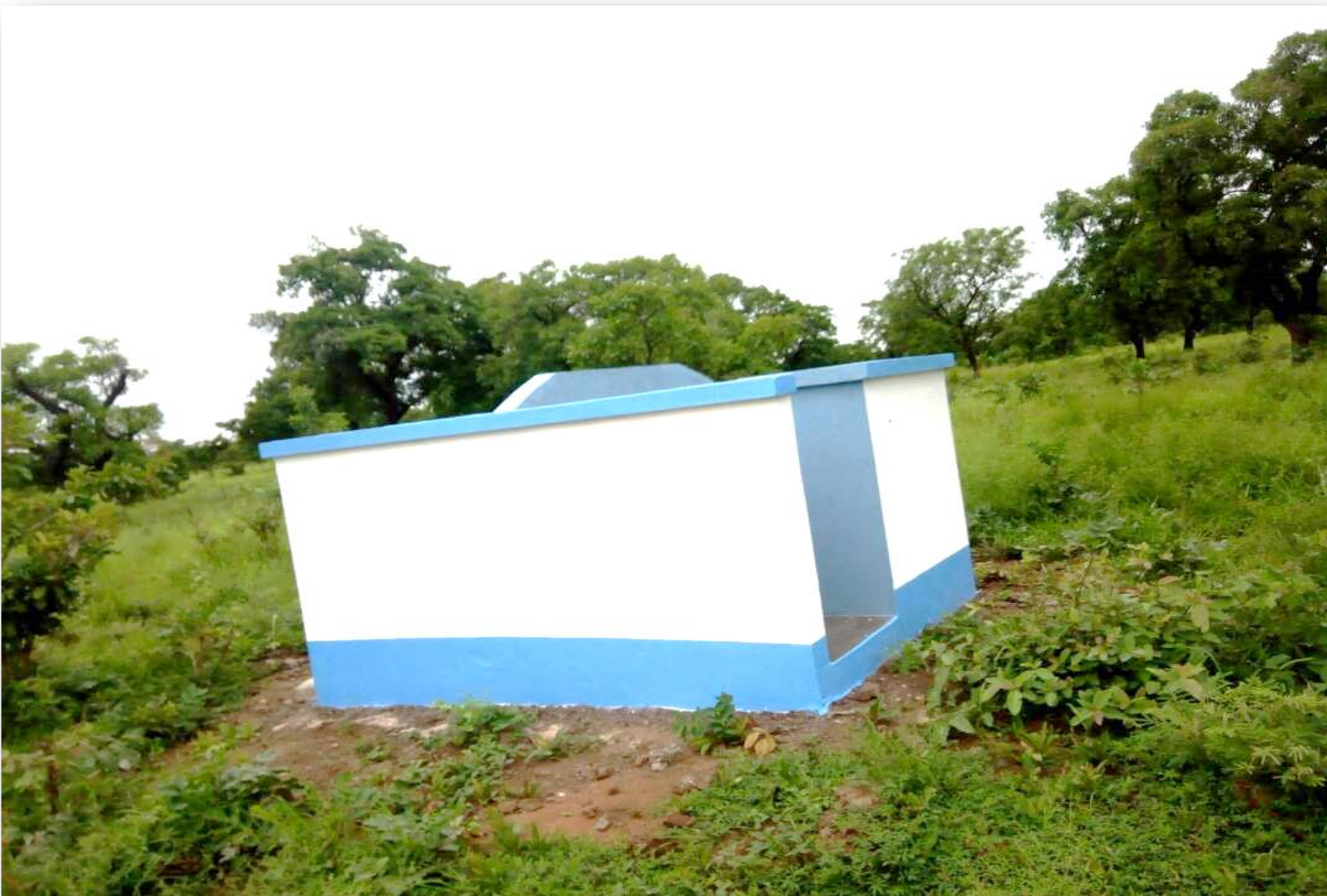
URINAL ATTACHED TO THE 6-UNIT CLASSROOM BLOCK AT WECHIAU, WA WEST DISTRICT