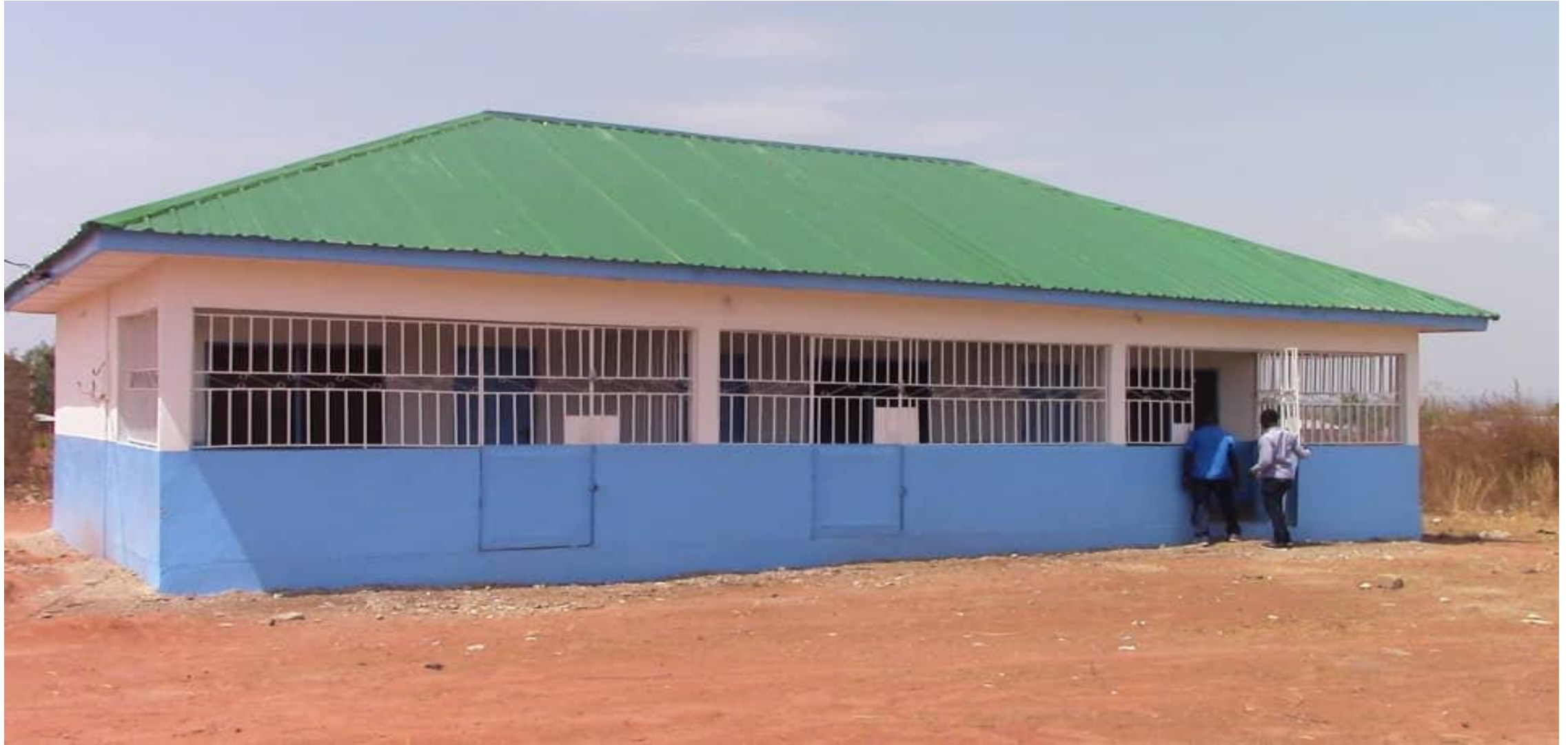
3-BEDROOM TEACHERS' QUARTERS AT KPERIGA, WEST MAMPRUSI MUNICIPALITY