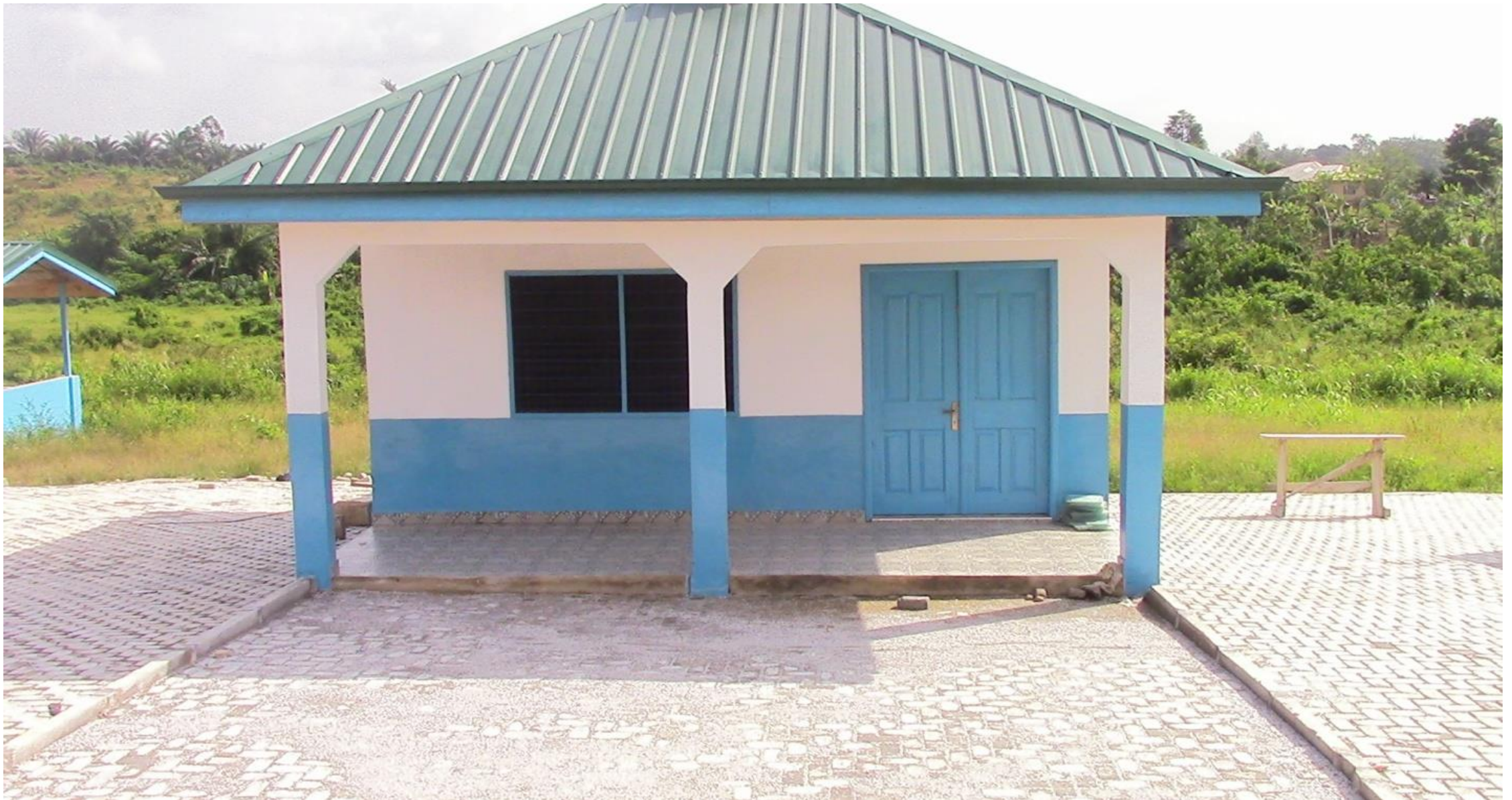
REVENUE BOOTH ATTACHED TO THE MARKET AT ASANKRAGUA, AMENFI WEST MUNICIPALITY