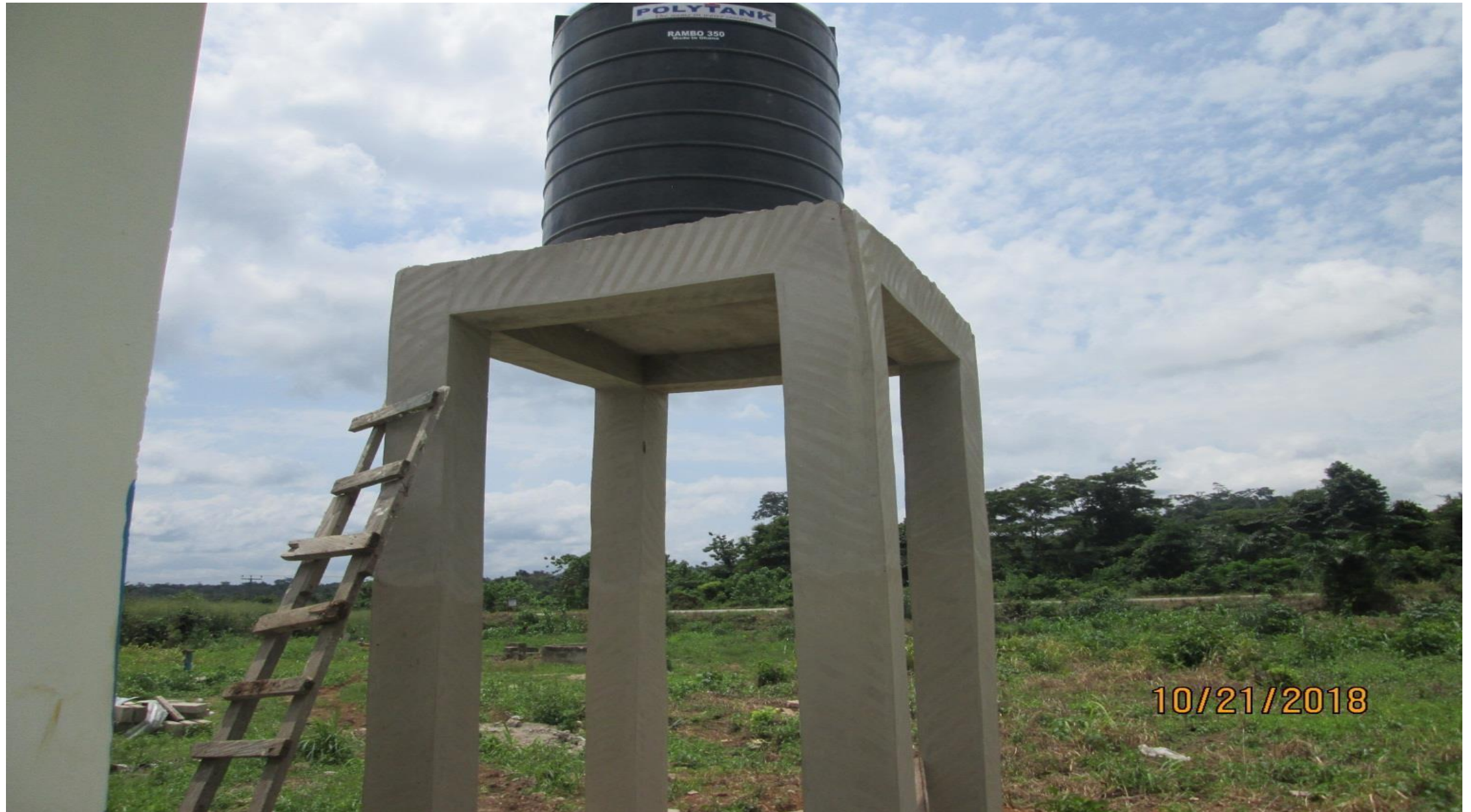
MECHANIZED BOREHOLE ATTACHED TO THE MATERNITY CENTER AT MEHAME, AHAFO ANO SOUTH DISTRICT