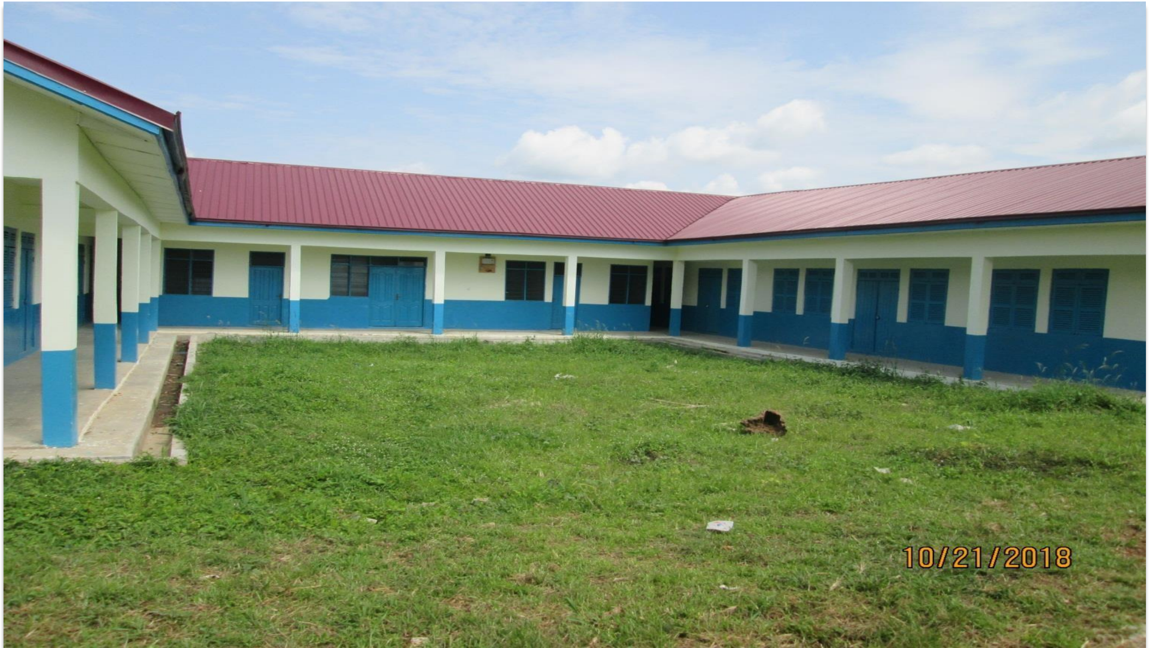
6-UNIT CLASSROOM BLOCK WITH 8-SEATER LATRINE AT SABRONUM, AHAFO-ANO SOUTH DISTRICT