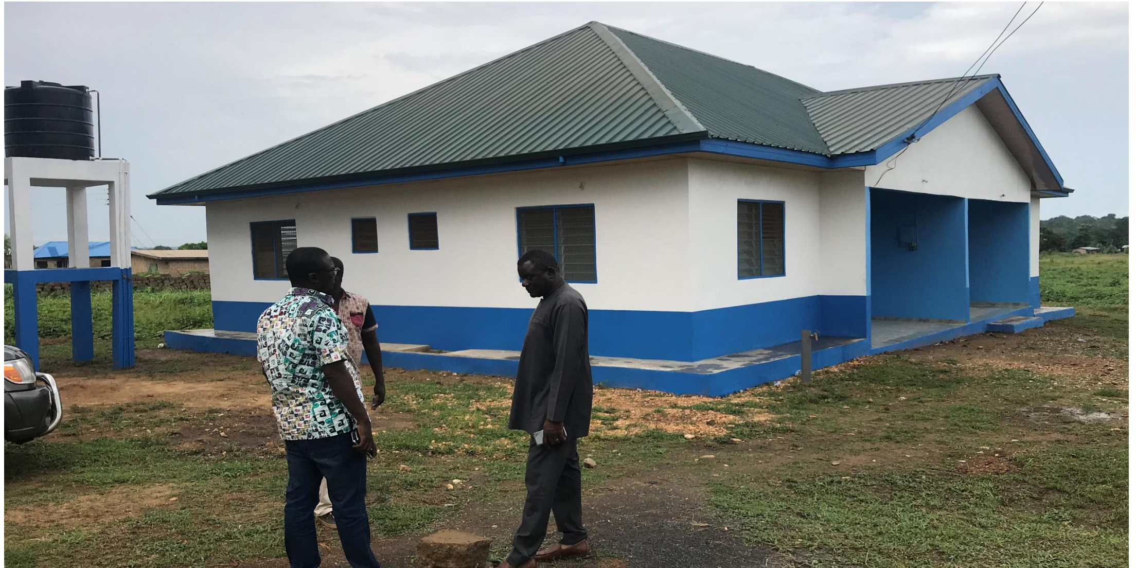
NURSES' QUARTERS WITH POTABLE WATER AT KPASSA, NKWANTA NORTH DISTRICT