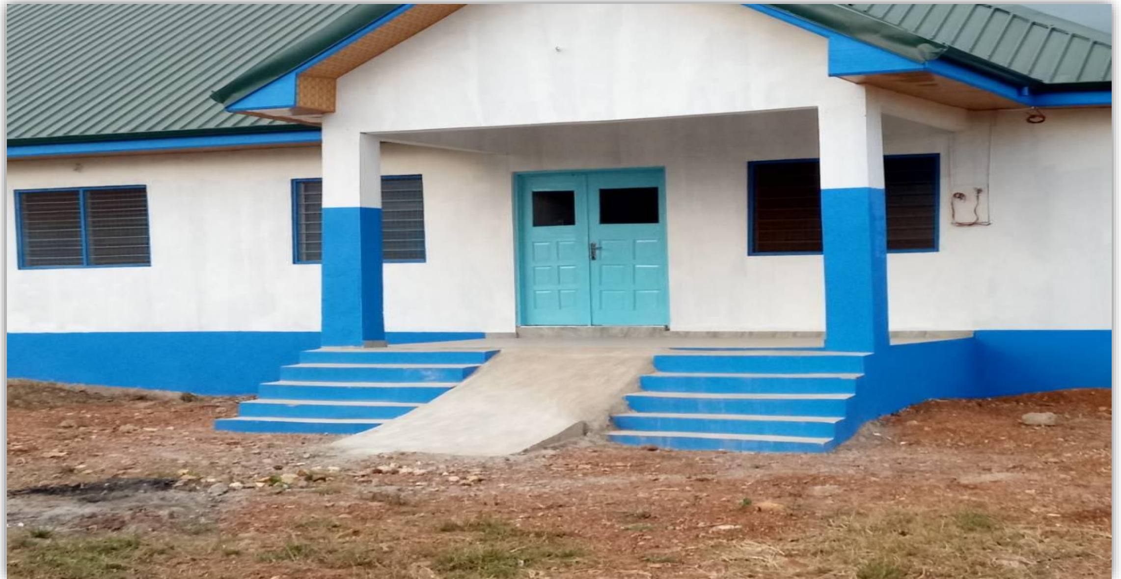
MATERNITY HOME WITH MECHANIZED BOREHOLE AT ABUTIA KISSIFLUI, HO WEST DISTRICT