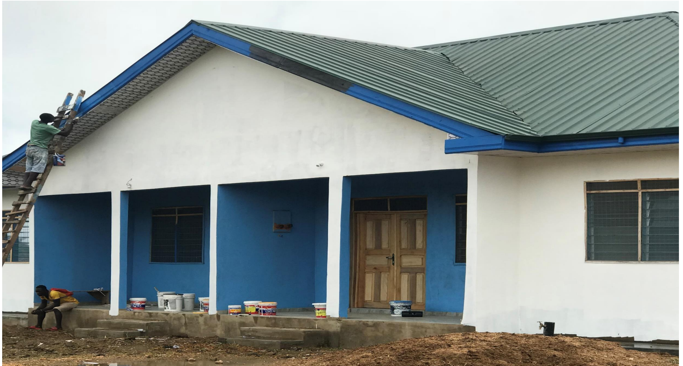
NURSES' QUARTERS WITH POTABLE WATER AT AZUA, NKWANTA NORTH DISTRICT