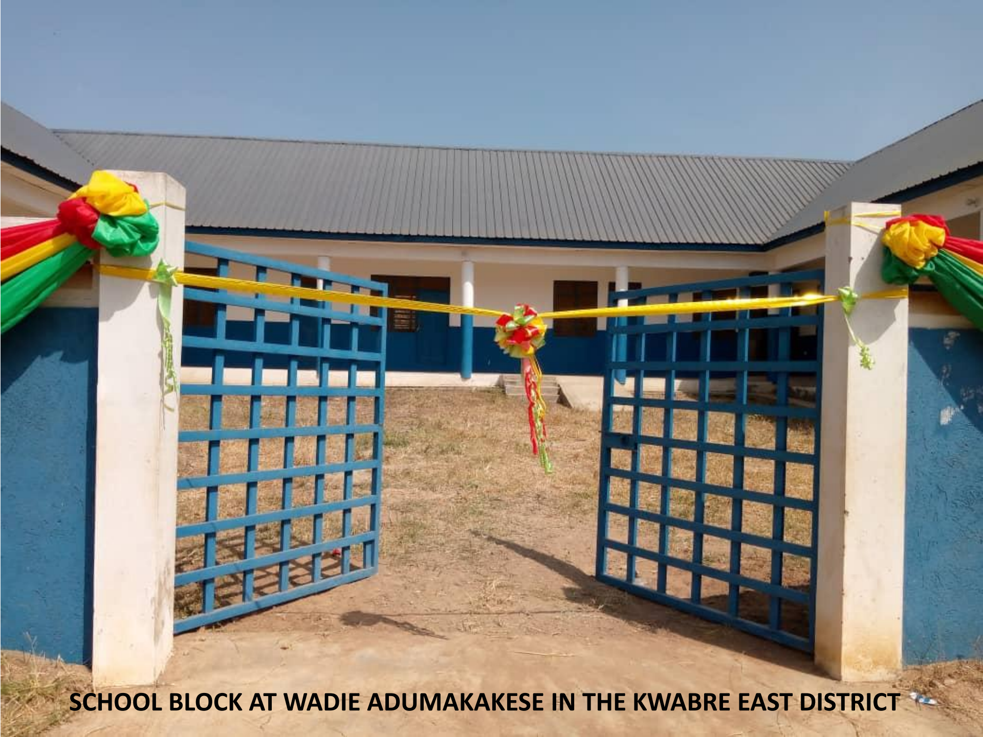
SCHOOL BLOCK AT WADIE ADUMAKAKESE IN THE KWABRE EAST DISTRICT