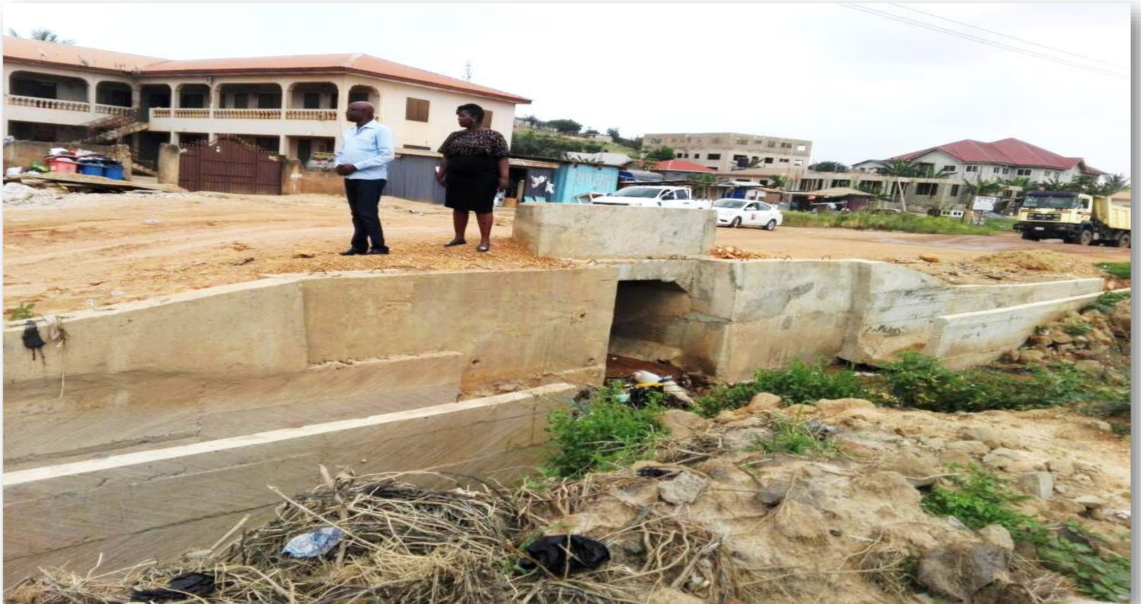
DOUBLE CULVERT AT ASHONGMAN-PURE WATER, GA EAST MUNICIPALITY