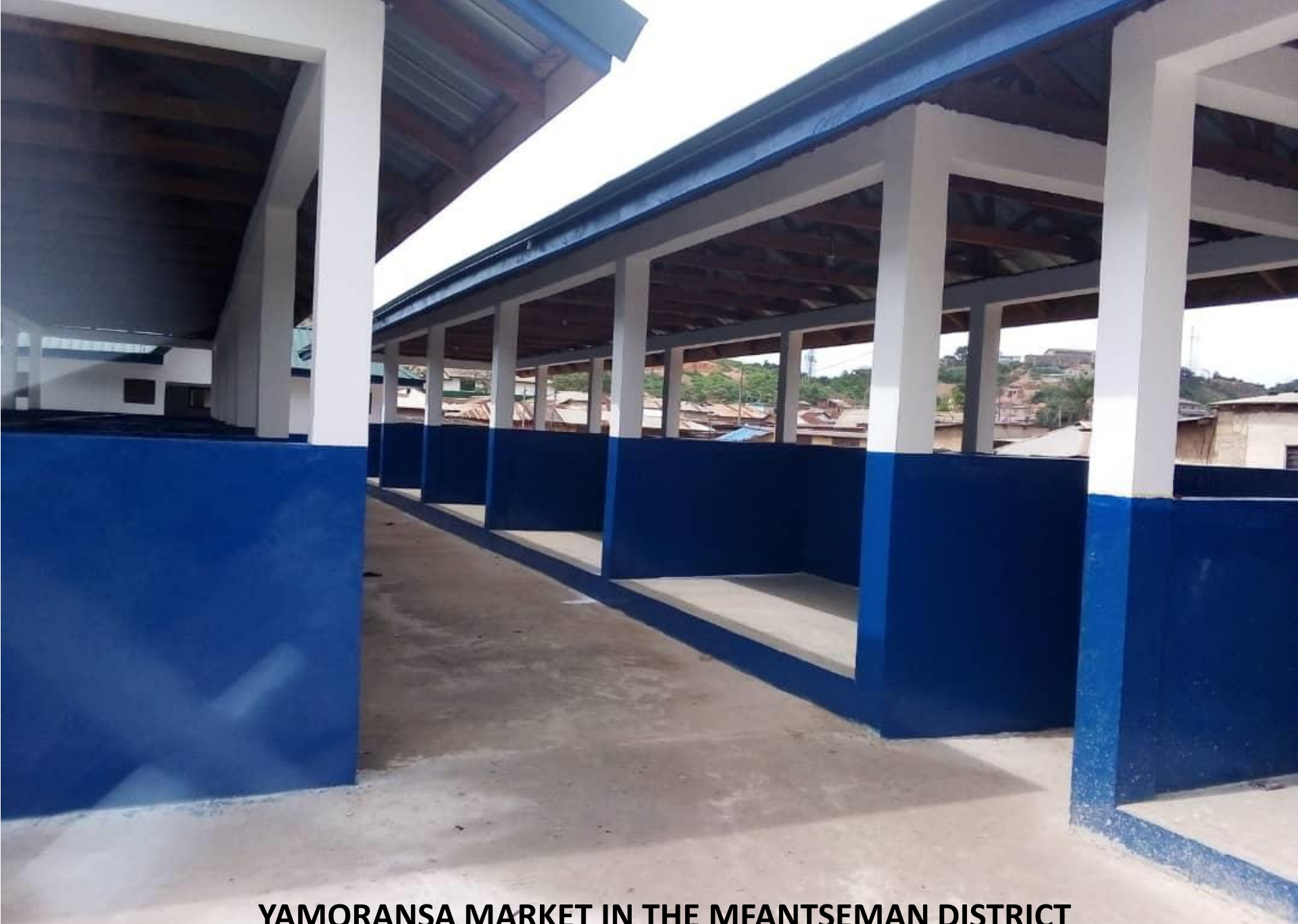
YAMORANSA MARKET IN THE MFANTSEMAN DISTRICT