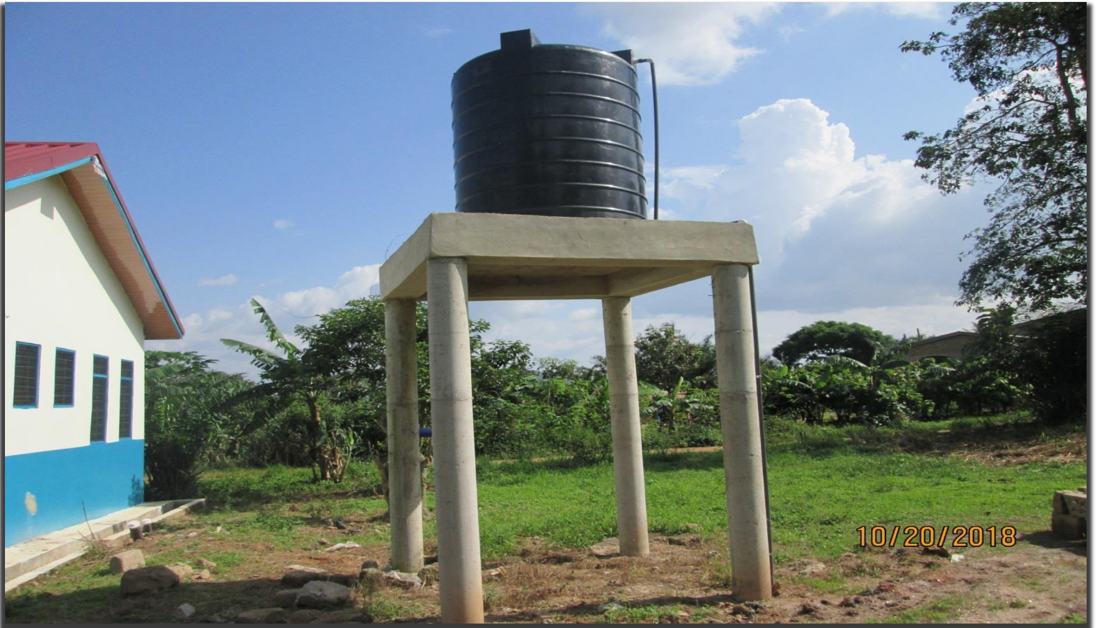
MECHANIZED BOREHOLE ATTACHED TO THE NURSES' QUARTERS AT ADWUMAKAASEKESE, AFIGYA KWABRE DISTRICT