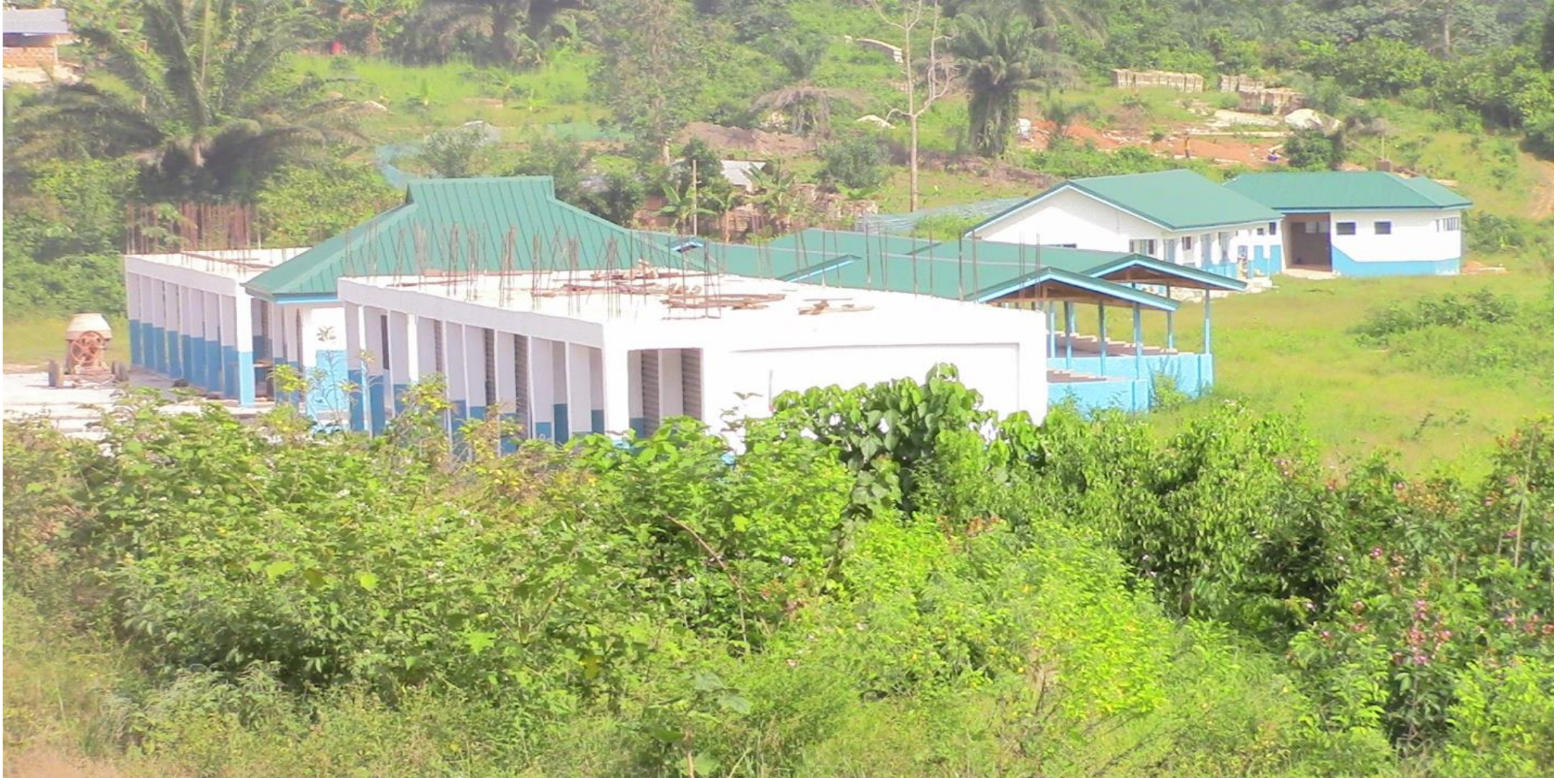
15-UNIT LOCKABLE STORES AT ASANKRAGUA, AMENFI WEST MUNICIPALITY