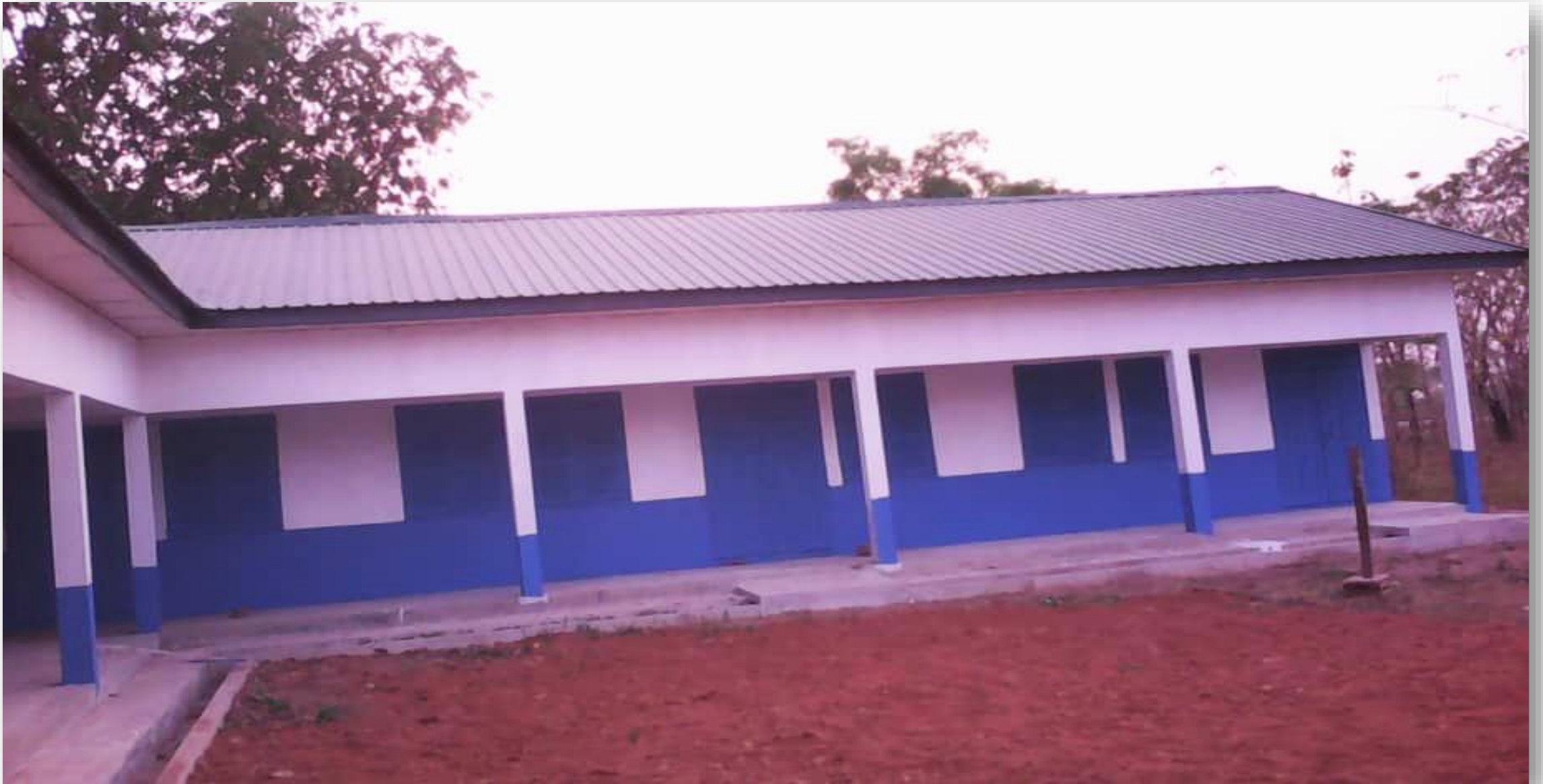
6-UNIT CLASSROOM BLOCK WITH 8-SEATER LATERINE AT KYEAMEKROM, SENE WEST DISTRICT