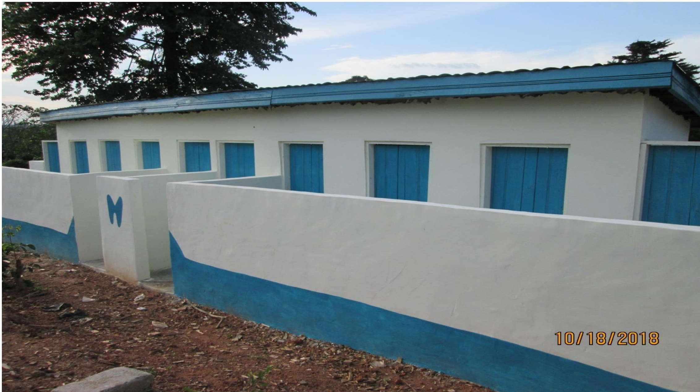
8-SEATER LATRINE ATTACHED TO THE 6-UNIT CLASSROOM BLOCK AT TETREM, AFIGYA KWABRE DISTRICT