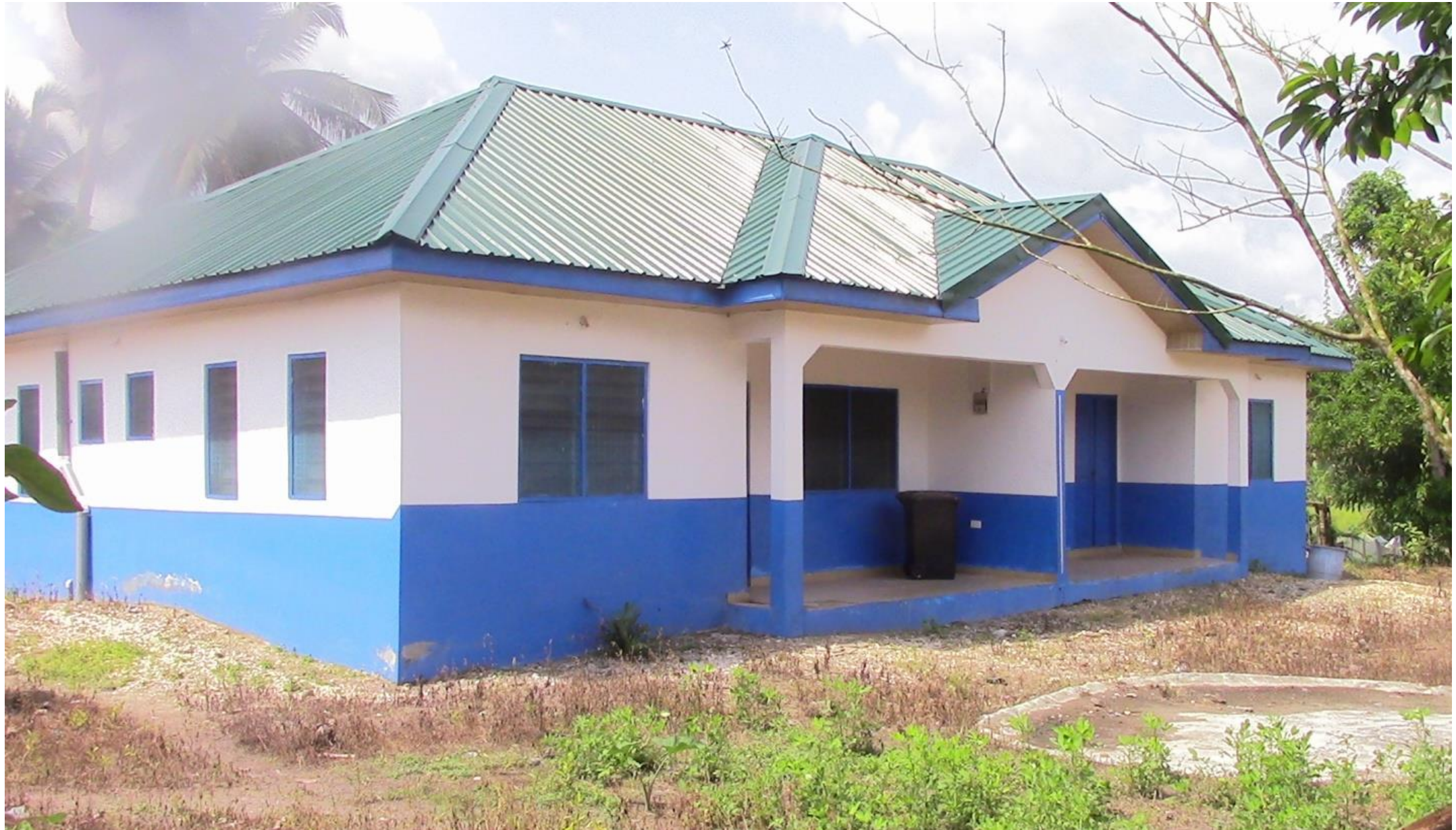
2-UNIT NURSES QUARTERS WITH MECHANIZED BOREHOLE AT GWIRA BANSO, NZEMA EAST MUNICIPALITY